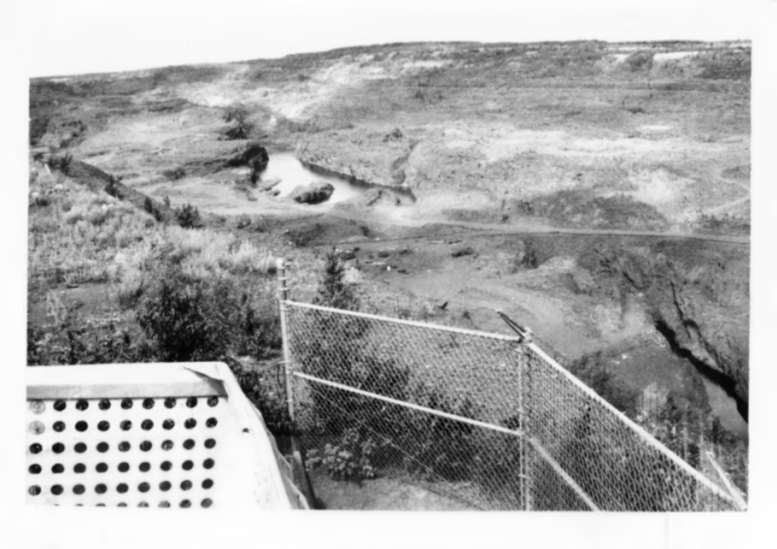
View from observation platform