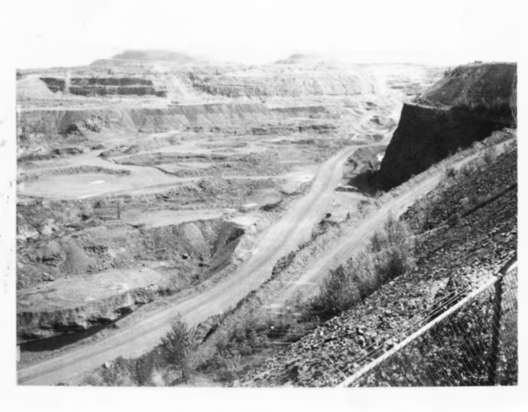
View from observation platform