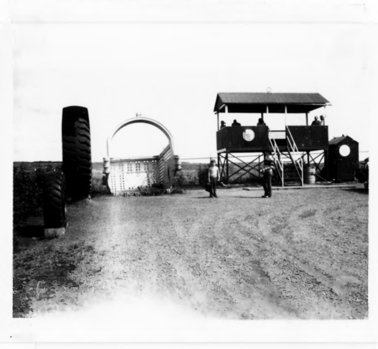
Viewing platform near Hibbing, MN.