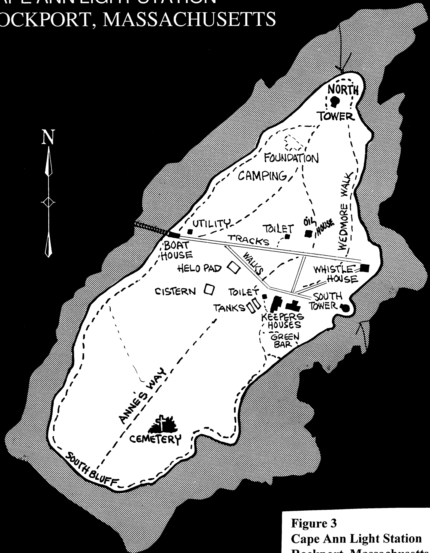
Figure 3 Cape Ann Light Station Rockport, Massachusetts Map of Thatcher Island