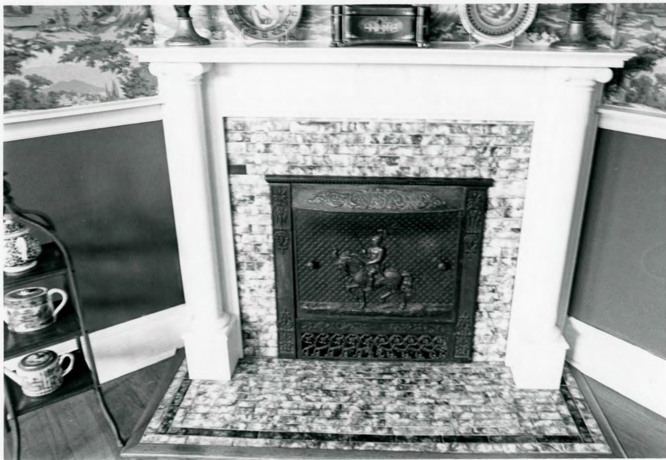
Coolidge House Helena, Arkansas November, 1982 Negative on file at AHPP Mantel