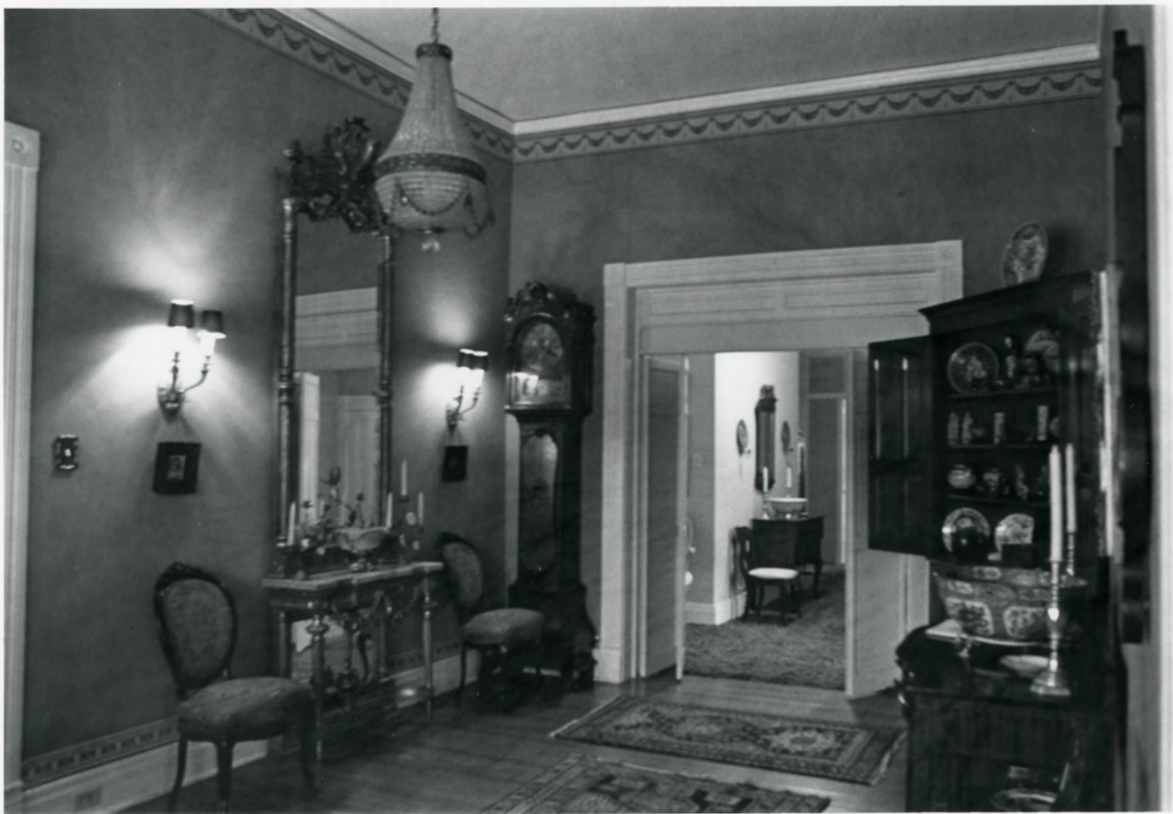
Coolidge House Helena, Arkansas November, 1982 Negative on file at AHPP Hallway