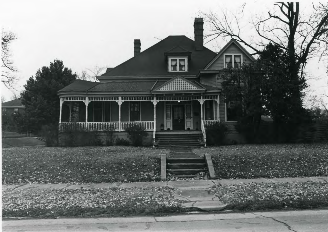
Coolidge House Helena, Arkansas November, 1982 Negative on file at AHPP Viewed from the South