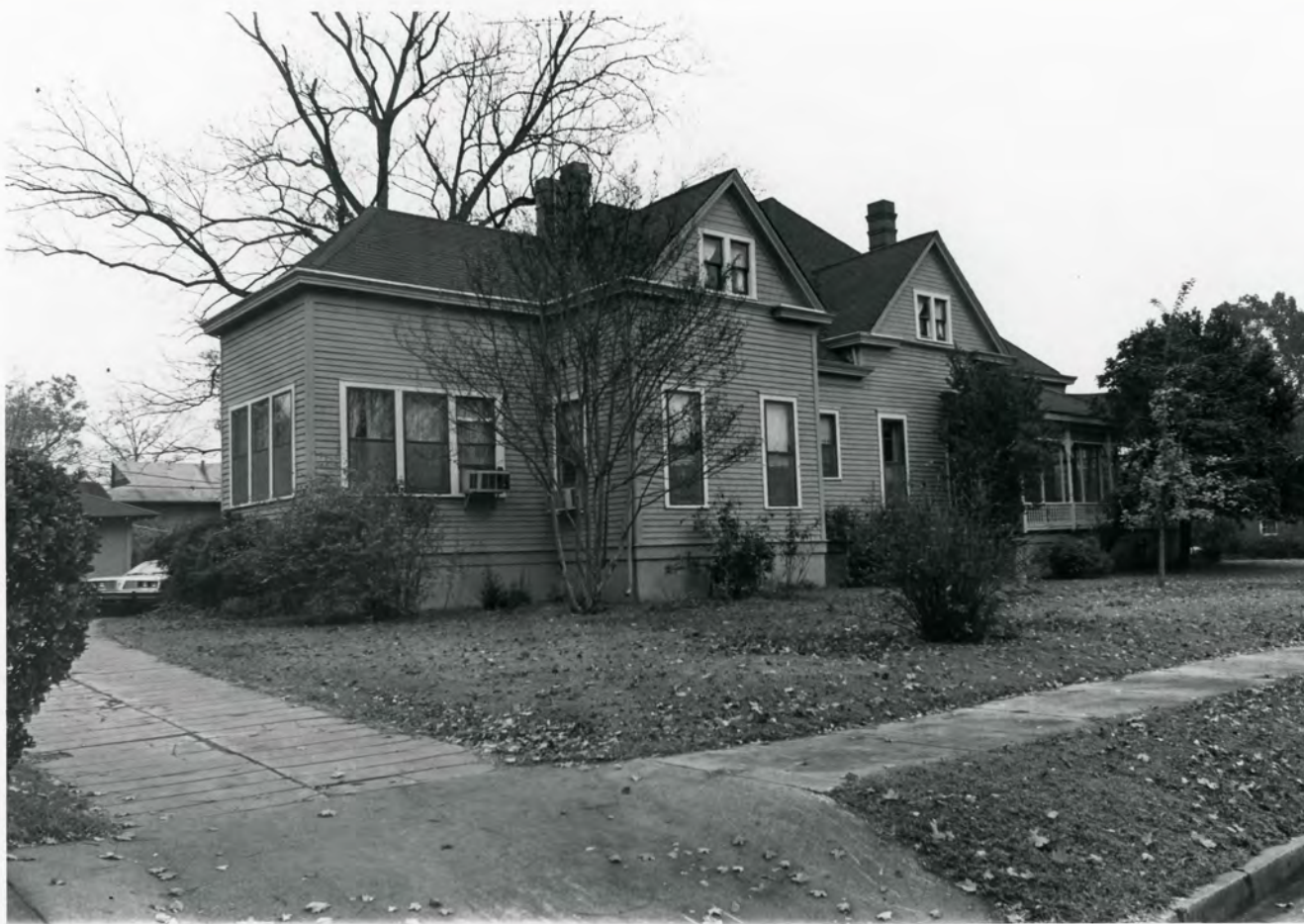
Cooldige House Helena, Arkansas November, 1982 Negative on file at AHPP Viewed from the Northwest