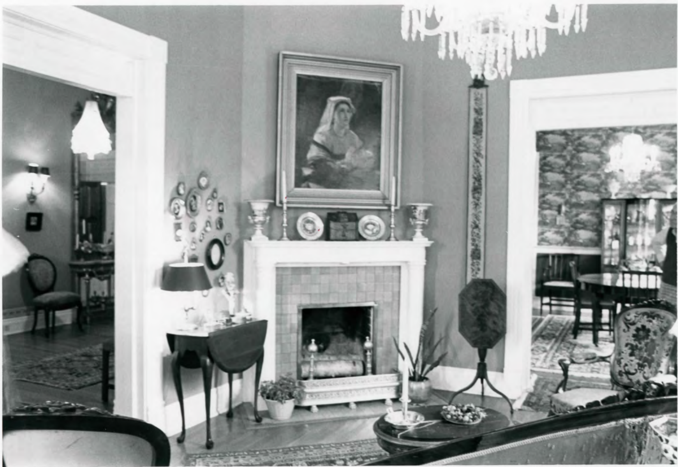
Coolidge House Helena, Arkansas November, 1982 Negative on file at AHPP Parlor