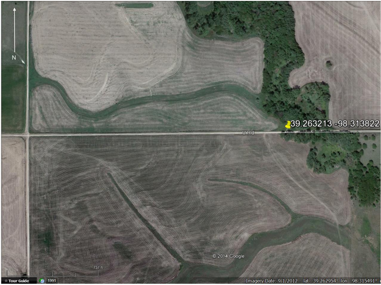
Figure 2: Close-in Map: North Rock Creek Bridge Location (Google Earth)

Mitchell County, Kansas County and State