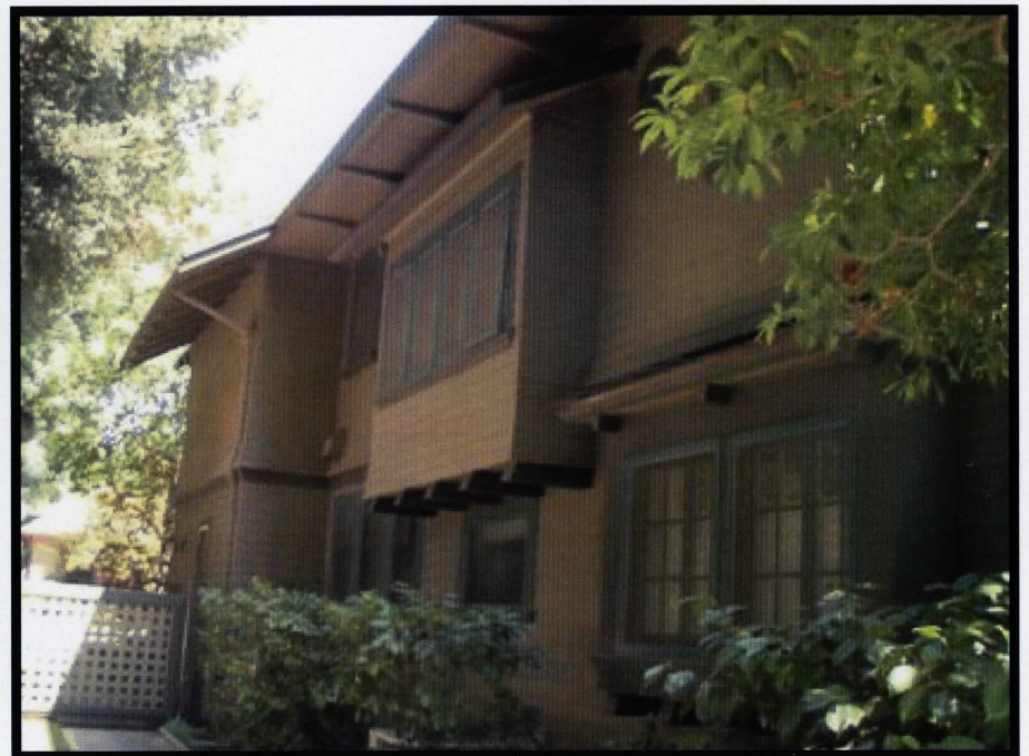
CA_Los Angeles County_George B Post House_0004