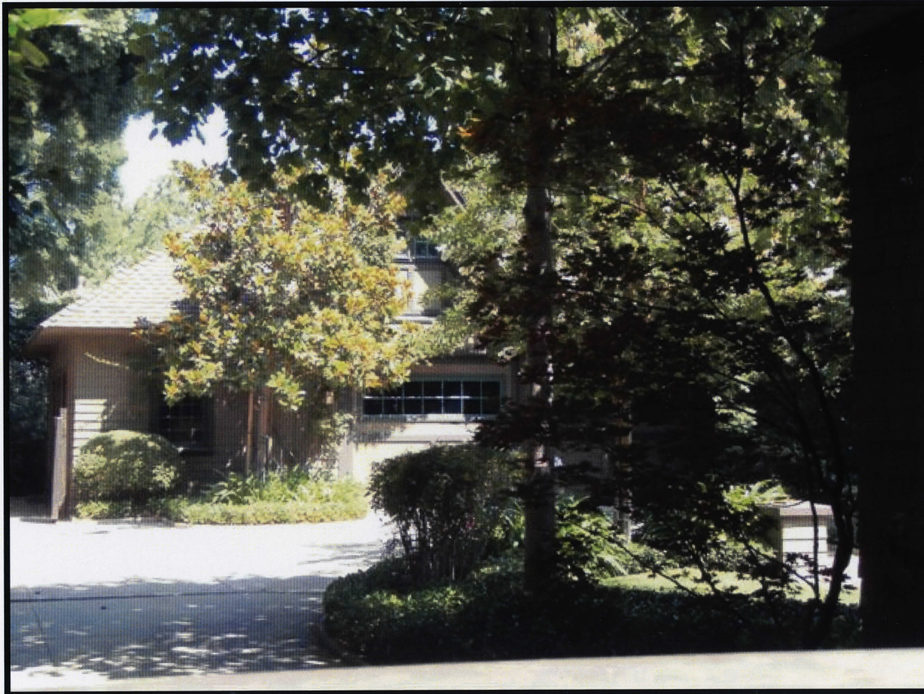
CA_Los Angeles County_George B Post House_0005