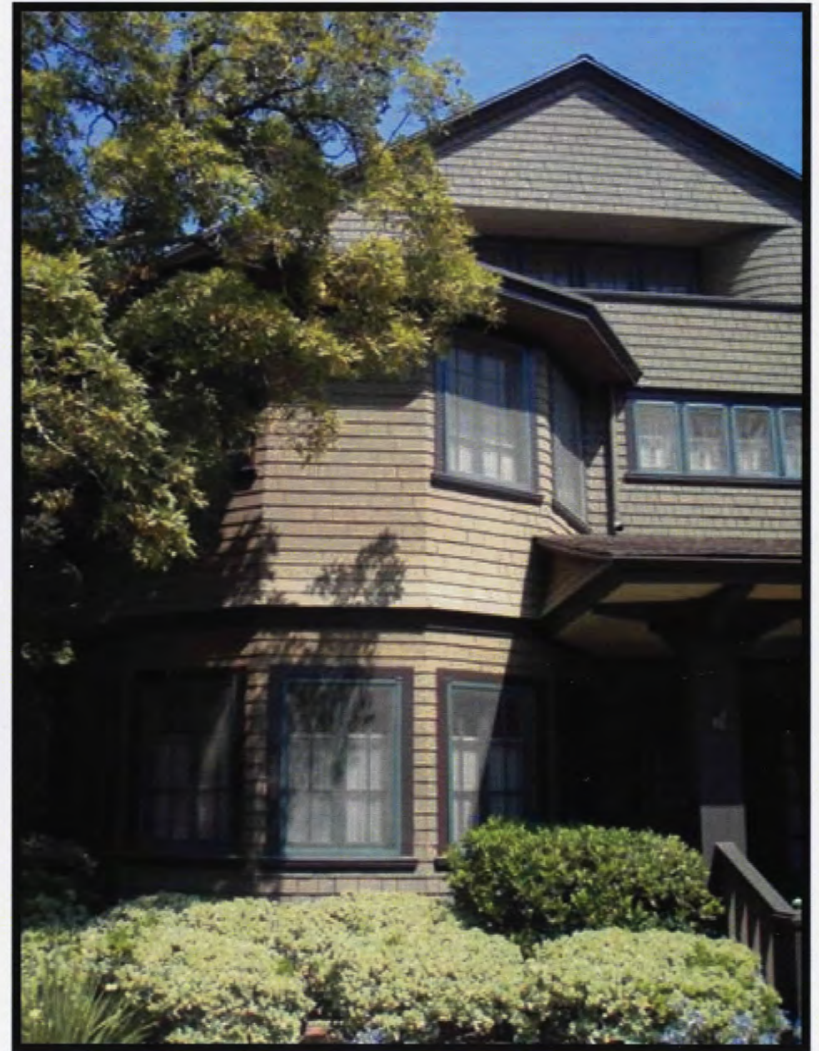
CA_Los Angeles County_George B Post House_0002