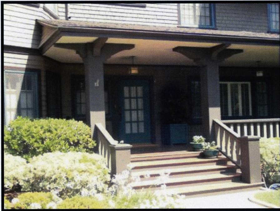
CA_Los Angeles County_George B Post House_0003