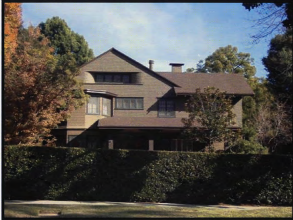
CA_Los Angeles County_George B Post House_0001