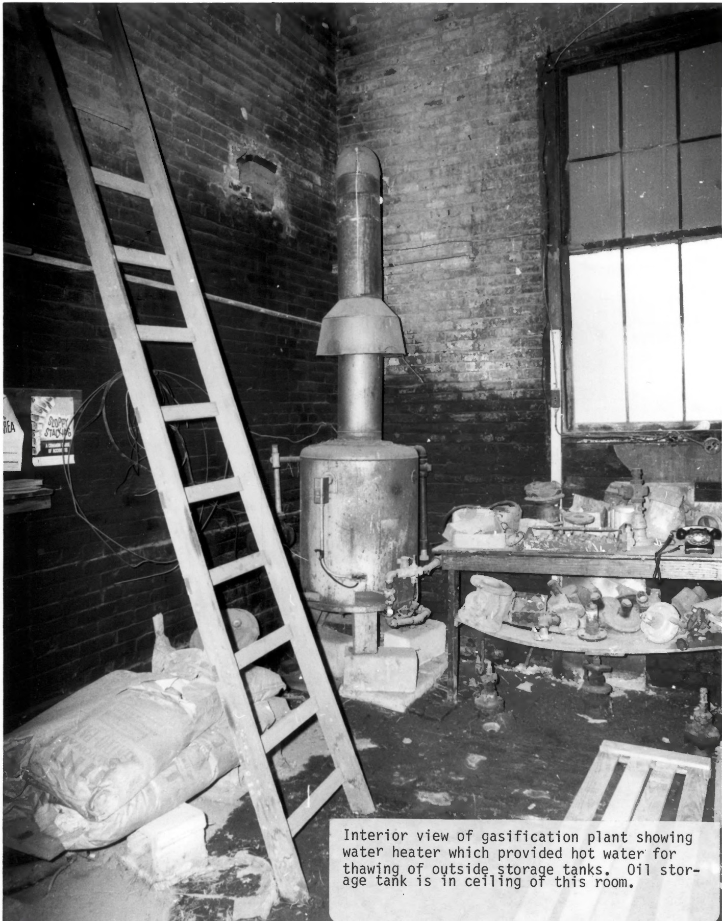
Interior view of gasification plant showing water heater which provided hot water for thawing of outside storage tanks. Oil storage tank is in ceiling of this room.