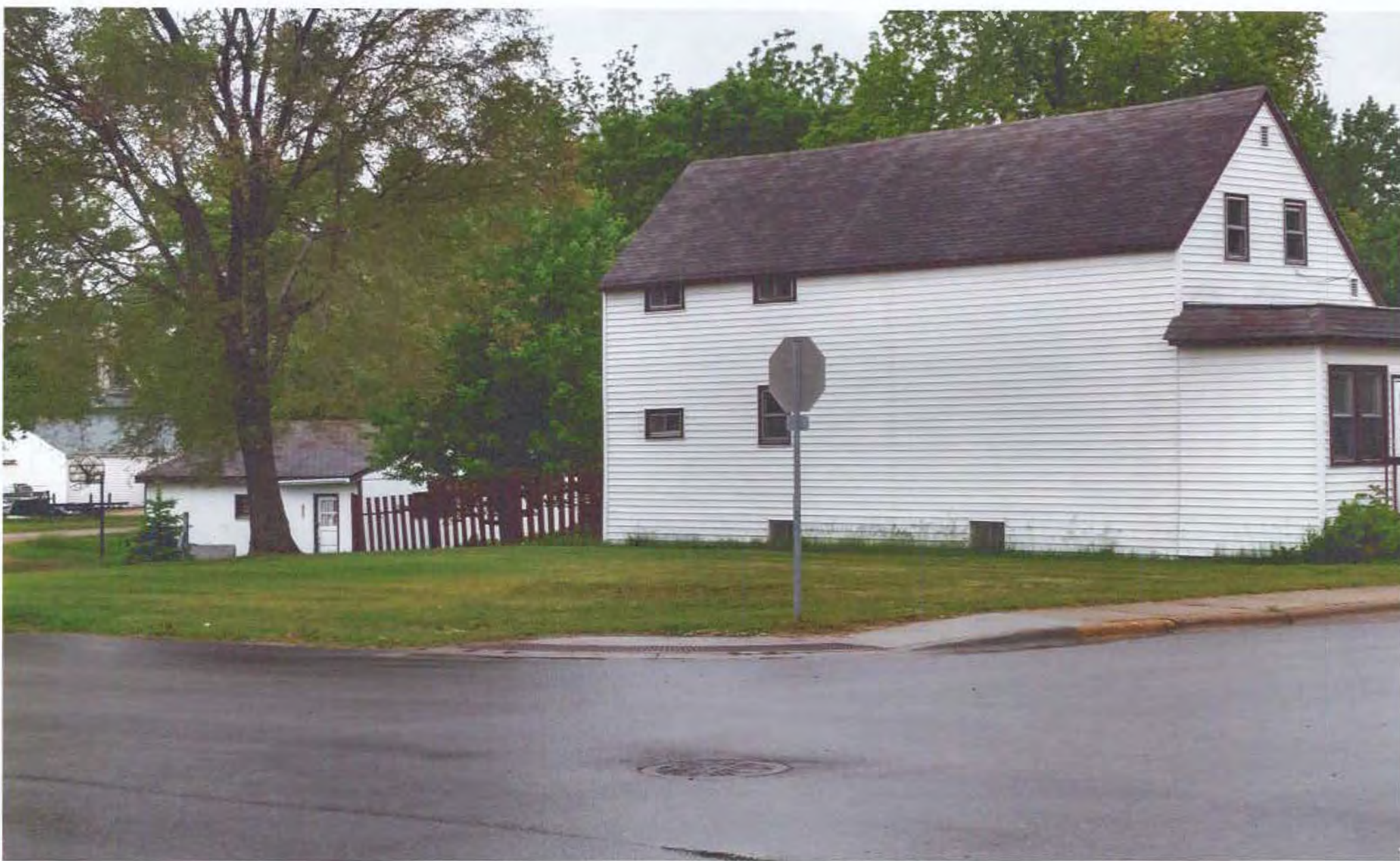
MINNEWASKA HOSPITAL - POPE COUNTY MN 24 MAY 2016 CAMERA FACING SW