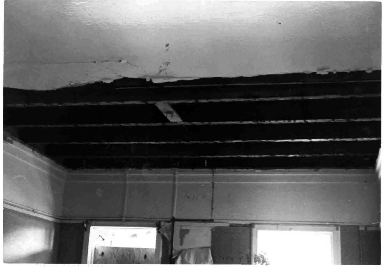
TAPE CRE INTE