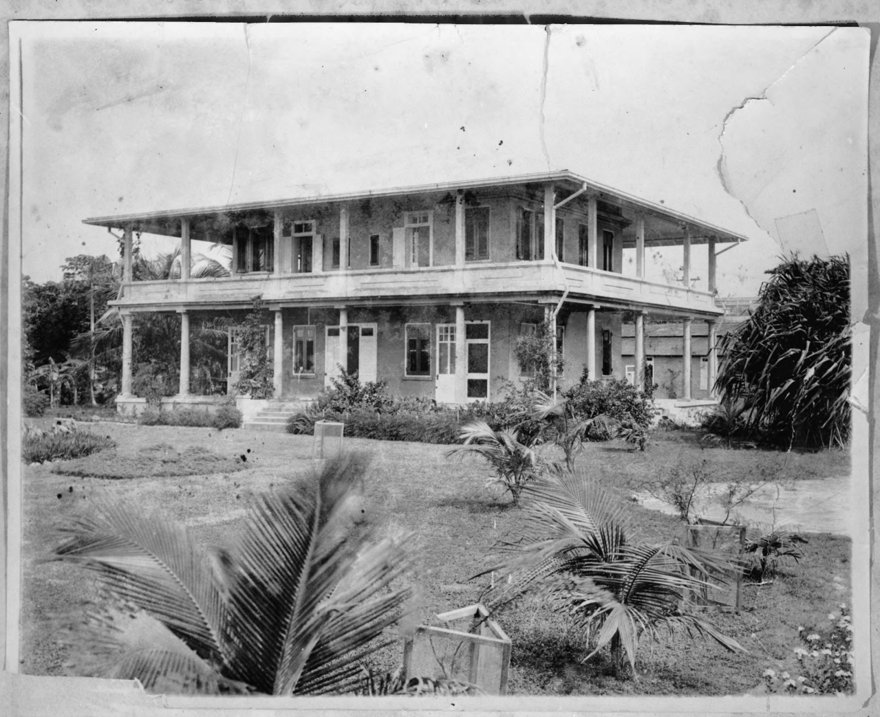
SUPTS. DWELLING AFTER ALTERATIONS