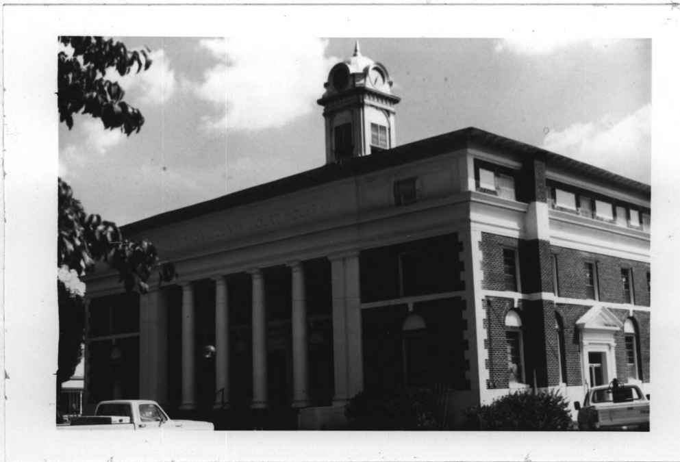
ATKINSON COUNTY COURTHOUSE