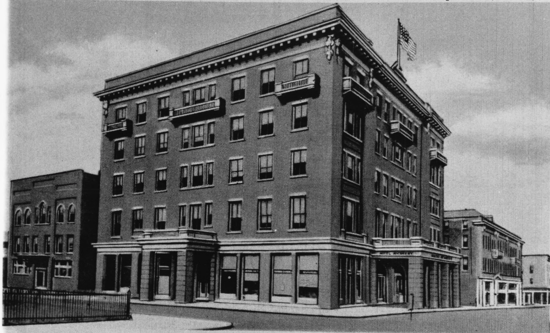
Hotel McCreery, Hinton, W. Va.