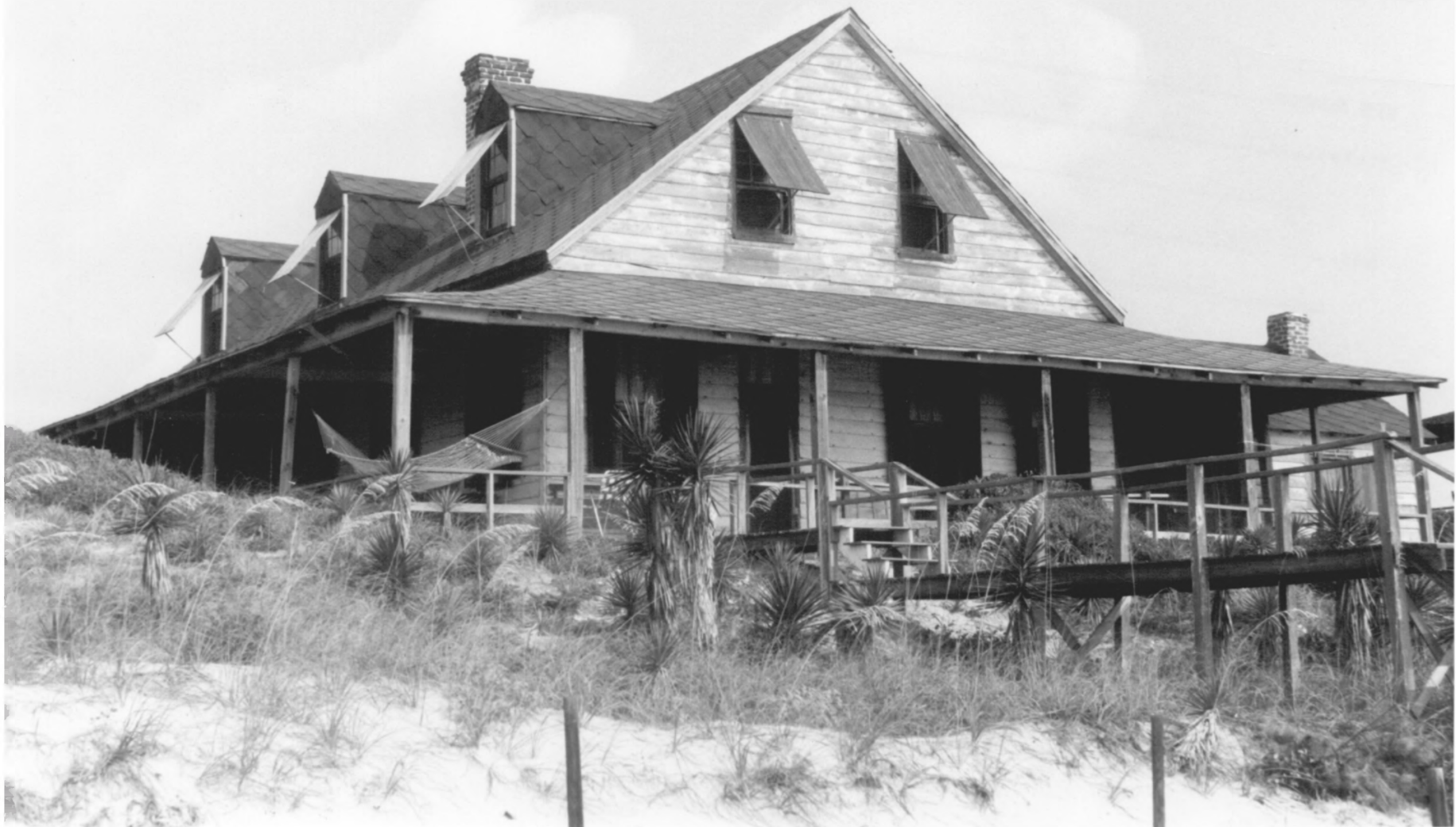
Butts No 12