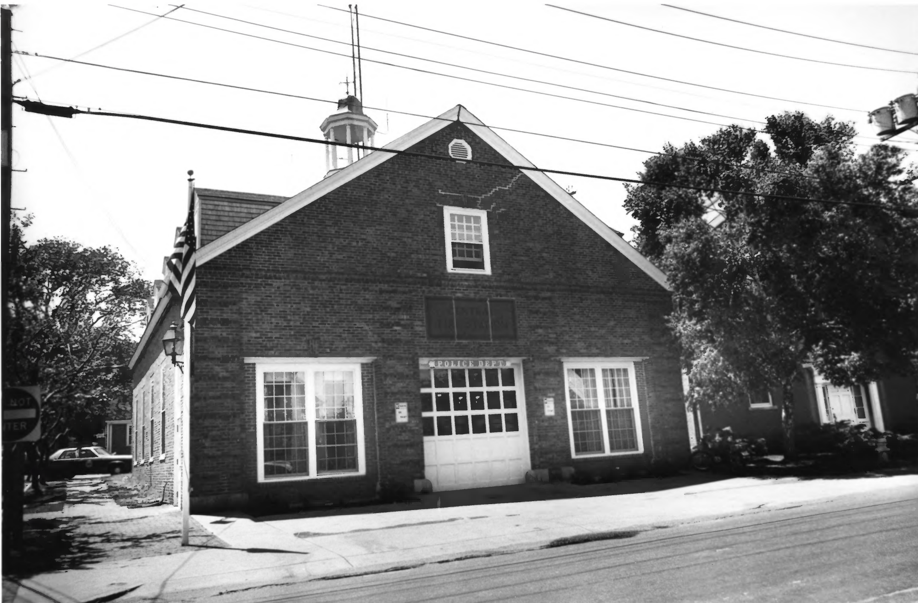
Photograph #2: Fire Station (1930)