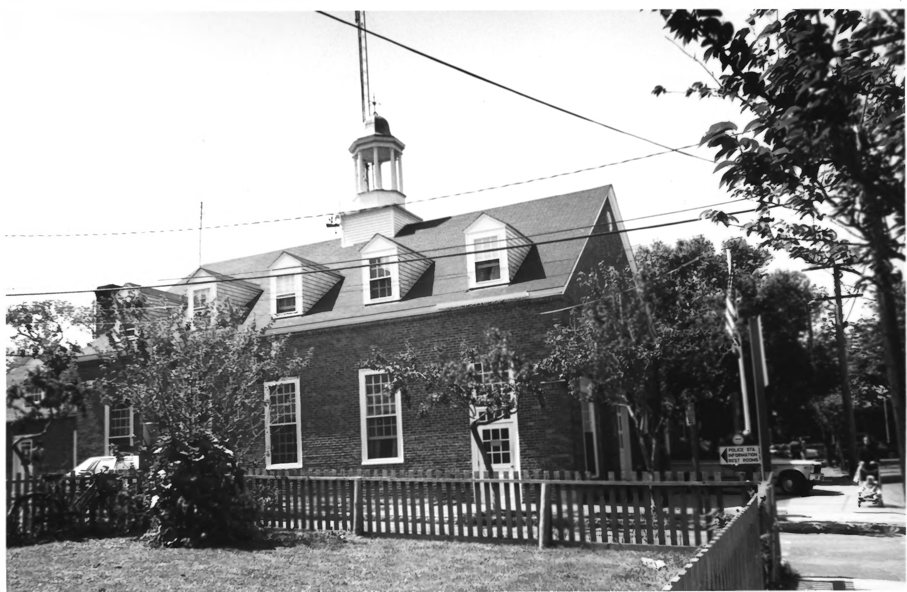
Photograph #3: Fire Station with distinctive Georgian Revival proportions and cupola.