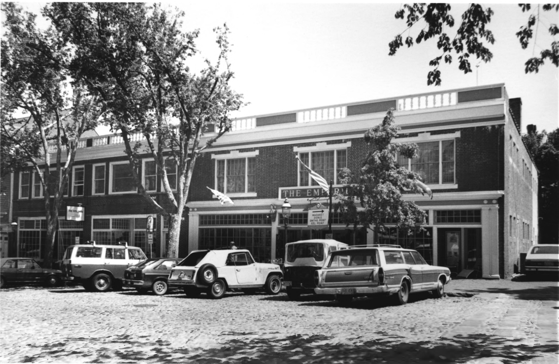
Photograph #6: Wing Block on Main Street