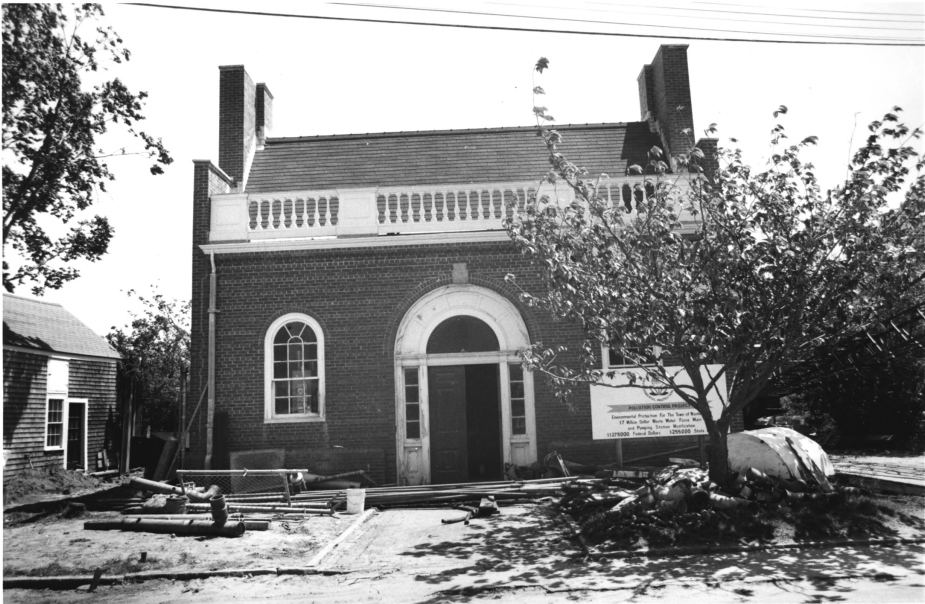
Photograph # 5: Sea Street Pumping Station (1927-28)