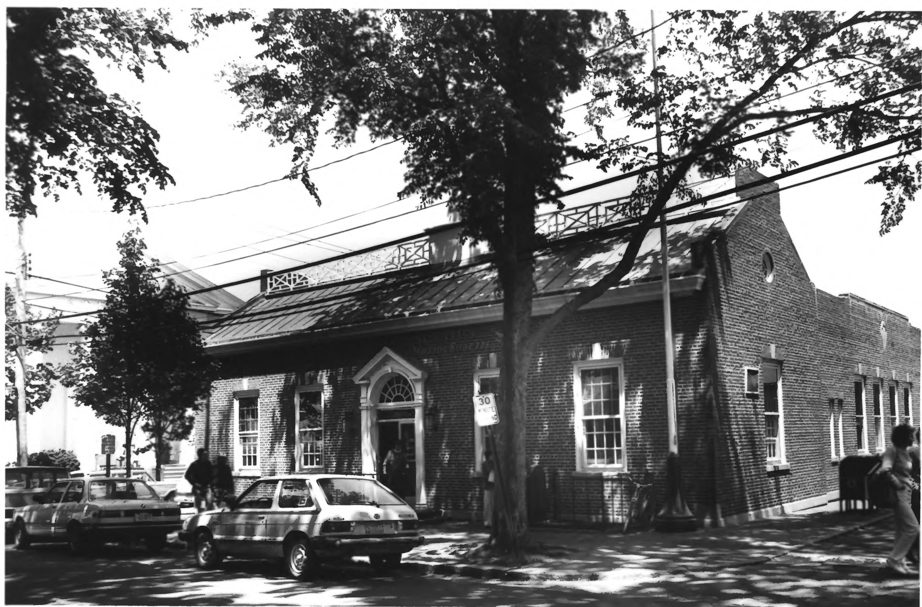
Photograph #4: U. S. Post Office (1932)