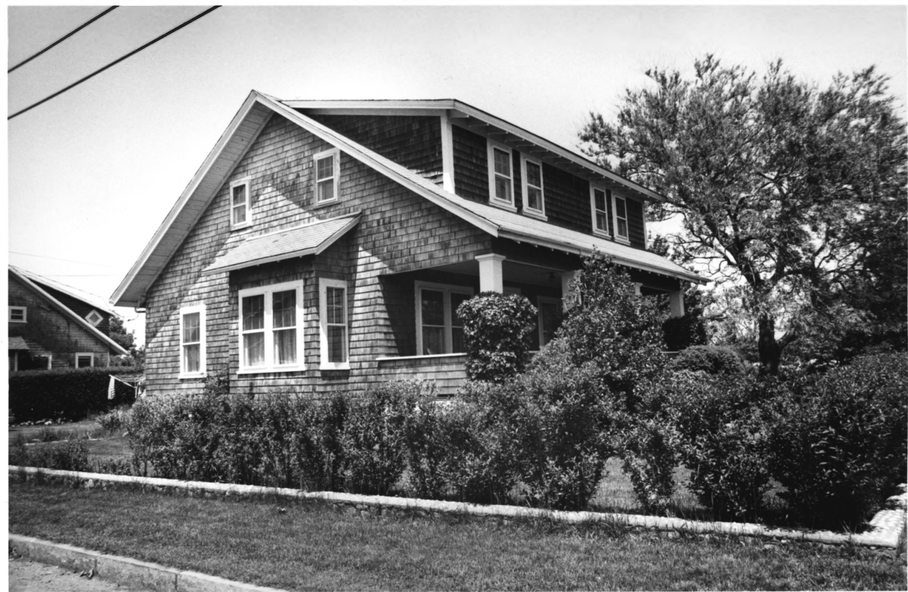
Photograph #1: Typical 1920's bungalow at Brandt Point