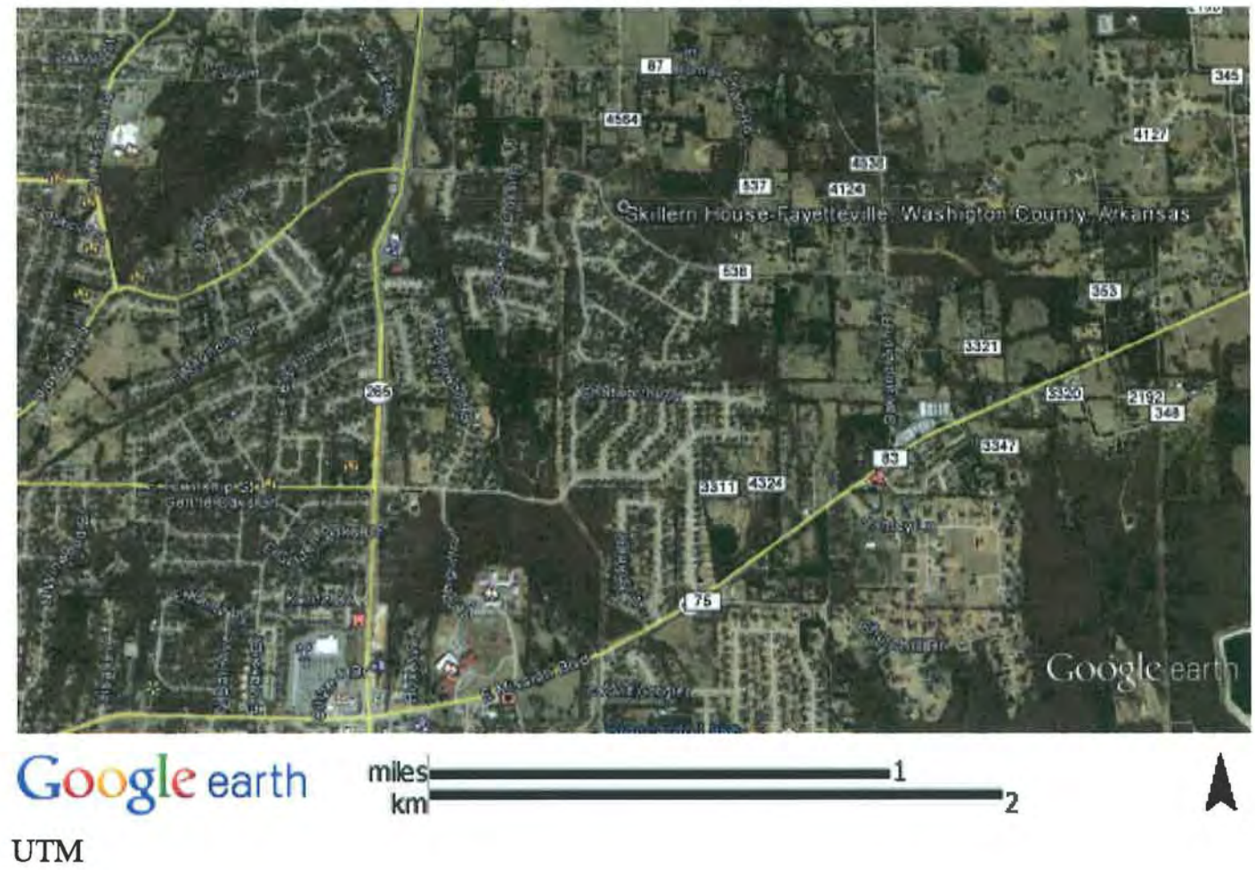
Skillern House- Fayetteville, Washington County, Arkansas