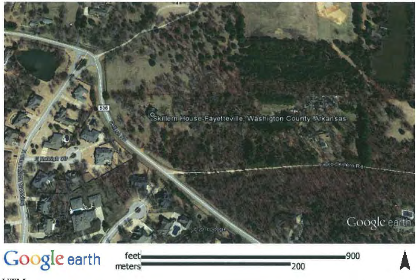
Skillern House- Fayetteville, Washington County, Arkansas