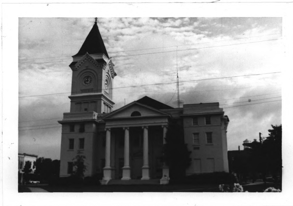
BULLOCH COUNTY COURTHOUSE