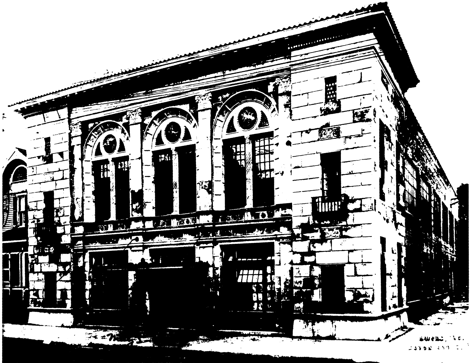
Capital City Press Bldg.