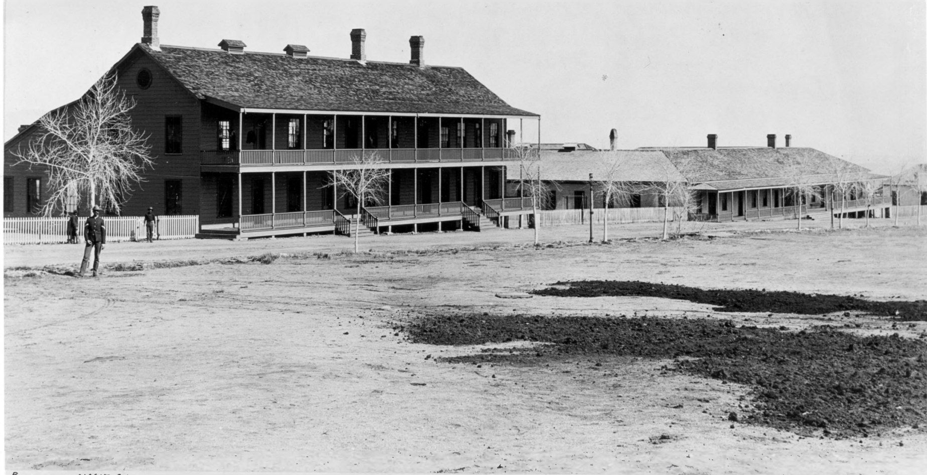
BUILDINGS Nos 17 & 18.