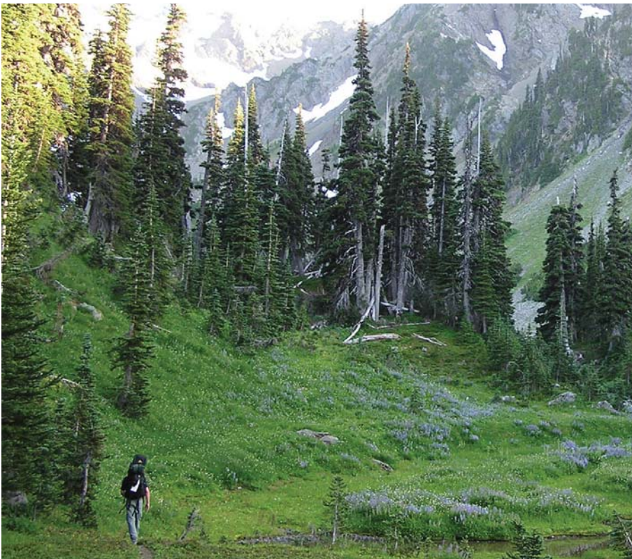
Backpackers can access the Olympic Wilderness on 600 miles of trails.

Olympic Discovery Trail may eventually connect Port Townsend and Forks. Currently sections are completed from Sequim Bay to Fairholme. In the park, the trail follows the Spruce Railroad trail through the Lake Crescent area of the park with a new section of trail continuing west towards Fairholme. Clallam County has the lead for sections in Clallam County and is working with the park for sections within park boundaries.