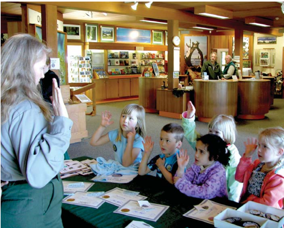
Expanding the National Junior Ranger Program will engage a future generation of park stewards.