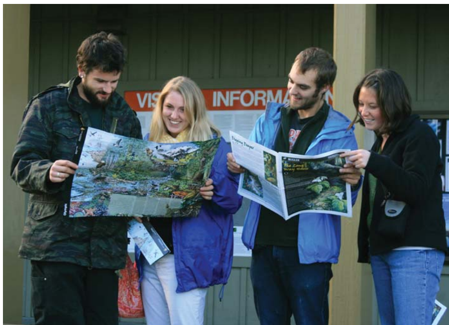
Park visitors receive wayfinding information from a variety of sources including the park brochure, park newspaper, and area exhibits.