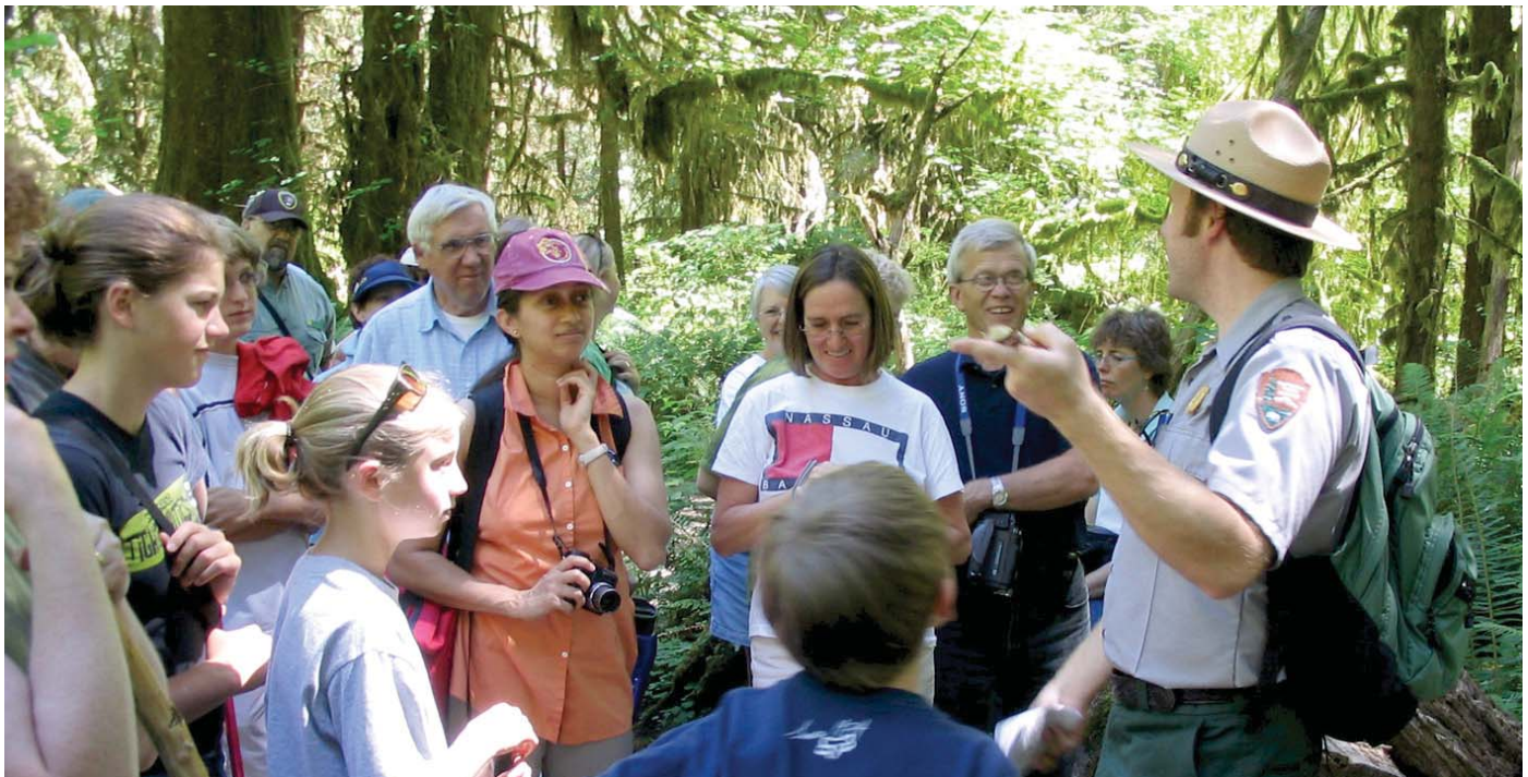
Visitors attend guided walks in the Hoh Rain Forest and many other park areas.

Forest Walk – 1.5-hour guided walk offered Friday through Sunday Family Forest Activities – 1.5-hour program offered on Sunday Campfire Program – Friday Evening Program – Saturday