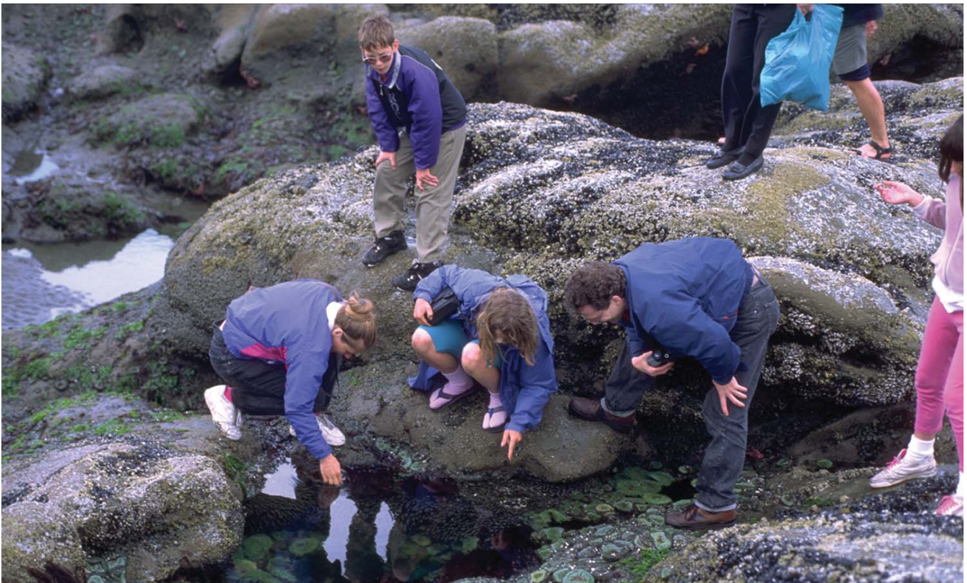
Visitors discover aquatic life in tide pools along the Olympic coast.

The Olympic Peninsula's rich cultural history reveals a dynamic interaction between people, place, and values, illustrating the ongoing challenge to balance the use and preservation of resources.