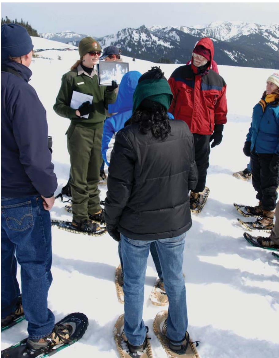
Guided snowshoe walks at Hurricane Ridge offer winter visitors a glimpse of the Olympics.