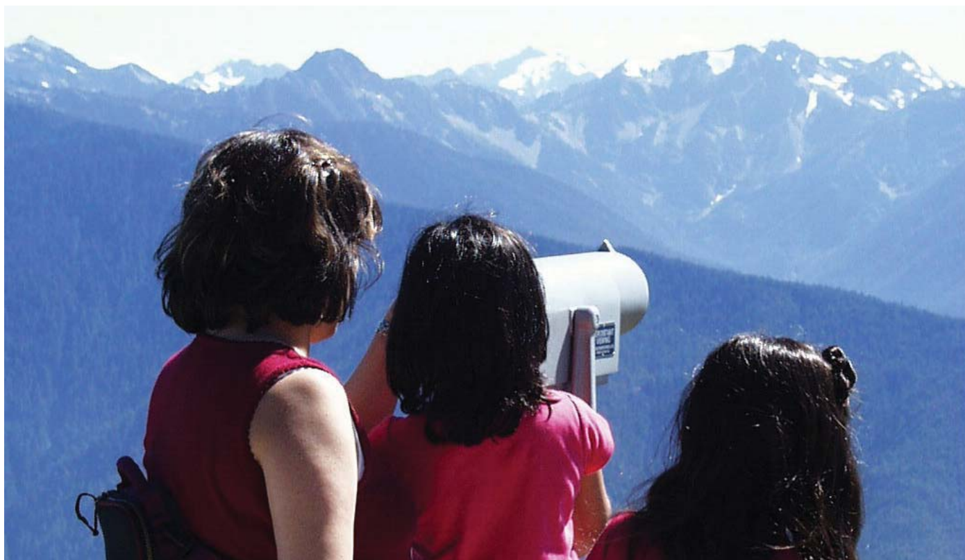
At Hurricane Ridge, visitors share views of the Olympic Wilderness.

Actuals: 2007 – 391,900, 2008 – 532,000, 2009 – 587,600