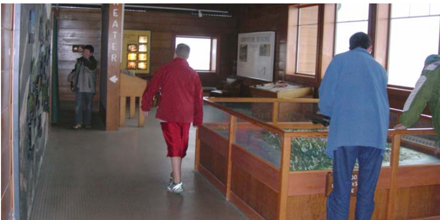
New exhibits at the Hoh and Hurricane Ridge visitor centers will enhance the visitor experience.