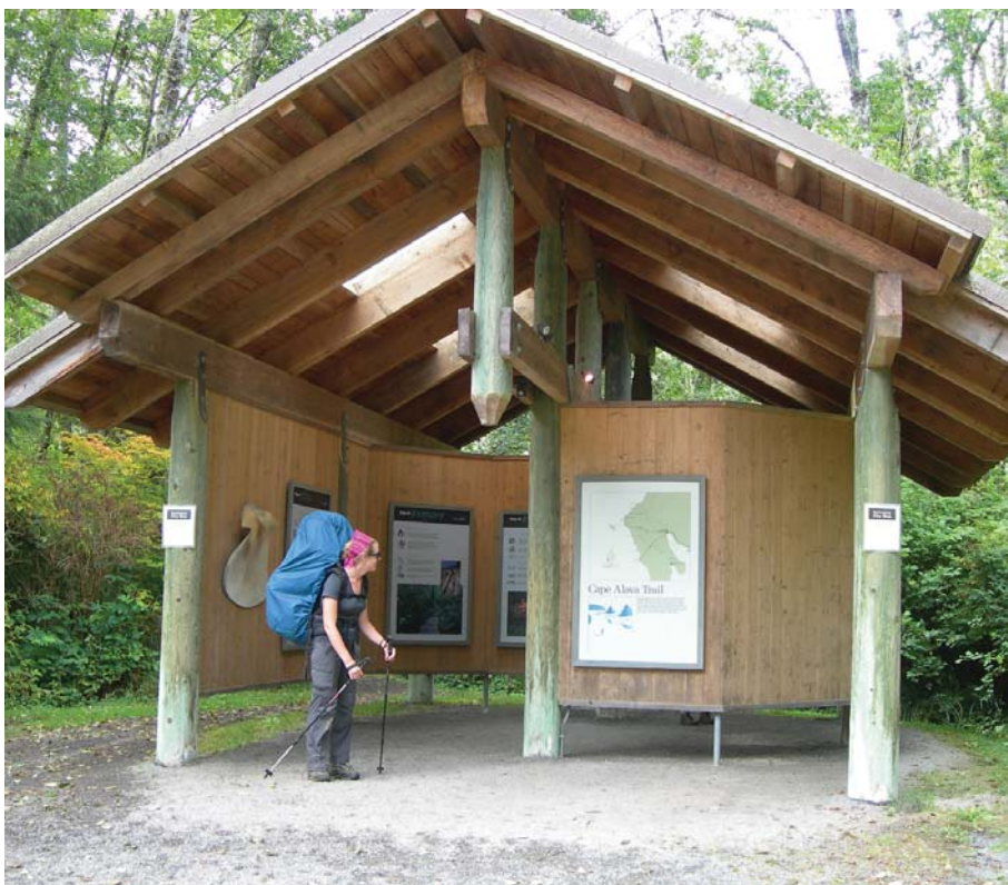
The outdoor kiosk at Ozette displays wilderness safety and interpretive exhibits.

The RIC shares occupancy with the Forks Transit Center which acts as a hub for buses along the north and west side of the peninsula. The location provides a rest stop for through-travelers and is a “park and ride” location for commuters. The various uses of this facility have resulted in confusion and conflicts between transit station and park users and uses.