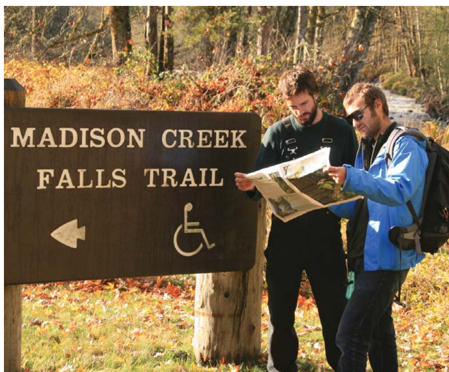
A wide variety of wayfinding signs directs visitors to key park features.

ONPVC exhibits introduce the park's three ecosystems, highlight many of the park's significant resources, and provide orientation services and maps. The children's Discovery Room contains numerous activities including activity drawers, various puzzles, discovery boxes, large-scale murals of each ecosystem, a diminutive ranger station, a totem pole that can be redesigned using felt shapes, a salmon spawning activity, a poem writing activity, and a computer for both the Olympic Odyssey program and the microscope.