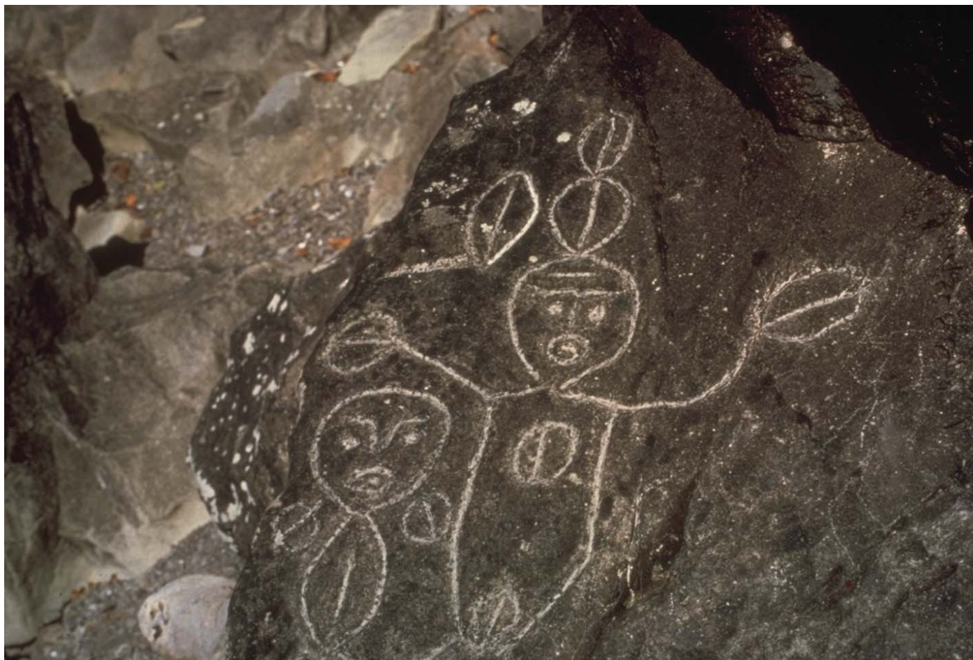
Ocean stewardship encourages visitors to protect exposed coastal archaeological sites.

series of strategies and strategic objectives to engage visitors in ocean stewardship activities. Strategy #3 is to “Engage visitors, partners, and communities to become active ocean stewards.” Associated Strategic Objective #3 is to “Explore approaches to engage visitors, teachers, and students in the practice of ocean stewardship through interpretive/ education programs, experiential learning, and recreational opportunities,” and “Expand interpretive programs – Broaden the reach and increase capacity by increasing park interpretive staff focused on ocean stewardship and related climate change. Seek new program funds, positions, and partnerships to focus ocean stewardship efforts at the national, regional, and park level.”