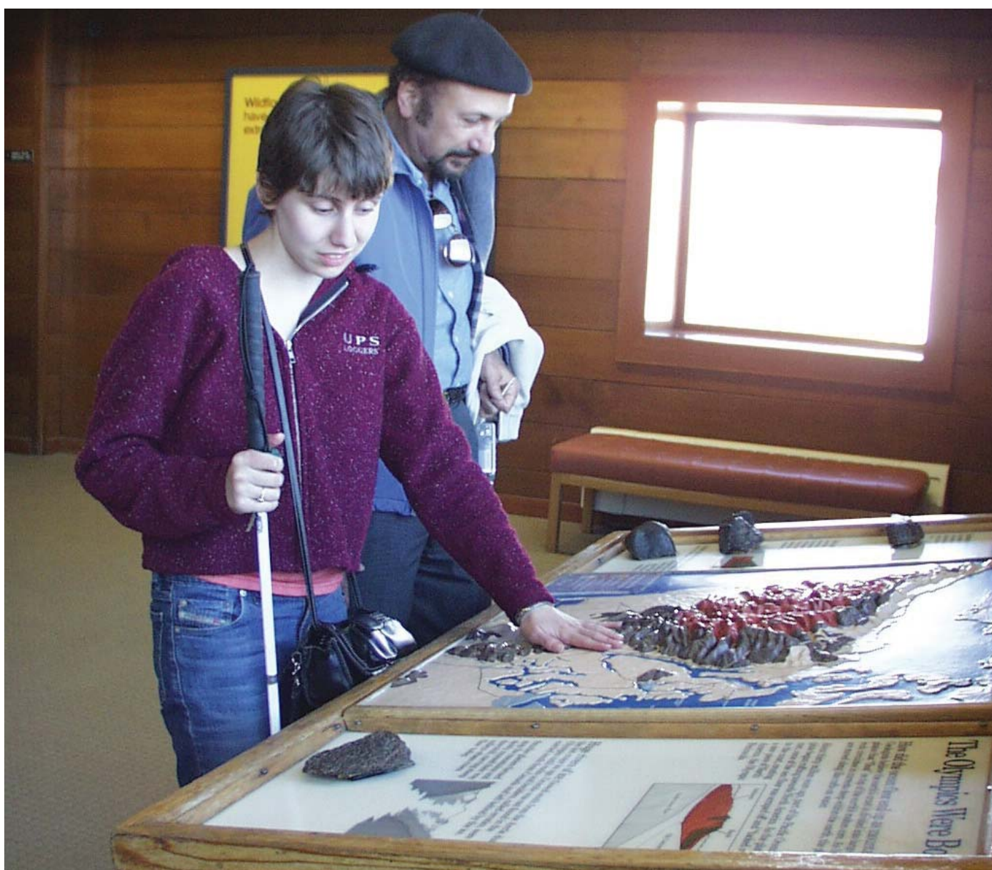
A geological relief map at Hurricane Ridge Visitor Center orients visitors to the park's physical features.

All interpretation will follow general standards for accessibility as described in the Harpers Ferry Center Programmatic Accessibility Guidelines for Interpretive Media http://www.nps.gov/hfc/pdf/accessibility/access-guide-aug2009.pdf .