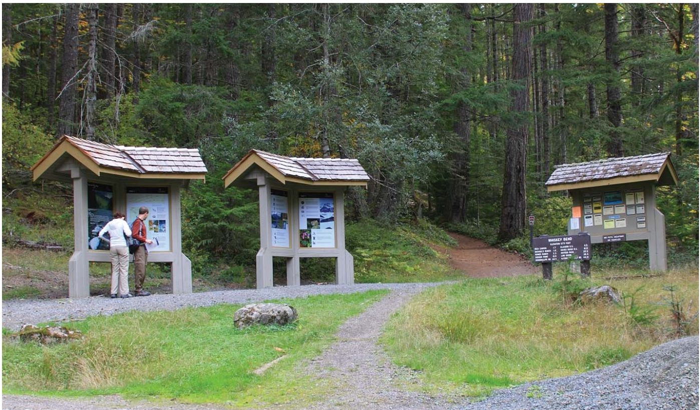
Wilderness trailhead exhibits, located at several park areas, offer hikers backcountry maps and safety information.

Wayside exhibit text, photos, and asset details are input into the NPS Media Inventory Database System (MIDS) and the NPS Facility Management Software System (FMSS). An in-park database for tracking repairs, replacements, and future corrections was recently expanded and updated. The database identifies exhibits with inaccurate or out of date text and notes ideas for subjects that are not interpreted including climate change, glacial retreat, sea-level, spills, ocean acidification, debris, new fossil sea star find at Beach 4, and endemic marmots and their decline. Interpretive staff needs to prioritize the inventory and seek funding for improving wayside exhibits, while being mindful that the park is already maintaining a very large number of wayside exhibits.