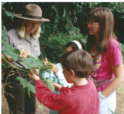
Interpretive programs provide memorable moments for visitors of all ages.

There is great potential to experiment with the development of programs linking the spectrum of park resources. Visitors are then provided with many opportunities to travel around the park and discover the unique features and stories at each location including tidepool walks, sunset tours, and post dam removal walks. Increasing the number of interpreters who are roving out in the field and at the lodges will provide more opportunities to actively engage visitors in the resource. Since personal services and interpretive programs are relatively easy to change, activities should be evaluated on a regular basis to discontinue those that are not effective, modify or improve those that require it, and validate those that are successful.