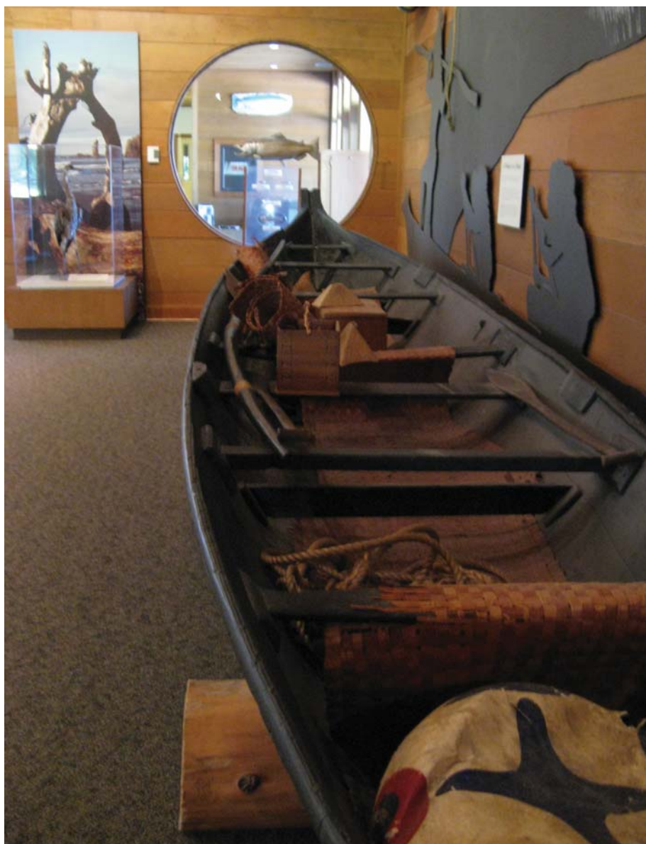
ONPVC exhibits introduce visitors to a variety of park resources.

All visitor center and ranger station exhibit assets are described in a very detailed manner in the NPS Facility Management Software System (FMSS).