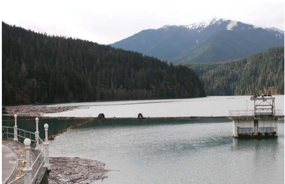
The Elwha River Restoration project is interpreted with a variety of exhibits, publications, and interpretive programs.

Although the park has not had a significant interpretive presence in the Elwha valley in decades, the river restoration project has drawn a great deal of attention to this area. Once a prime habitat for all five salmon species found in the park, as well as ancestral American Indian lands, the