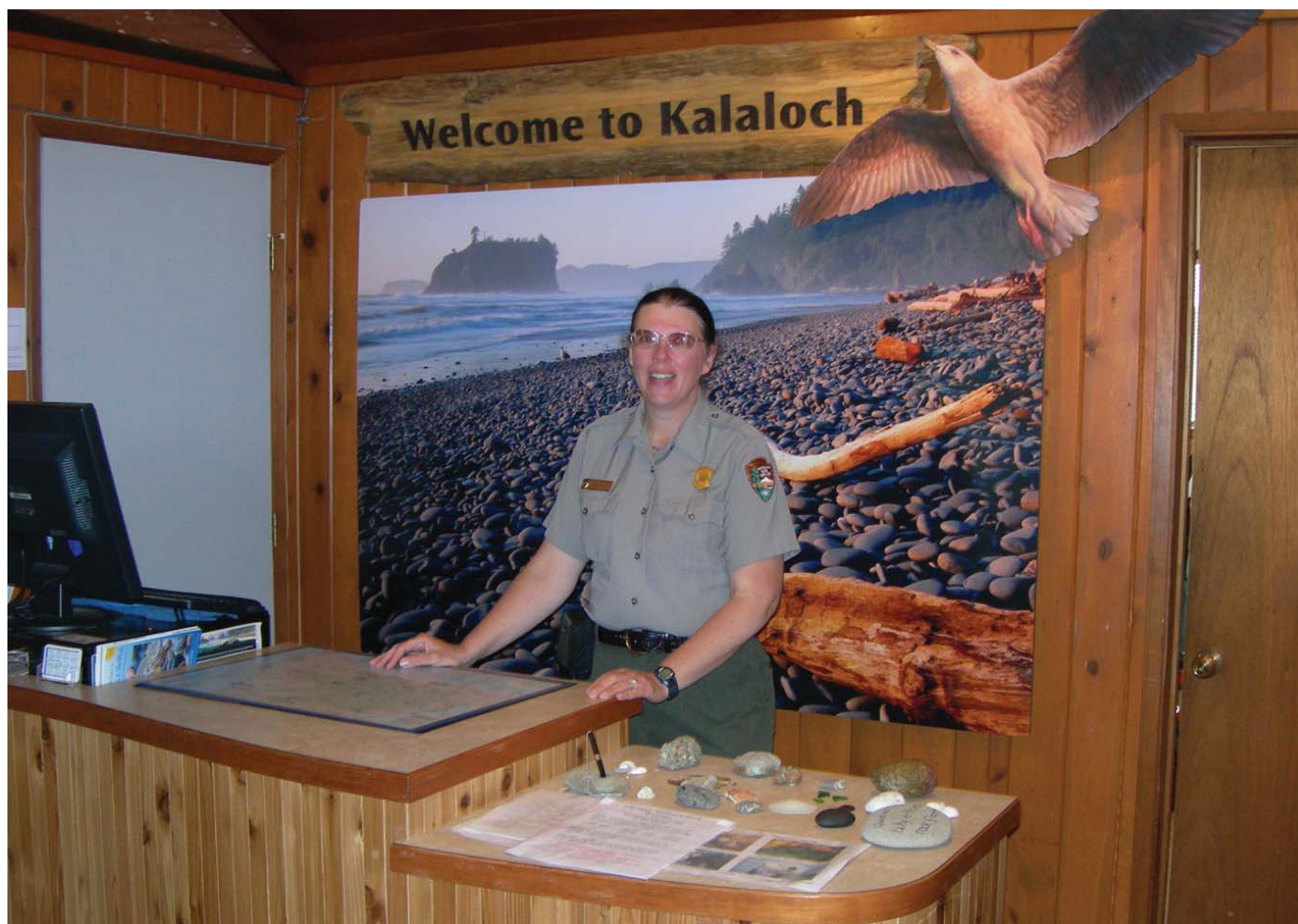
Kalaloch Ranger Station, a small facility, has engaging exhibits produced in-house.

During the lifetime of this Long-Range Interpretive Plan, park staff will provide increased interpretive opportunities for youth, education groups, and diverse and underserved communities.