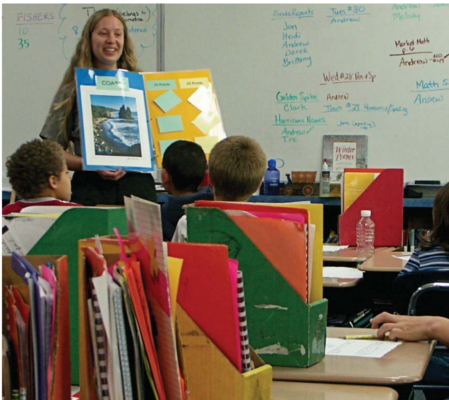
Ecosystem Olympic is a 4th grade curriculum-based program presented in Olympic Peninsula classrooms.

Olympic Park Institute (OPI) provides three- to five-day residential field science education annually for about 4,000-6,000 students in grades 4-12. Teacher workshops are offered that demonstrate inquiry-based teaching methods. In addition, OPI works with Lower Elwha Klallam Tribe and Western Carolina University to deliver weeklong summer programs for middle and high school students. These programs are supported through the Diversity in the Geosciences grant from the National Science Foundation.