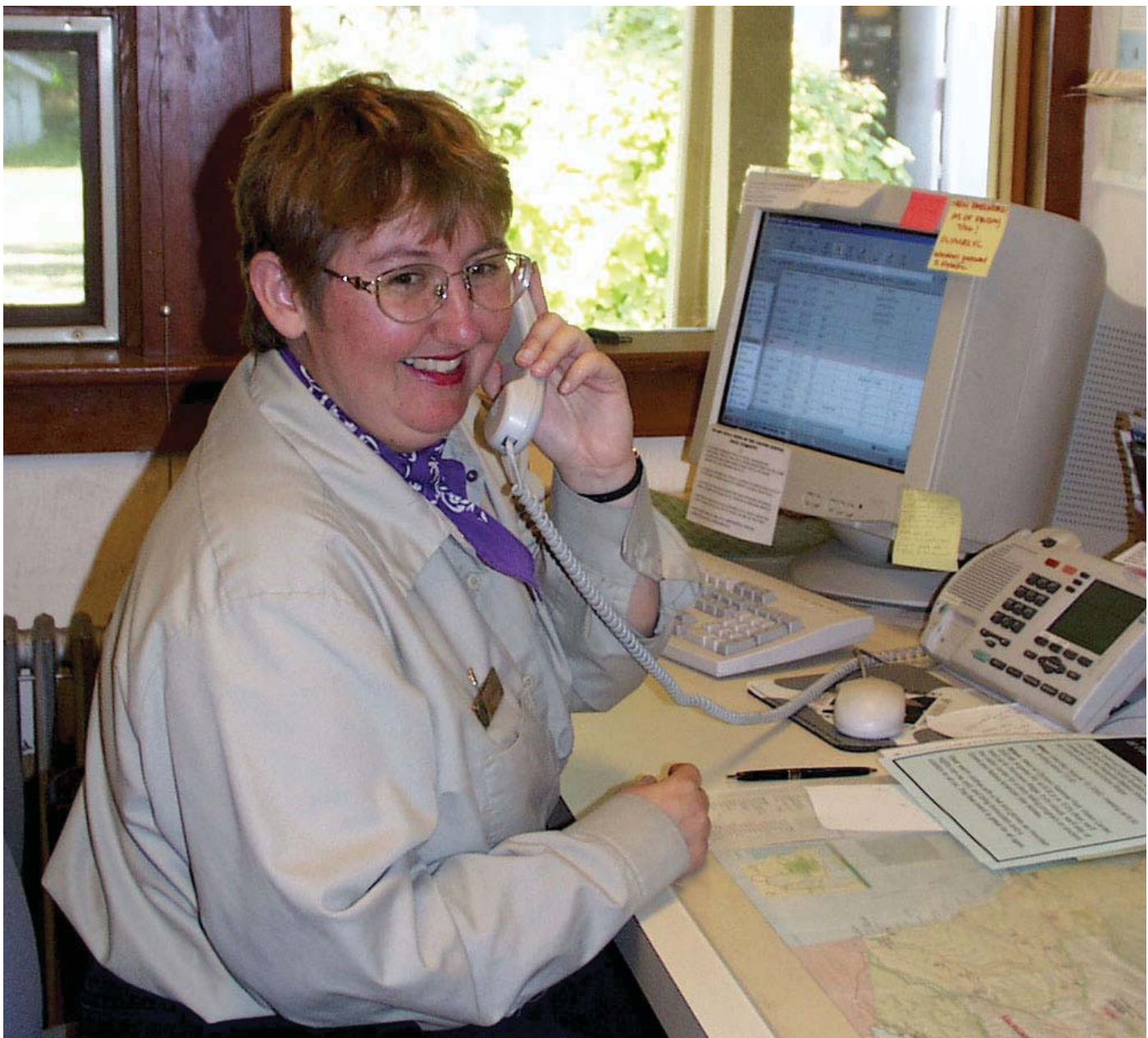
At ONPVC, volunteers provide valuable year-round visitor information and orientation services.

meeting park visitors' needs for information and interpretation. Interns work full-time and do interpretive programs, staff desks, and rove. Community volunteers help about three- to five-days a week at Hurricane Ridge in the summer and one- to two-days a week in winter. They staff the information desk, rove trails, and assist visitor management and resource protection.