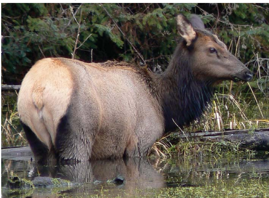
The park protects nearly 5,000 native Roosevelt elk.