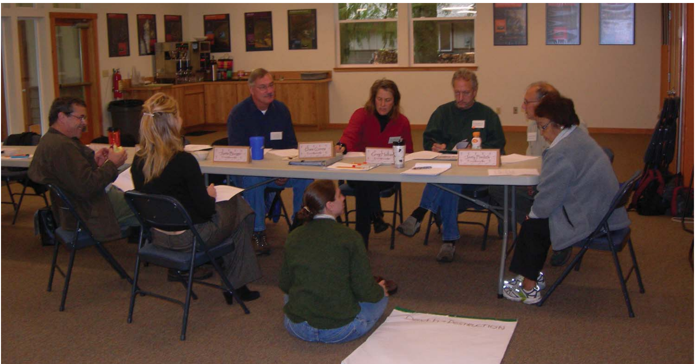
Participants engage in a Foundation Workshop small group exercise.

Barring legislative changes or major new revelations, the foundational elements expressed in this LRIP – purpose, significance, themes, and visitor experience goals – will remain constant over the life of the plan. Specific recommendations about media and programs may need to be updated as staffing, funding, technology, or resource conditions change. Additional planning and design documents must be produced to implement some of the goals and recommendations in this plan.