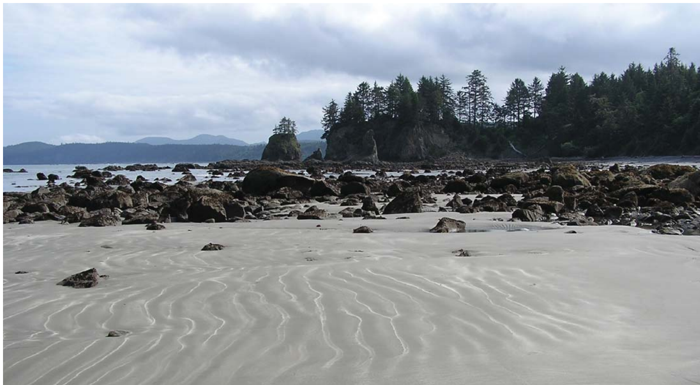
In the future, a multi-agency coastal visitor center would further the protection of ocean resources.

March 2010 Recommendations Workshop participants suggested that possible future interpretive exhibits and audiovisual components emphasize Washington's wilderness coast and tell stories of biodiversity, cultural and natural resources, history, human interconnectivity, the Olympic Peninsula tribes, Olympic Coast National Marine Sanctuary; the coast is special because it is protected and relatively undeveloped; and shared agency messages.