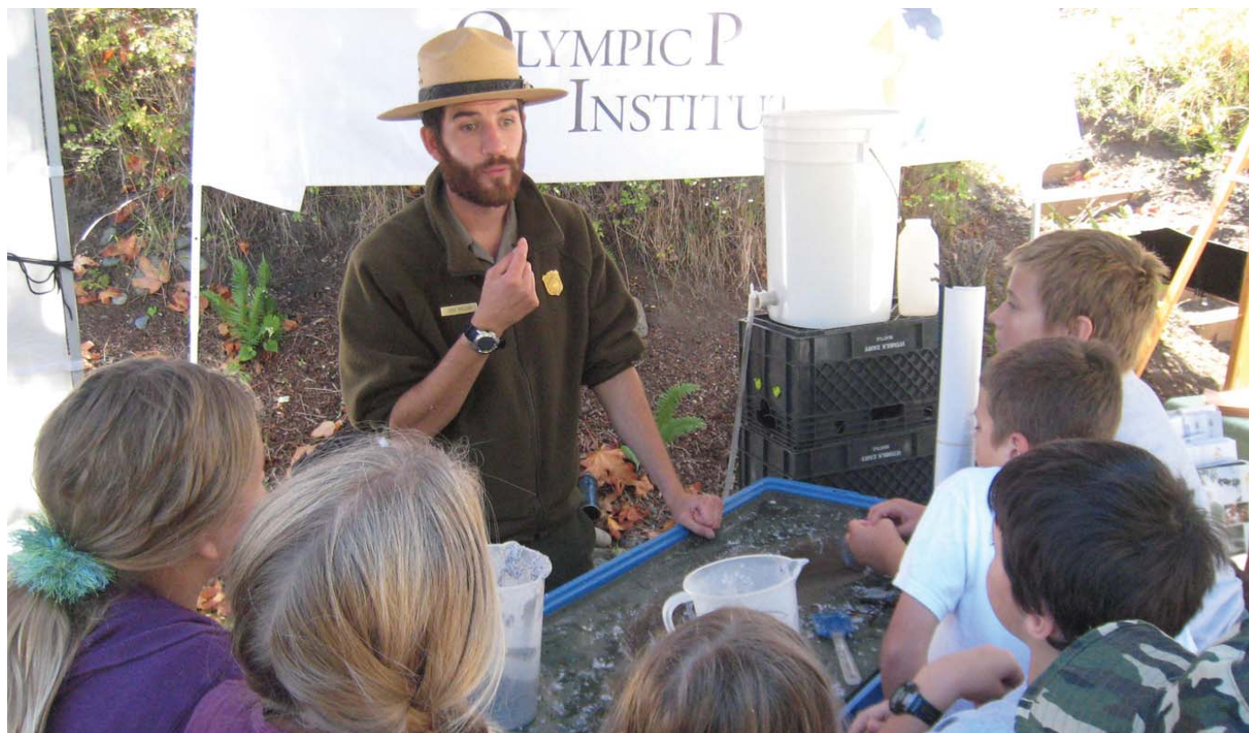
Park rangers engage youth in interpretive experiences in the park and in many neighboring communities.

Park staff participates in two-to three-hour community events such as literary events at the library, transition fair, the Kiwanis Kidsfest, and YMCA Healthy Kids program.