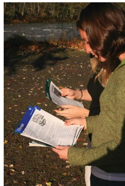
Site bulletins provide trip planning and park resource information.

Two Discover Your Northwest sales items featuring Hurricane Ridge and the Hoh Rain Forest are out of print.