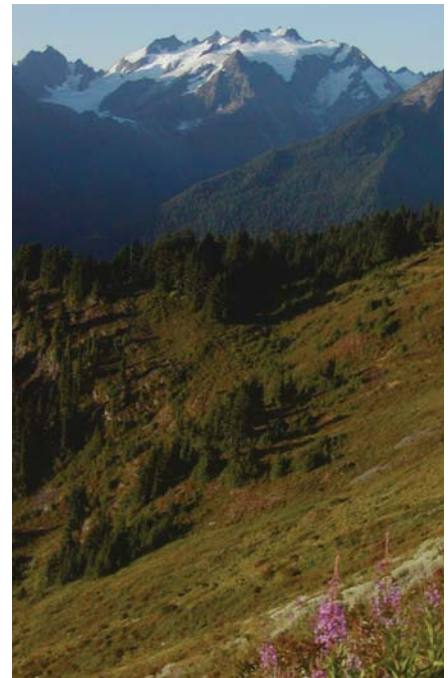
Mount Olympus is the park’s highest peak at 7,980 feet.

The enabling legislation text above is repeated in the 2008 General Management Plan as the Park Purpose statement describing why the area was set aside and what specific purposes exist for the park.