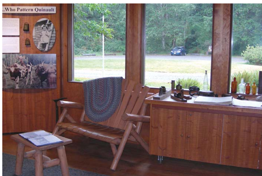
Quinault Rain Forest Ranger Station features high quality, informative park-produced exhibits.

In Olympic National Forest, the Lake Quinault Lodge, an ARAMARK concession, provides