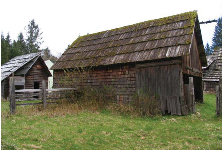
The Kestner Homestead Historic District is located in the Quinault Rain Forest.