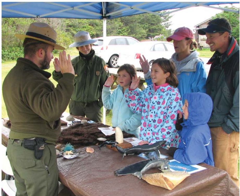
In FY2009, over 9,000 family members participated in the Junior Ranger program.

Park visitors can borrow a backpack filled with binoculars, guidebooks, and more for a $5.00 donation. The backpacks are available year-round at ONPVC and at staffed facilities during the summer (Hoh, Quinalt, Kalaloch, Storm King, and Hurricane Ridge). The backpacks are intended to provide a structured way to explore and experience the park.