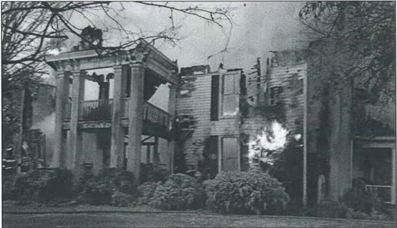
Figure 10: Stokely Davis House in 2014 at the time of the fire.

Stokely Davis House Williamson County, Tennessee