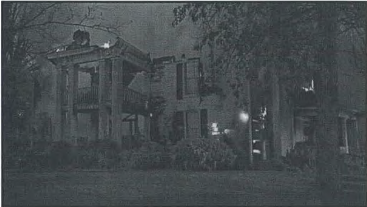
Figure 8: Stokely Davis House in 2014 at the time of the fire.

Stokely Davis House Williamson County, Tennessee