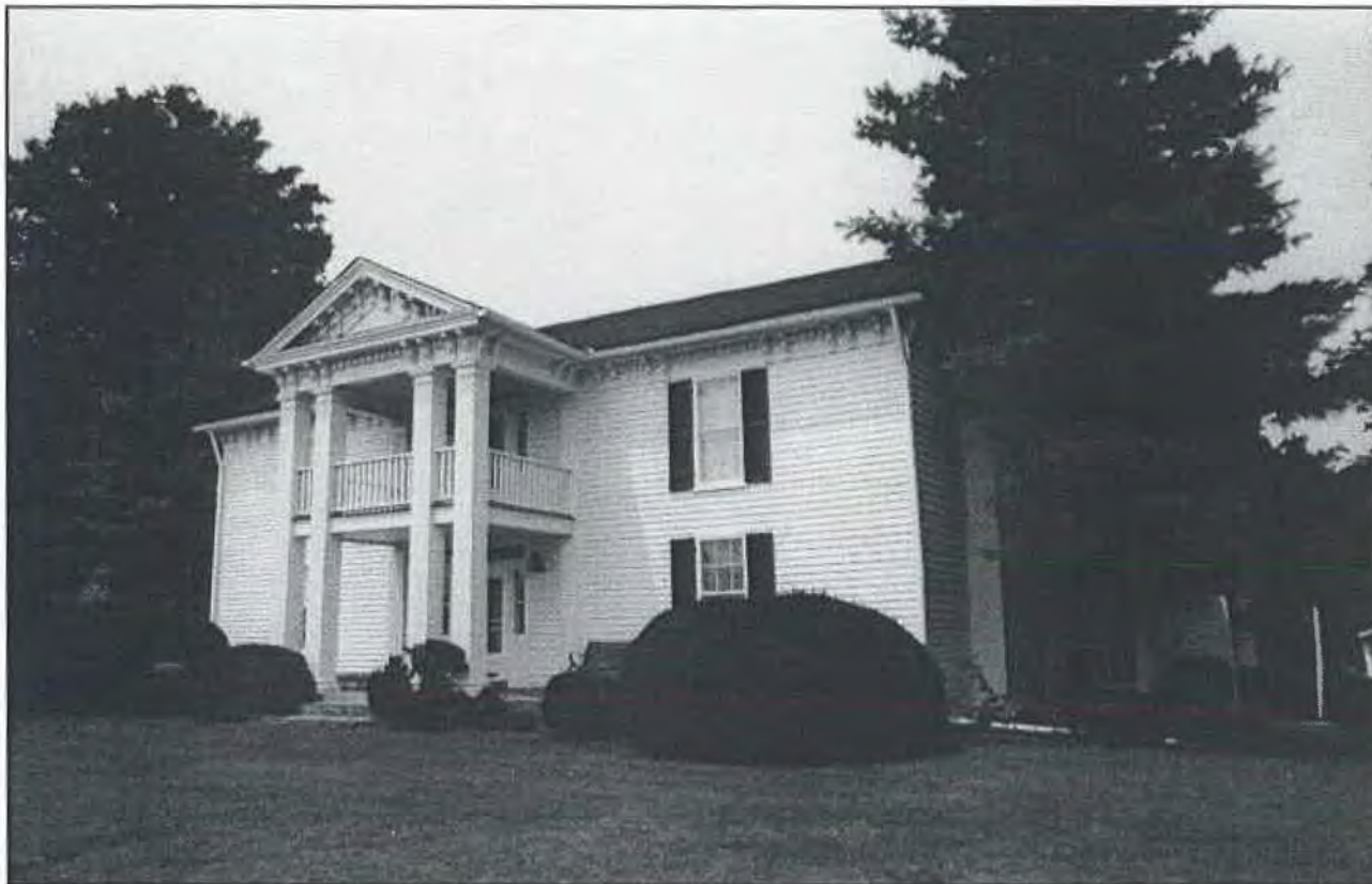
Figure 3: Stokely Davis House – Main (east) facade.

Section number N/A Page 4 Stokely Davis House Williamson County, Tennessee