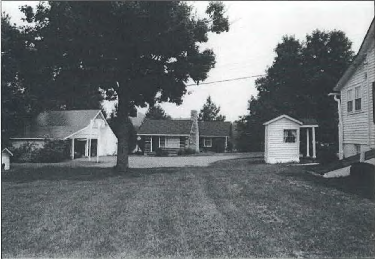
Figure 6: Stokely Davis House – Outbuildings

Section number N/A Page 7 Stokely Davis House Williamson County, Tennessee