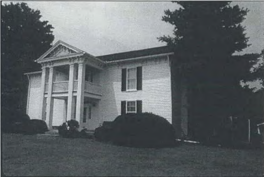
Figure 1: Stokely Davis House in 1988.

Stokely Davis House Williamson County, Tennessee