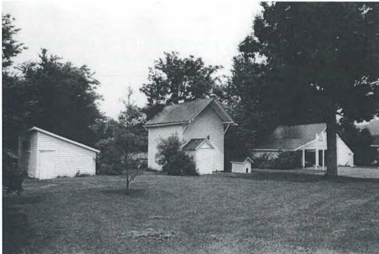
Figure 7: Stokely Davis House – Outbuildings.

Stokely Davis House Williamson County, Tennessee