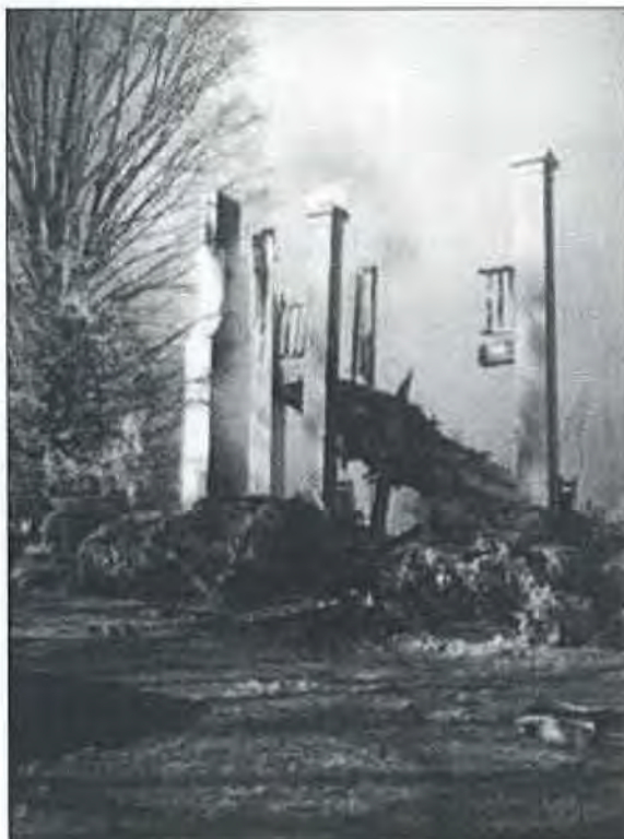
Figure 13: Stokely-Davis House in 2014 the morning of the fire.

Stokely Davis House Williamson County, Tennessee