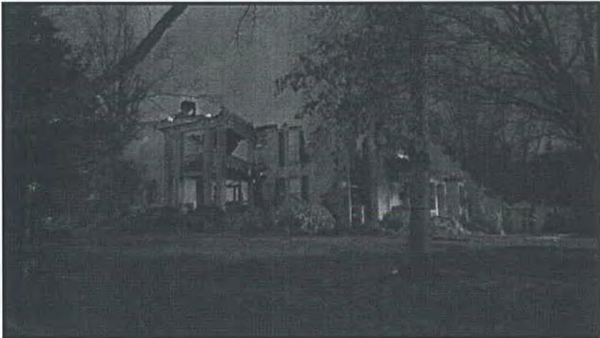
Figure 11: Stokely Davis House in 2014 at the time of the fire.

Stokely Davis House Williamson County, Tennessee