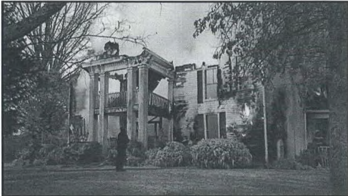
Figure 9: Stokely Davis House in 2014 at the time of the fire.

Stokely Davis House Williamson County, Tennessee