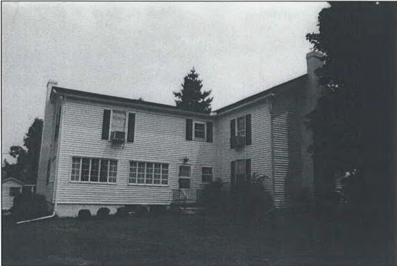
Figure 5: Stokely Davis House – south elevation.

Section number N/A Page 6 Stokely Davis House Williamson County, Tennessee