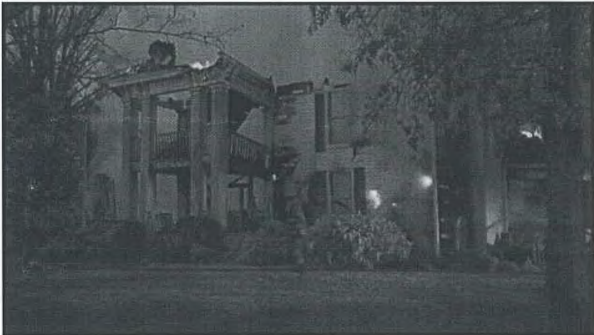
Figure 12: Stokely Davis House in 2014 at the time of the fire.

Stokely Davis House Williamson County, Tennessee