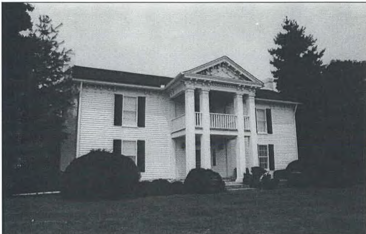
Figure 2: Stokely Davis House – Main (east) facade.

Stokely Davis House Williamson County, Tennessee