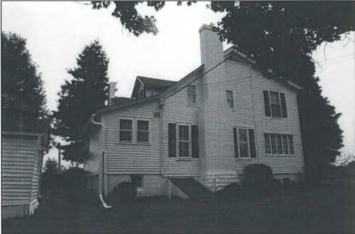
Figure 4: Stokely Davis House – Rear (west) elevation.

Stokely Davis House Williamson County, Tennessee