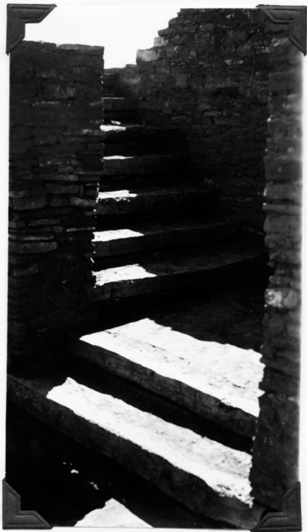
16. Restored stairway to missing choir-loft. May 1939.