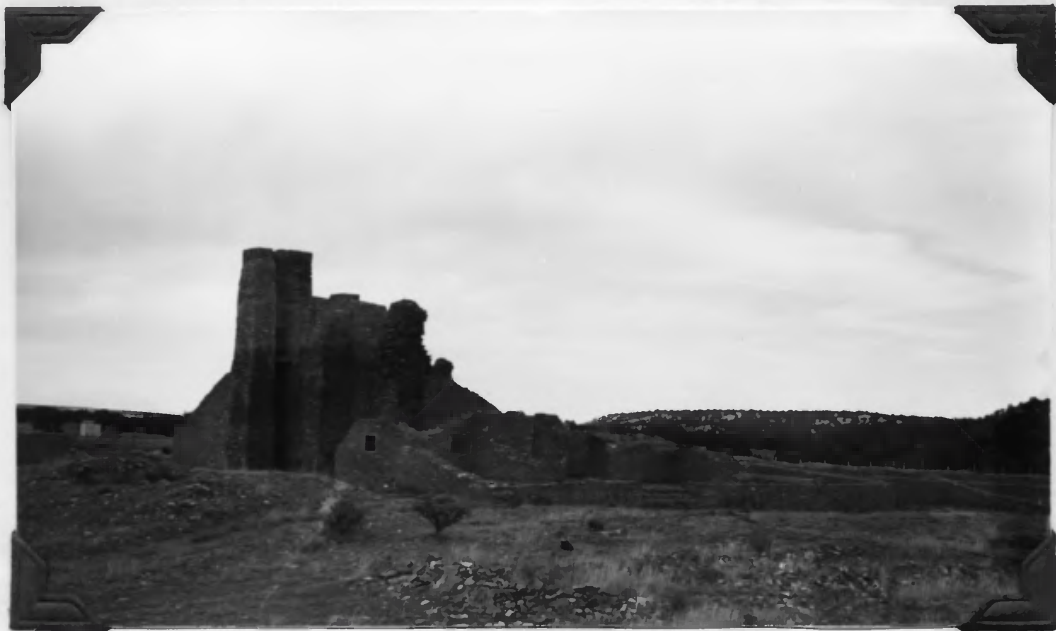
9. Church from the southwest after stabilization. October 29, 1940.