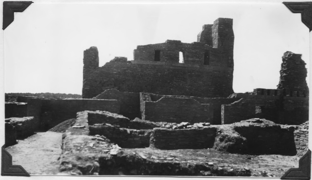
12. Church and convento during excavation. May 1939.