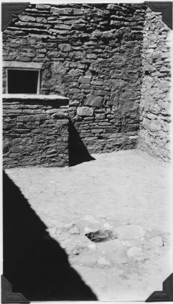
17. Stabilized baptistry font, partially restored. May 1939.