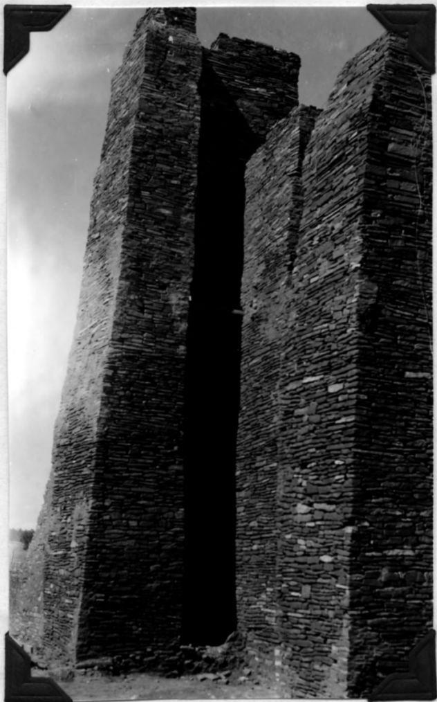
14. West side of church. Note beams (original) in center. May 1939.