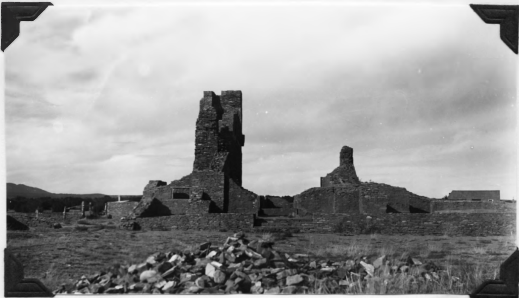
5. Church from the front (south), after stabilization.