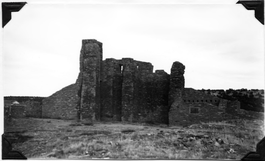
7. Church from the west after stabilization. October 29, 1940.