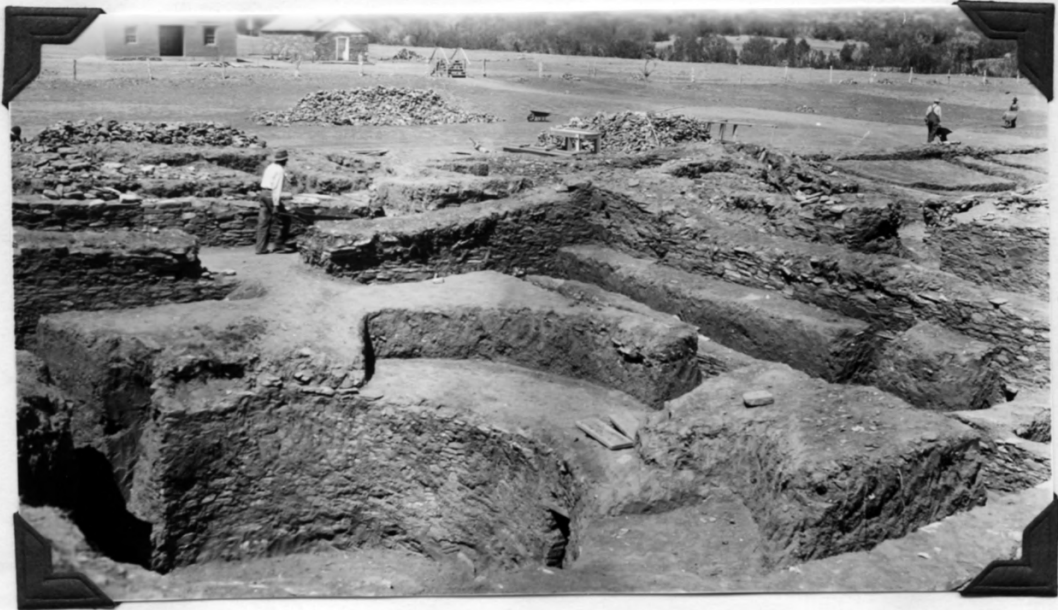
15. Excavation of the convento. Kiva in foreground. May 1939.