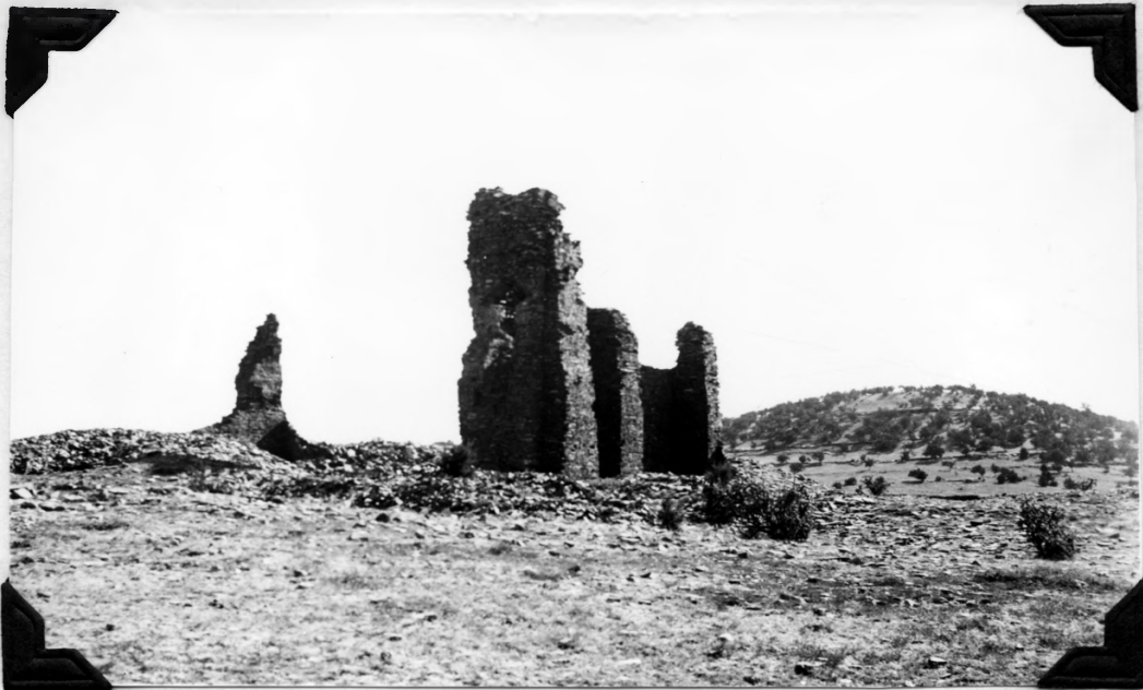
2. Church ruins, Abo, November 1935, from the northwest (altar end and starboard side).