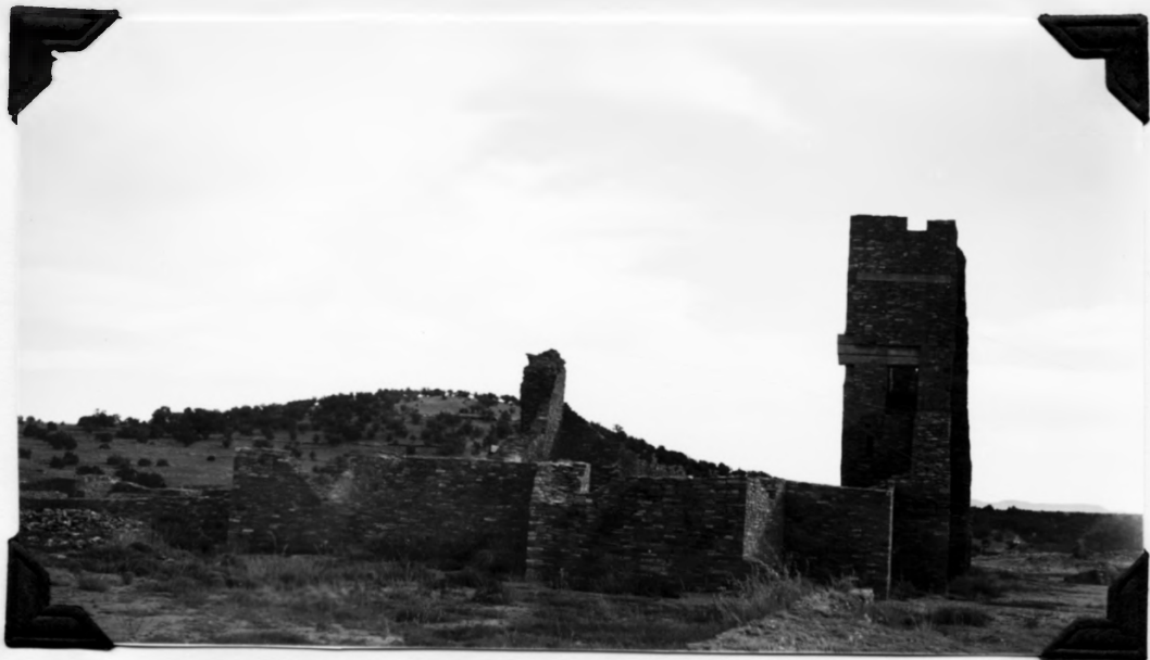
6. Church from the north (altar end), after stabilization. October 29, 1940.