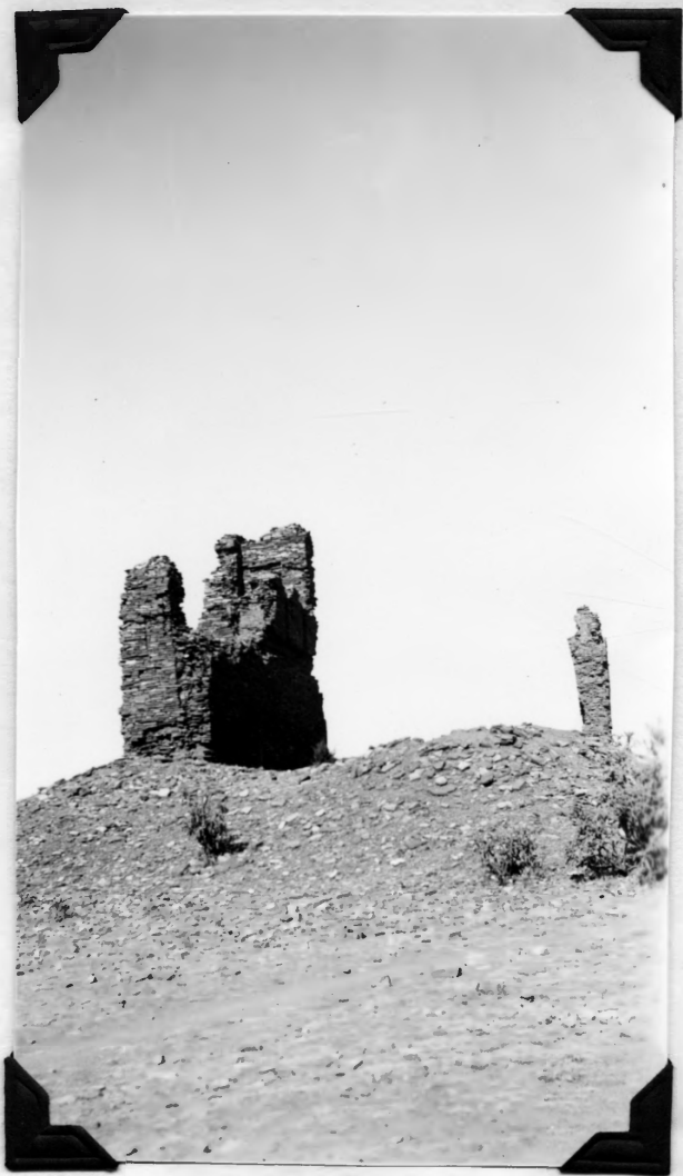
1. Ruins of San Gregorio Mission church, Abo, from the front (south), prior to rehabilitation.