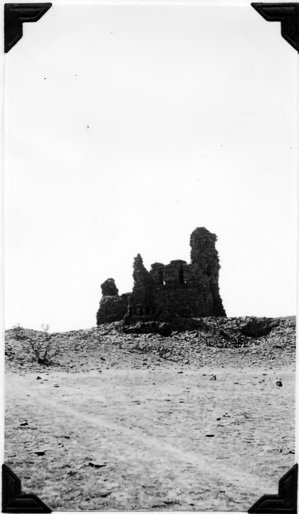
3. Mission ruins, Abo, November 1935, from the east. Convento in middle-ground, church seen from left side.