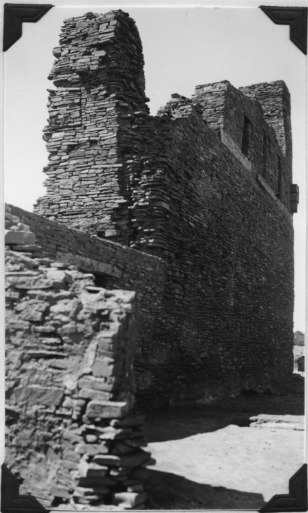
13. West wall of nave during stabilization. May 1939.