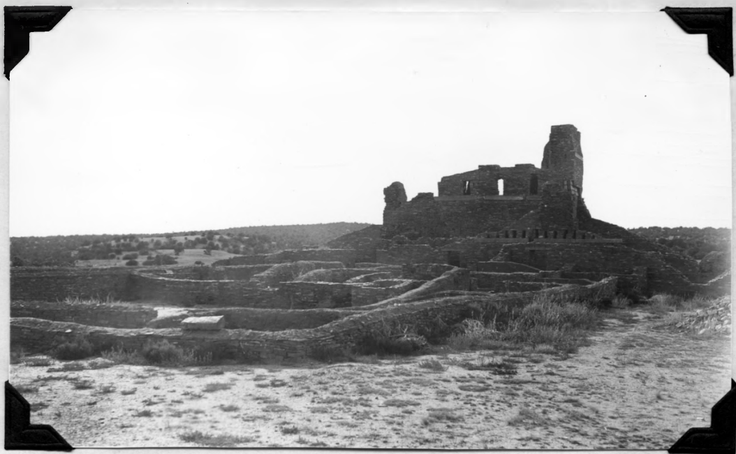
8. Abo Mission from the east after stabilization. October 29, 1940.