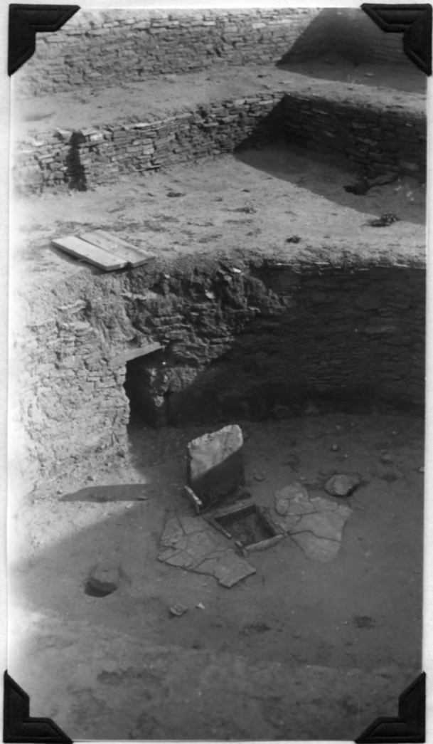
11. Kiva in court of monastery.