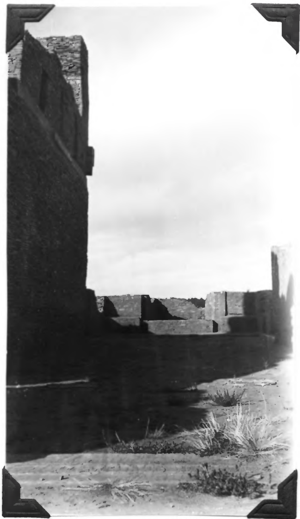
10. Nave of the Abo church, looking toward altar end. October 29, 1940.