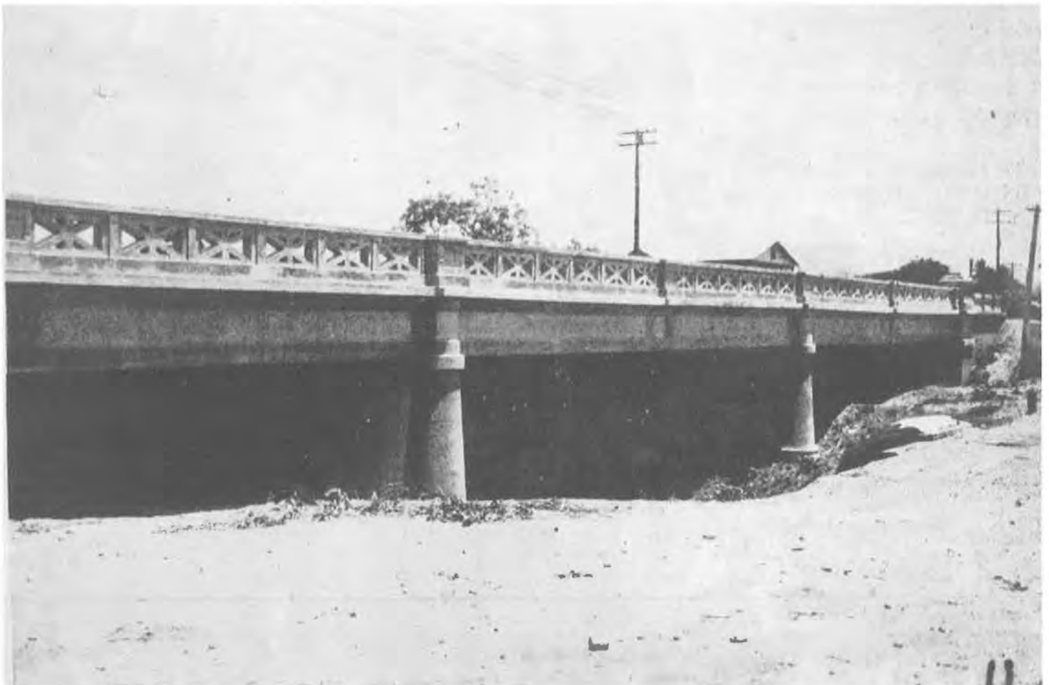
Figure 6. Puente Río Portugués, as shown in the 1934's front-cover of the June's edition of the Revista de Obras Públicas de Puerto Rico .