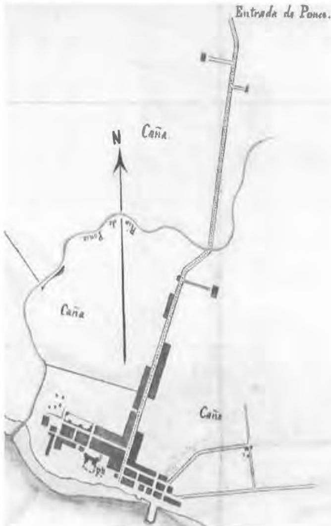
Figure 3. A Playa 1884' sketch (left) and a 1913 map, showing the Portugues River 's flowing pattern from the City to Playa. Both drawing show the point where the river bisects the Camino Real, current location of Puente Río Portugués.