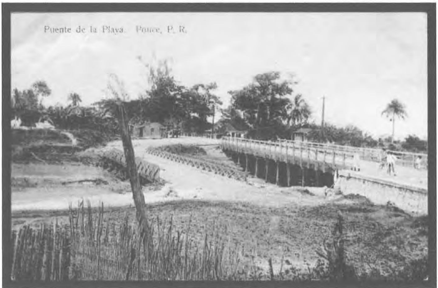
Figure 5. Early 20 th century postcard showing the bridge built by the Ponce Electric Company.