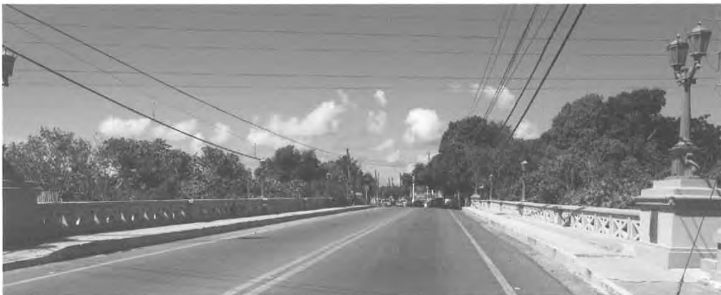
Figure 7. Puente Río Portugués.