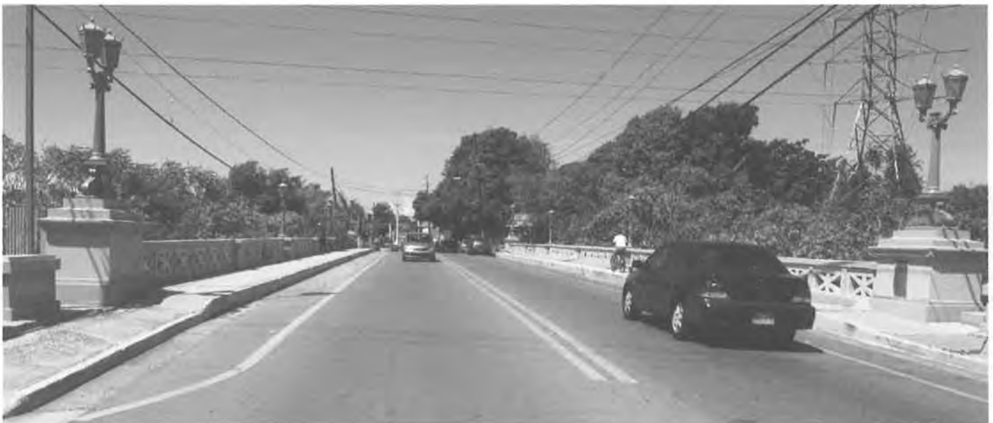
Figure 2. Puente Río Portugués.