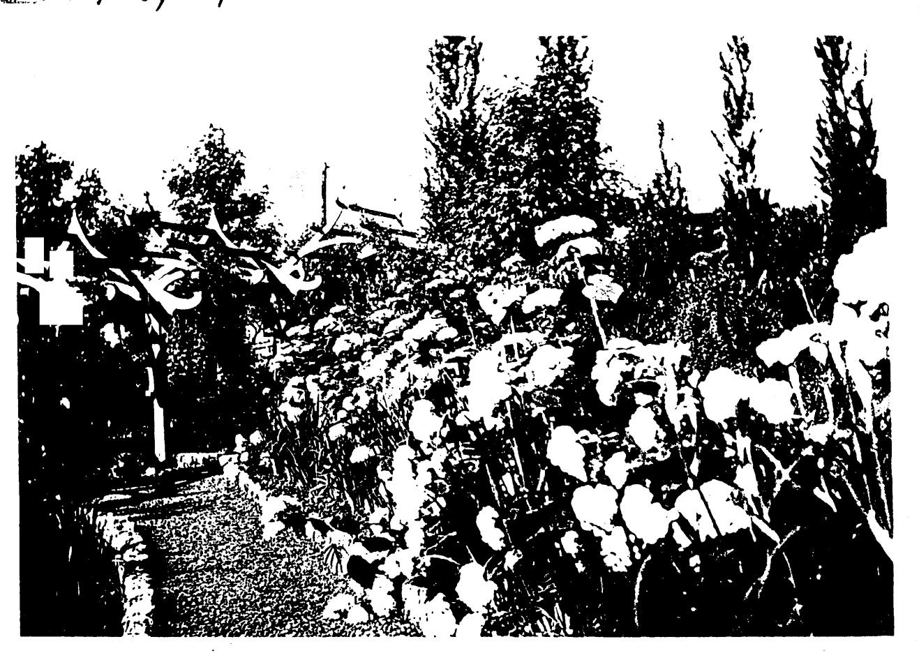
SAVAGE HOUSE AND GARDEN