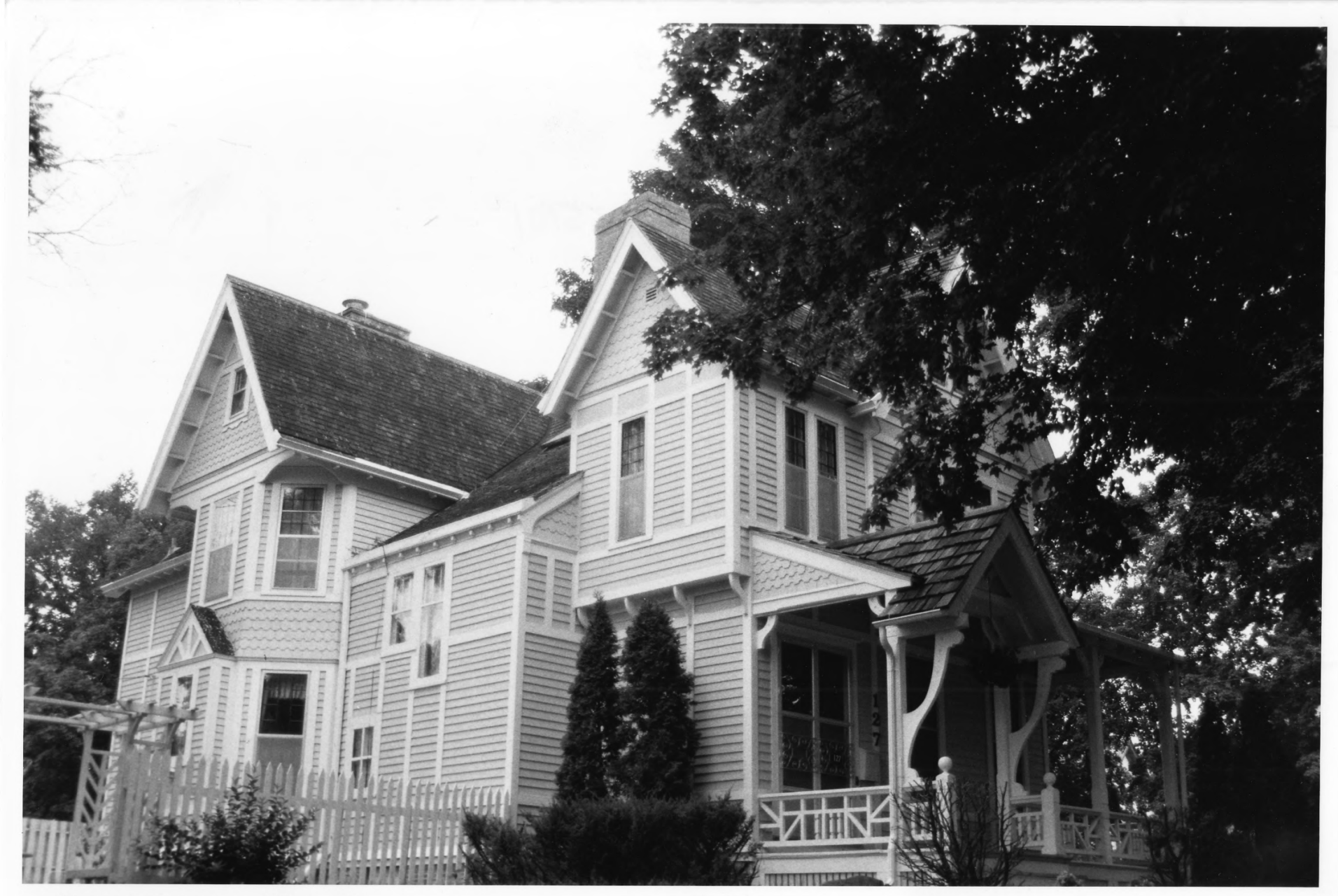
COTTRELL HOUSE FARIBAULT RICE CO., MM PHOTO 1.D. 09517#34