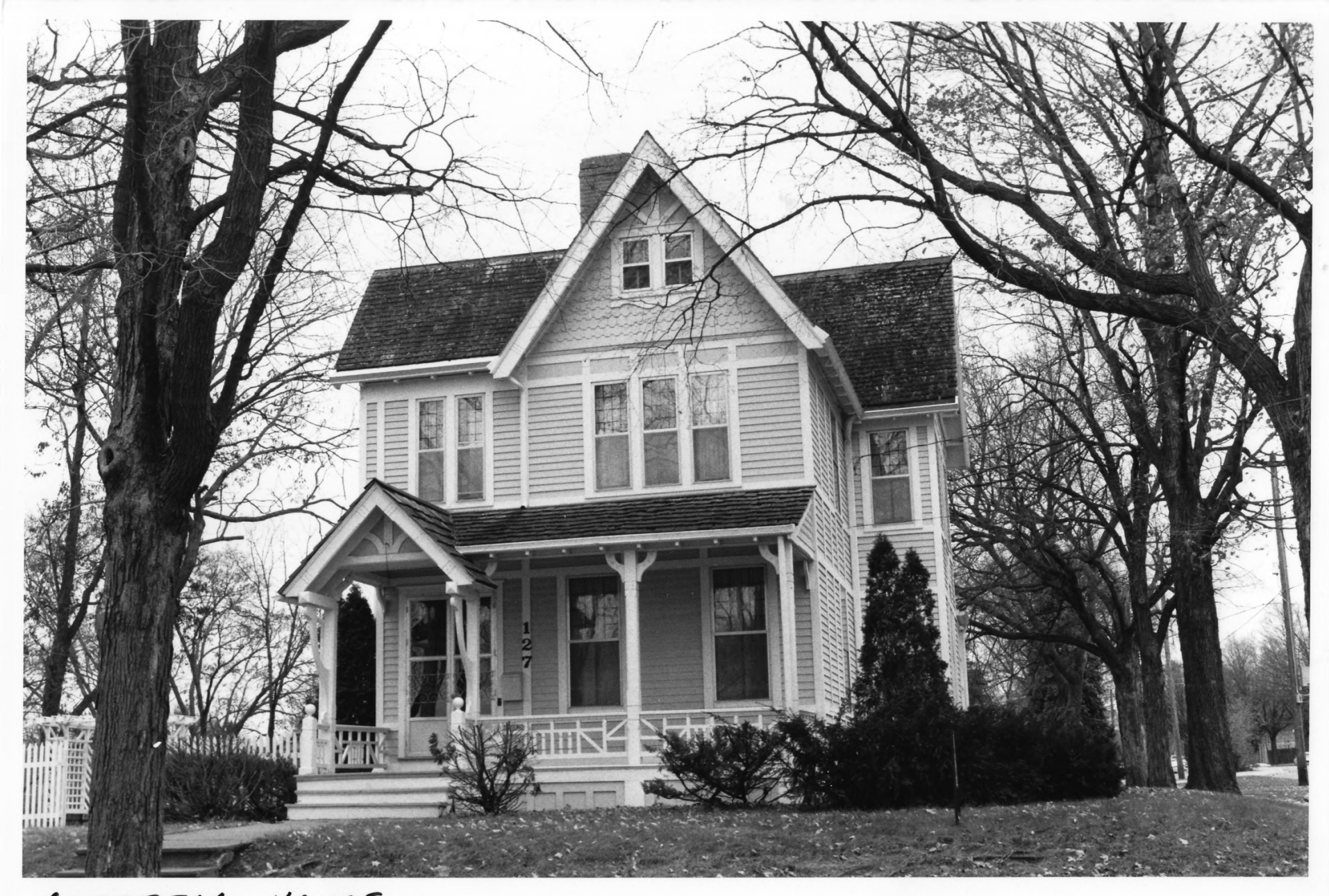
COTTRELL HOUSE FARIBAULT RICE CO., MN PHOTO 1.D. 09542#8