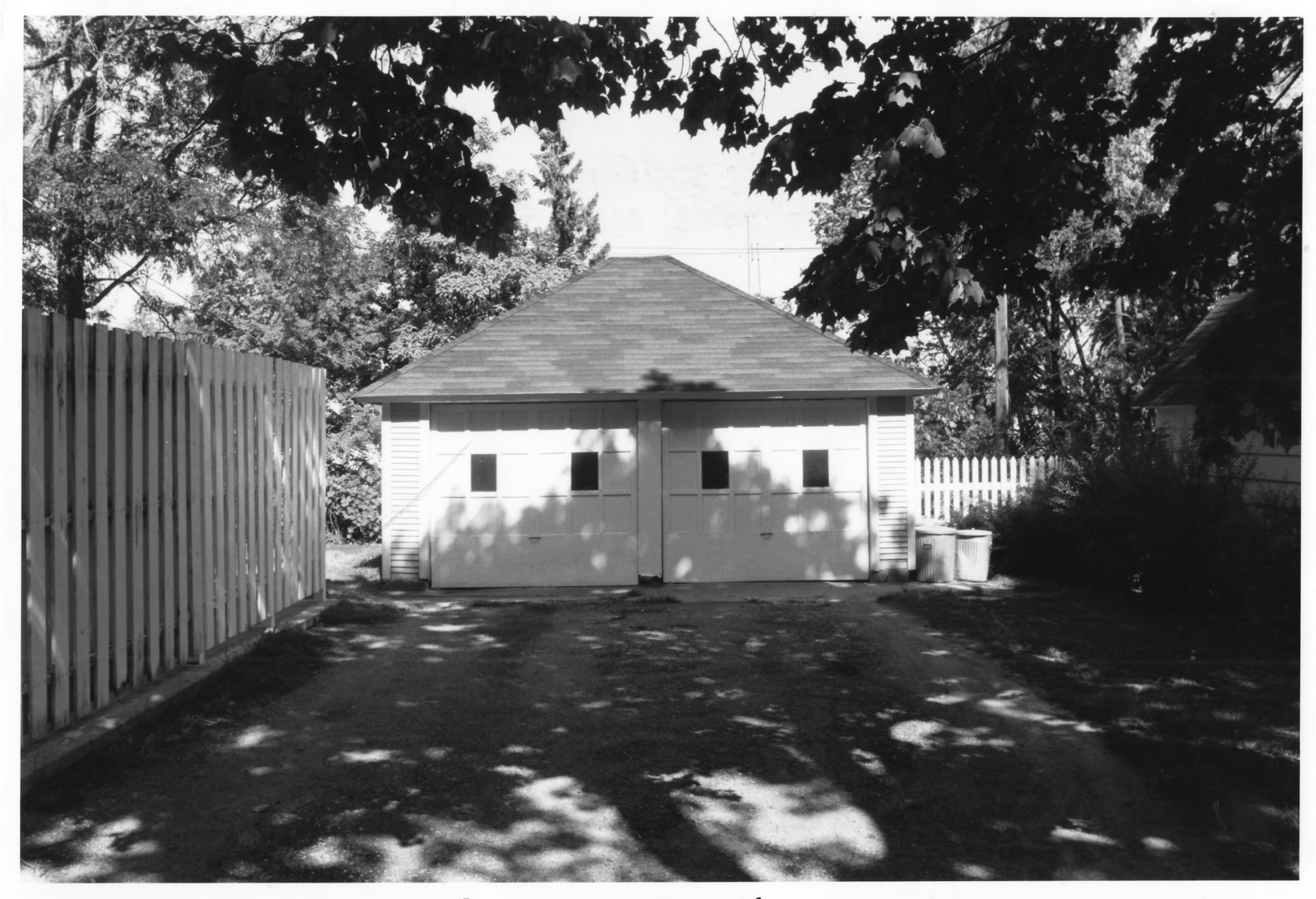
COTTRELL HOUSE, GARAGE-NONCONTRIBUTING FARIBAUT 12ICE CO., MN 09929 #21