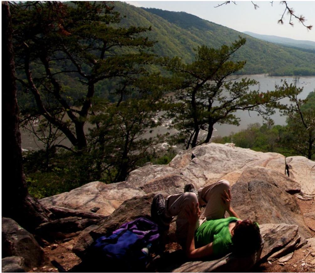
Important views like this one along the Appalachian Trail are among those priority areas identified for protection by partners such as the Catoctin Land Trust.