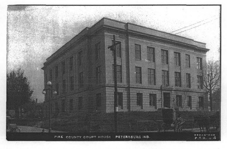
Current Pike County Courthouse, c. 1930.

Pike County Courthouse, Petersburg, Indiana