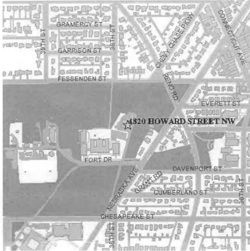
Jesse Reno School, 4820 Howard Street, NW (DC GIS Master Address Repository, 2004)