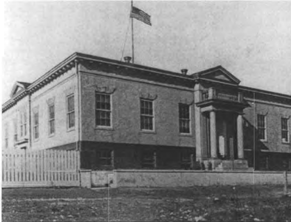
Jesse Reno School