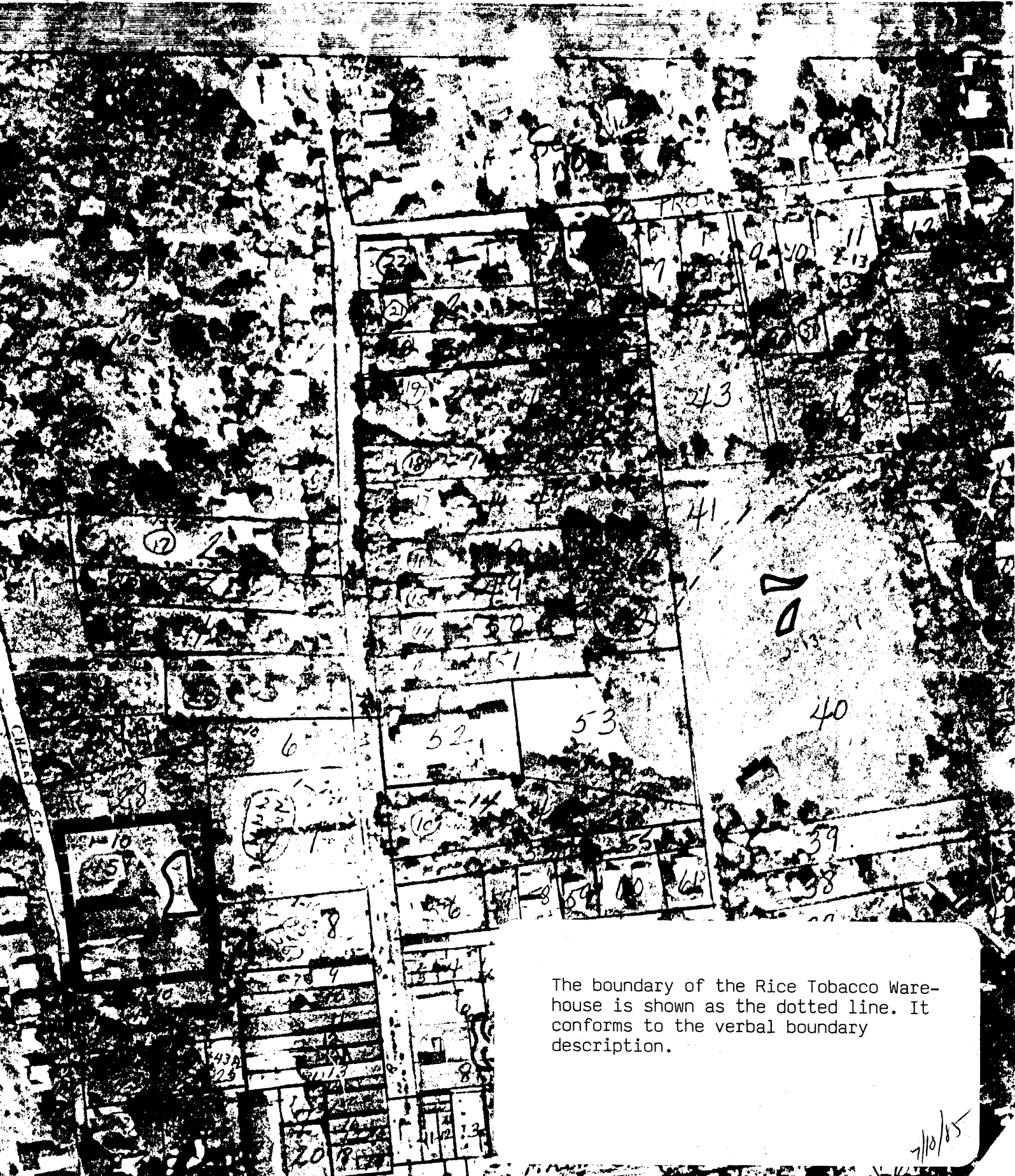
The boundary of the Rice Tobacco Warehouse is shown as the dotted line. It conforms to the verbal boundary description.