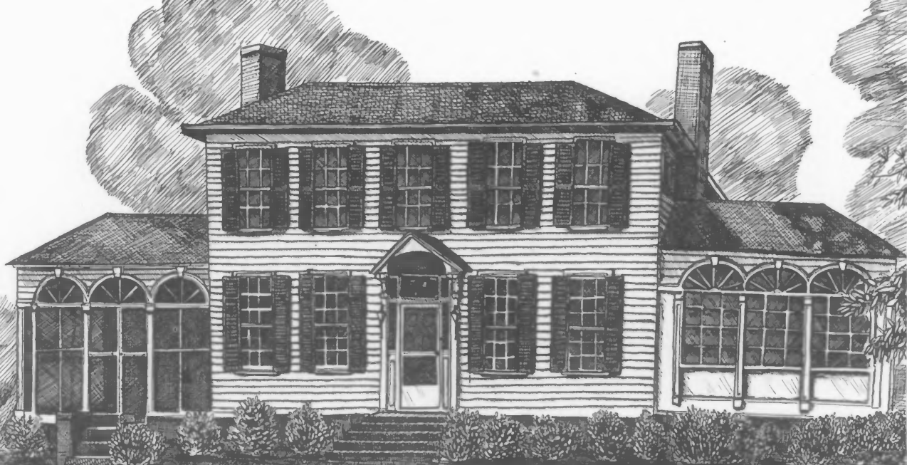
Chieftains Museum Rome, Georgia