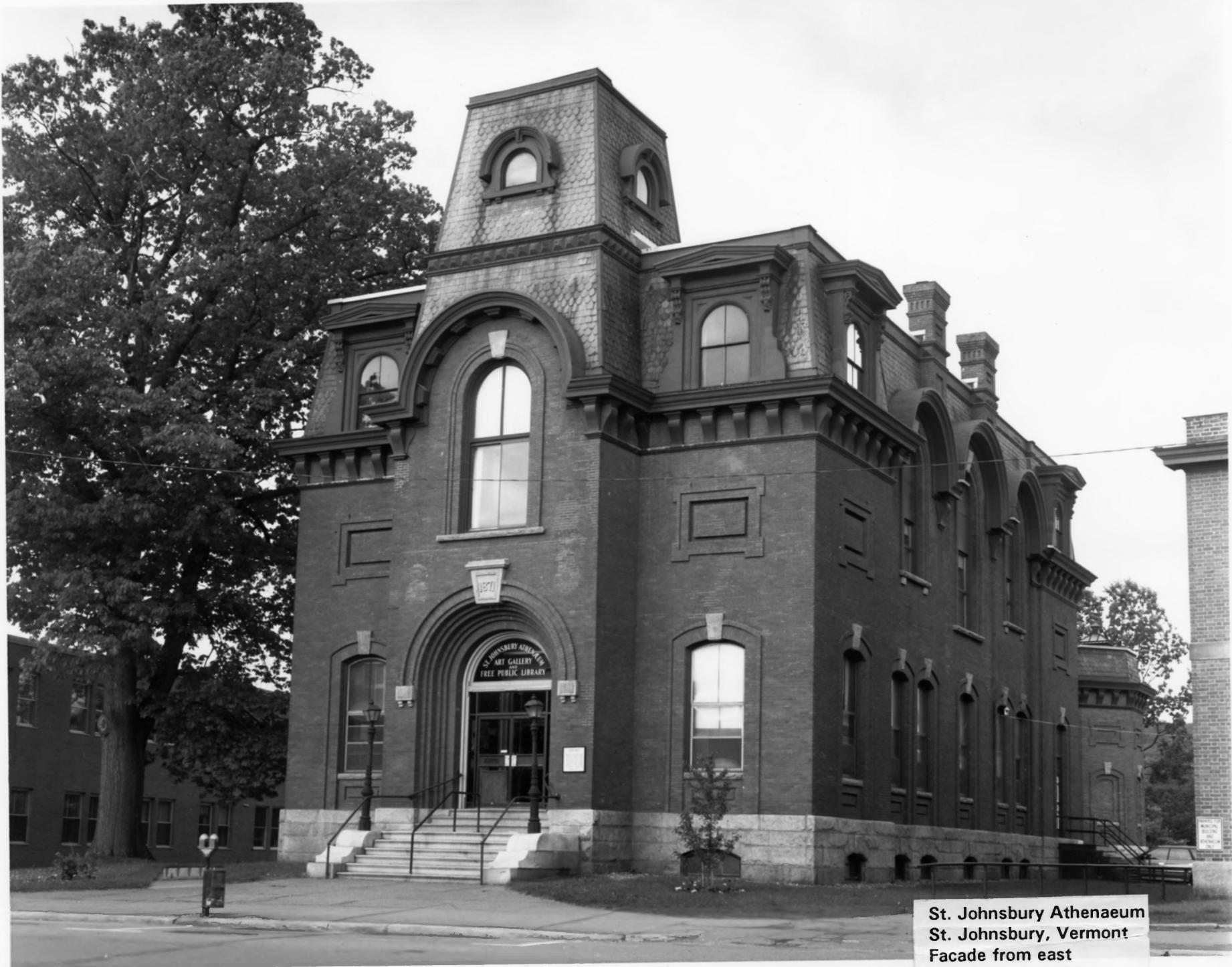
St. Johnsbury Athenaeum St. Johnsbury, Vermont Facade from east