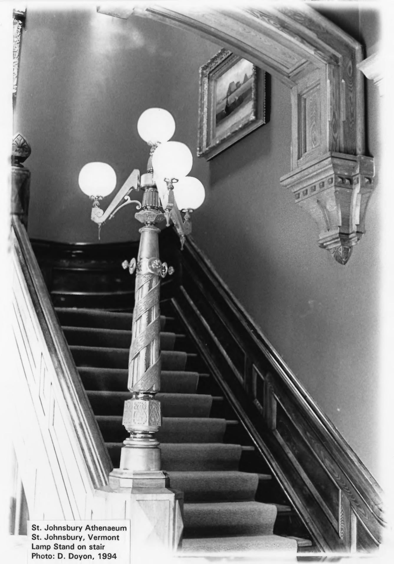
St. Johnsbury Athenaeum St. Johnsbury, Vermont Lamp Stand on stair