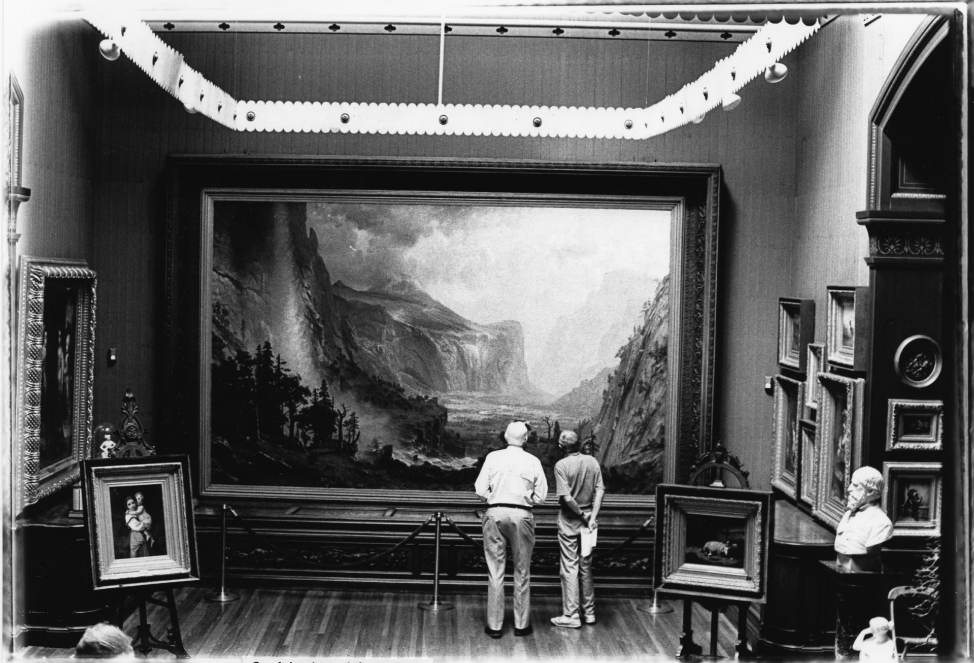
St. Johnsbury Athenaeum St. Johnsbury, Vermont Interior: Bierstadt