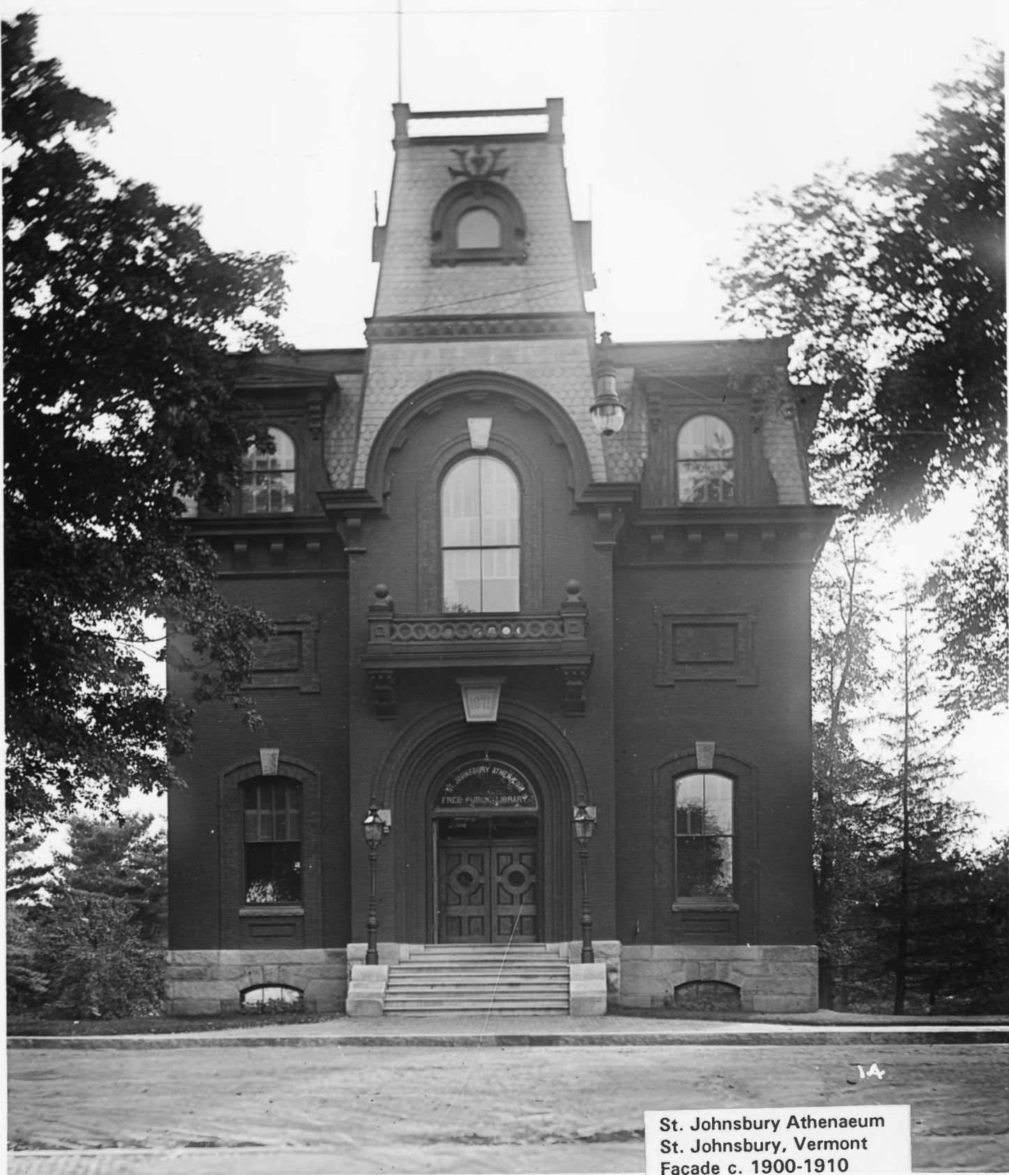
14 St. Johnsbury Athenaeum St. Johnsbury, Vermont Facade c. 1900-1910