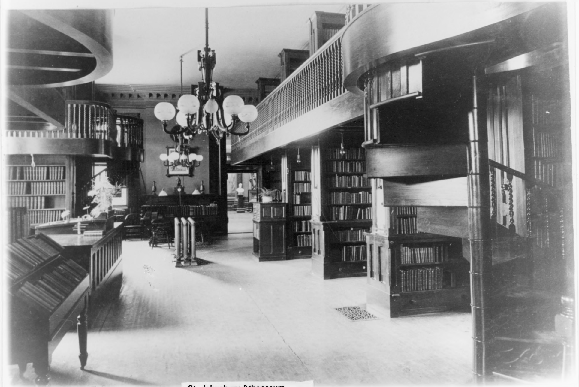
St. Johnsbury Athenaeum St. Johnsbury, Vermont Book room, c. 1901