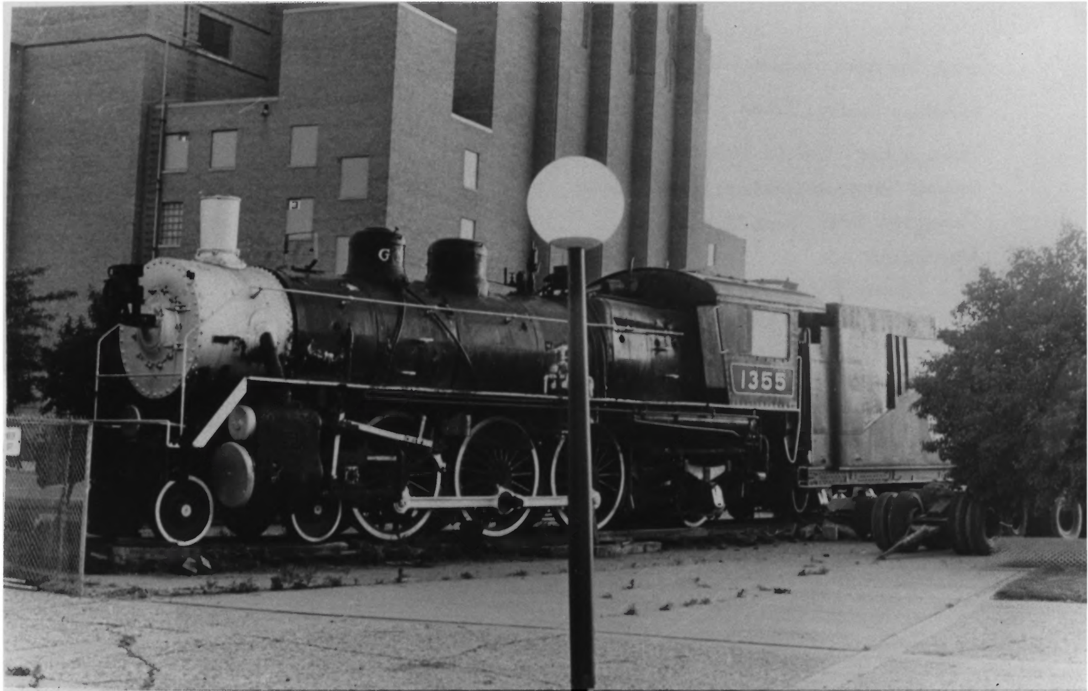
"THE LAST NIGHT"