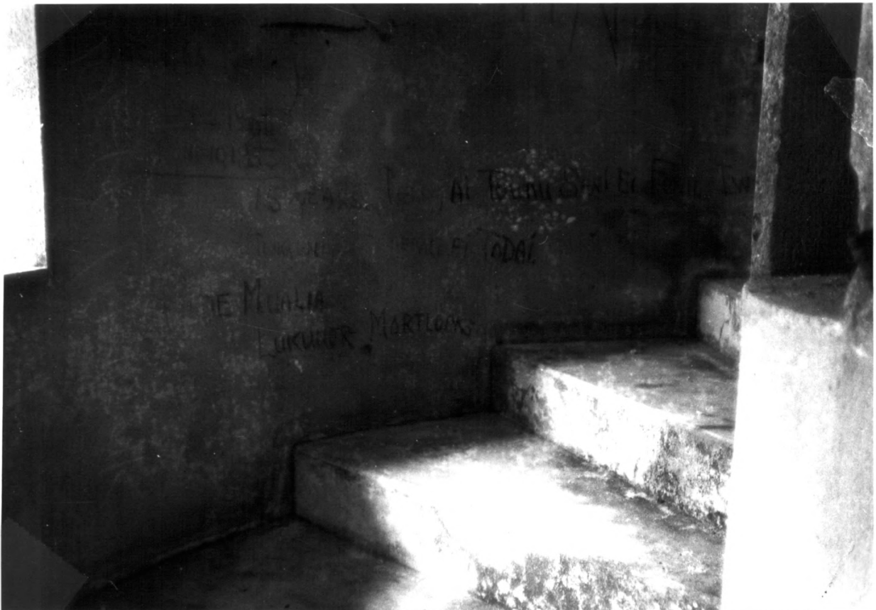
Plate 3. Interior tower steps. Note graffiti.