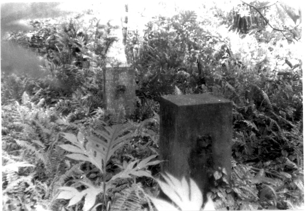
Plate 7. Remains of perimeter fence.