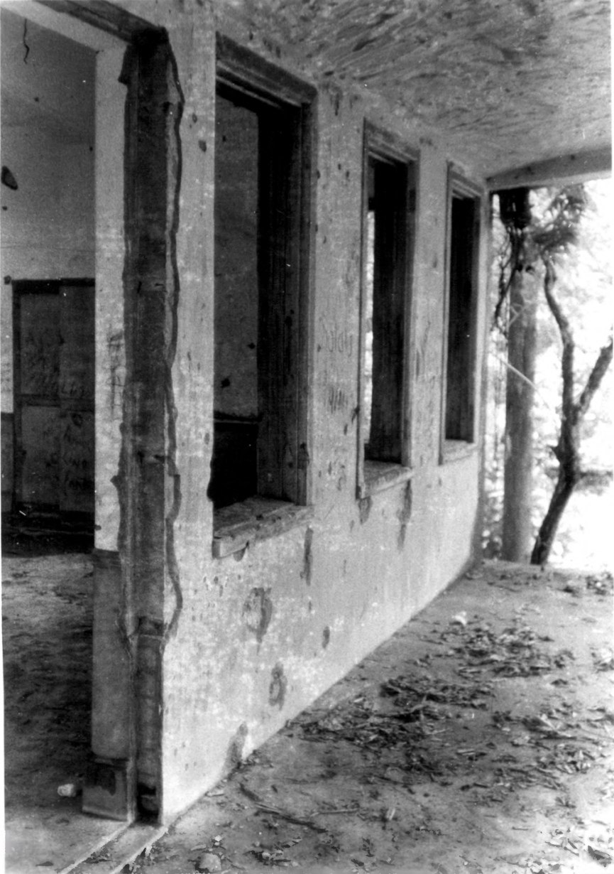
Plate 8. Operations building west face #1, second floor. Note bullet scars.