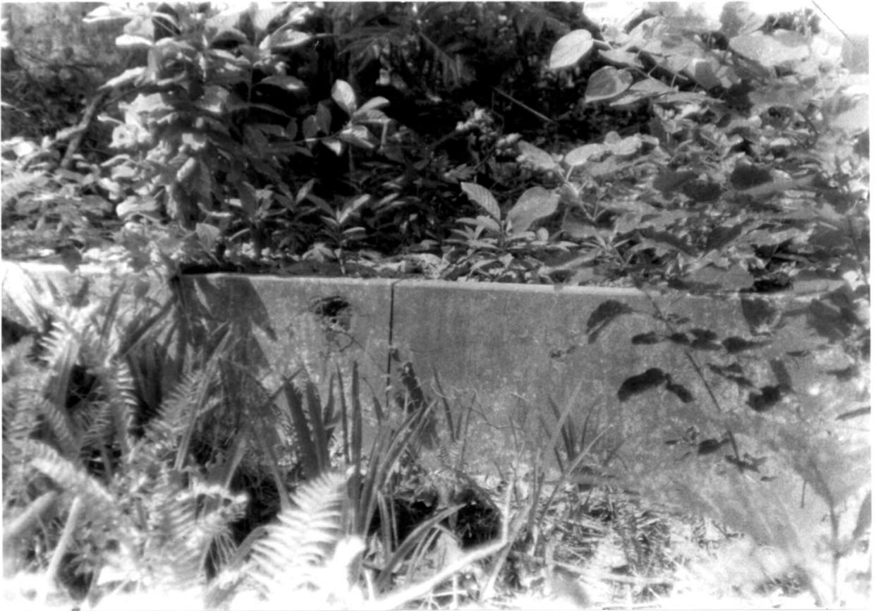
Plate 6. Retaining wall of foundation.