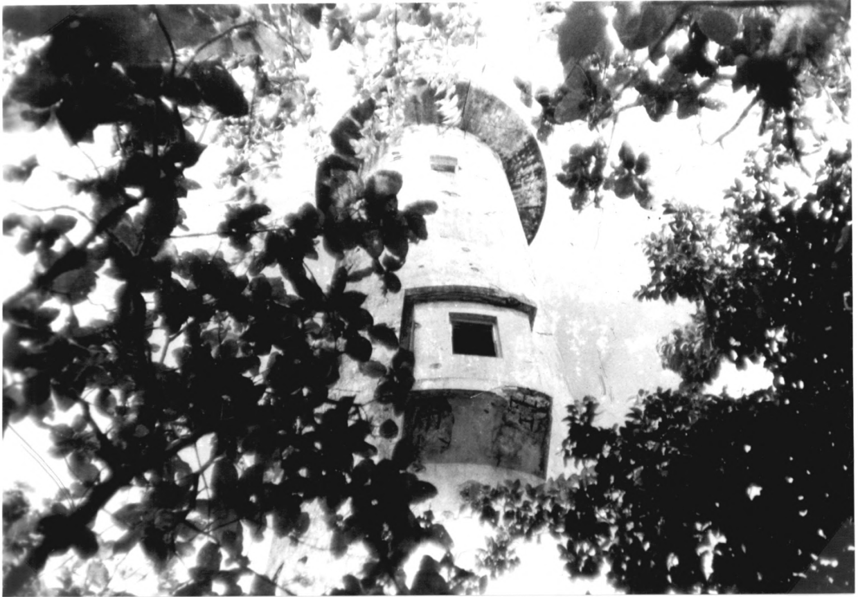
Plate 2. Tower looking up from ground level.