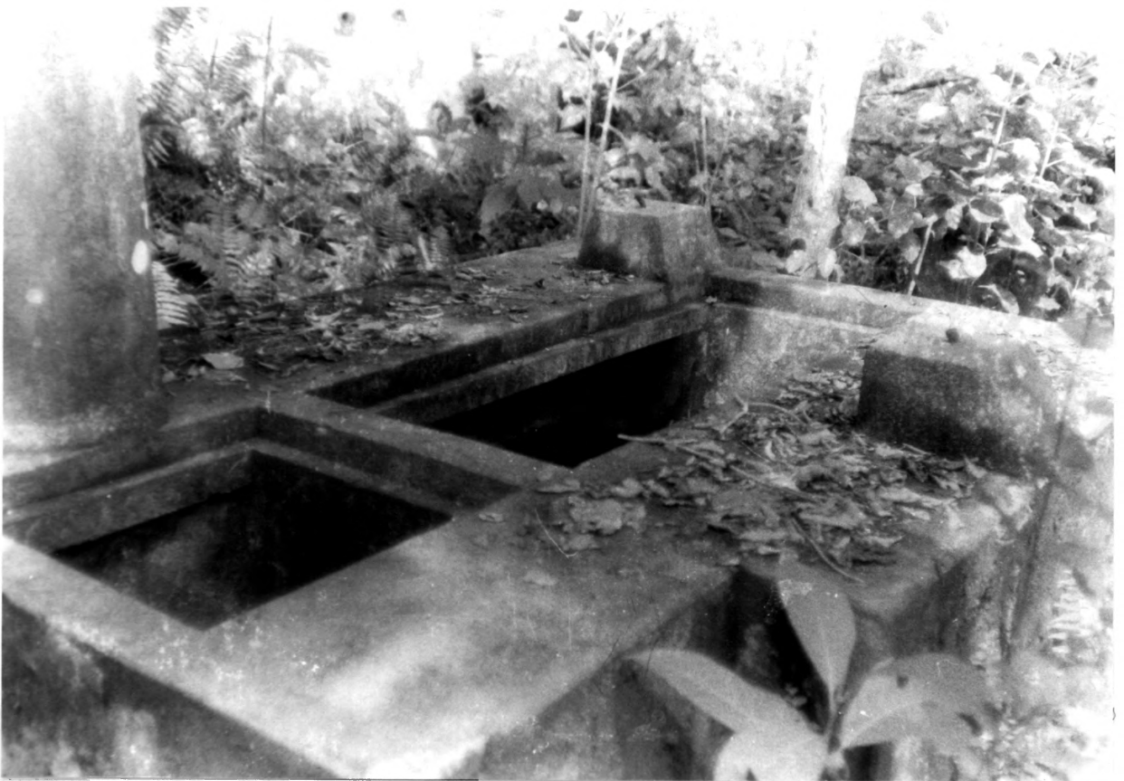
Plate 5. Water catchment