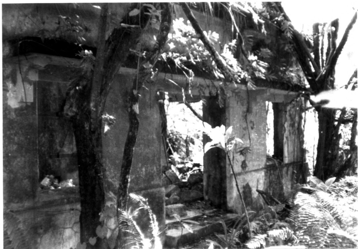
Plate 9. Generator building.