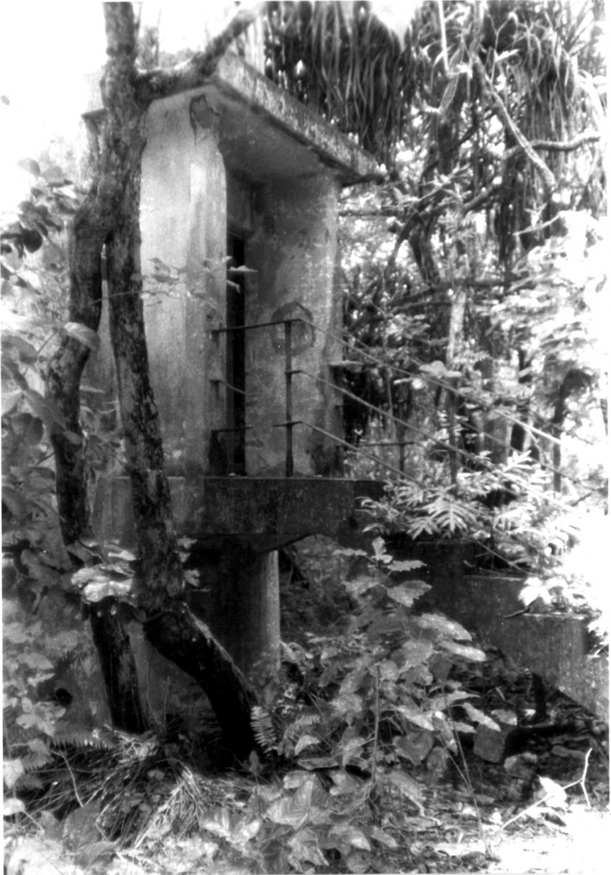
Plate 1. Main tower entrance (looking north).