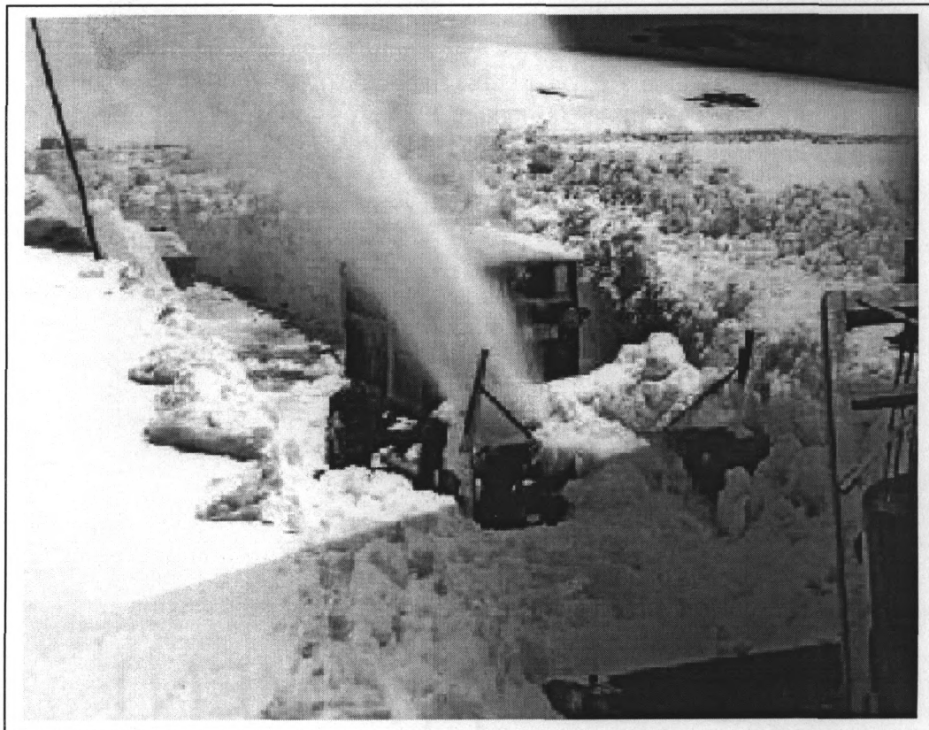
Snogo Snow Plow at work on Trail Ridge Road, 1941- photo courtesy of RMNP.

The width of the plow was designed to be 7 feet 10 inches in order to fit inside the garages of the day. The Snogo has a 125 gallon gas tank, which was claimed to be enough for 24 hours of operation. The Snogo was also equipped with an eight speed gear box that resulted in speeds of one quarter mile per hour in low, and up to 25 miles an hour in high gear when not moving snow.