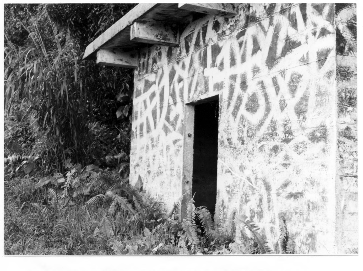
Ammunition magazine for 6-inch naval gun battery, Blunts Point, American Samoa.