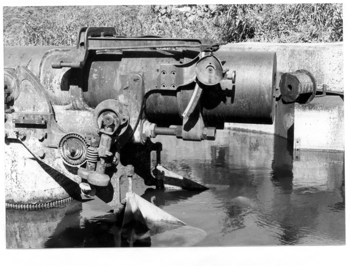
A 6-inch naval gun, Blunts Point, American Samoa. The water in the pit is full of toads.