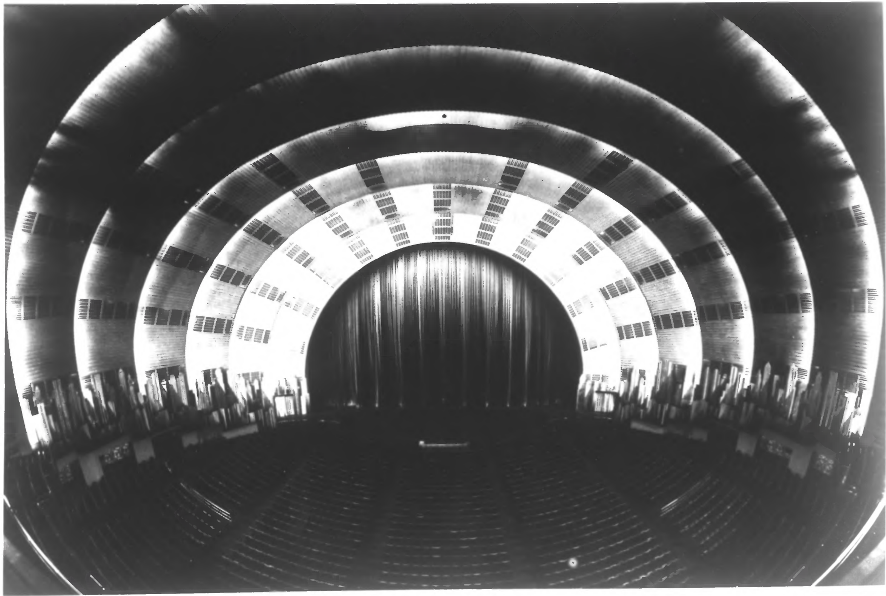
Radio City Music Hall. Interior New York, New York