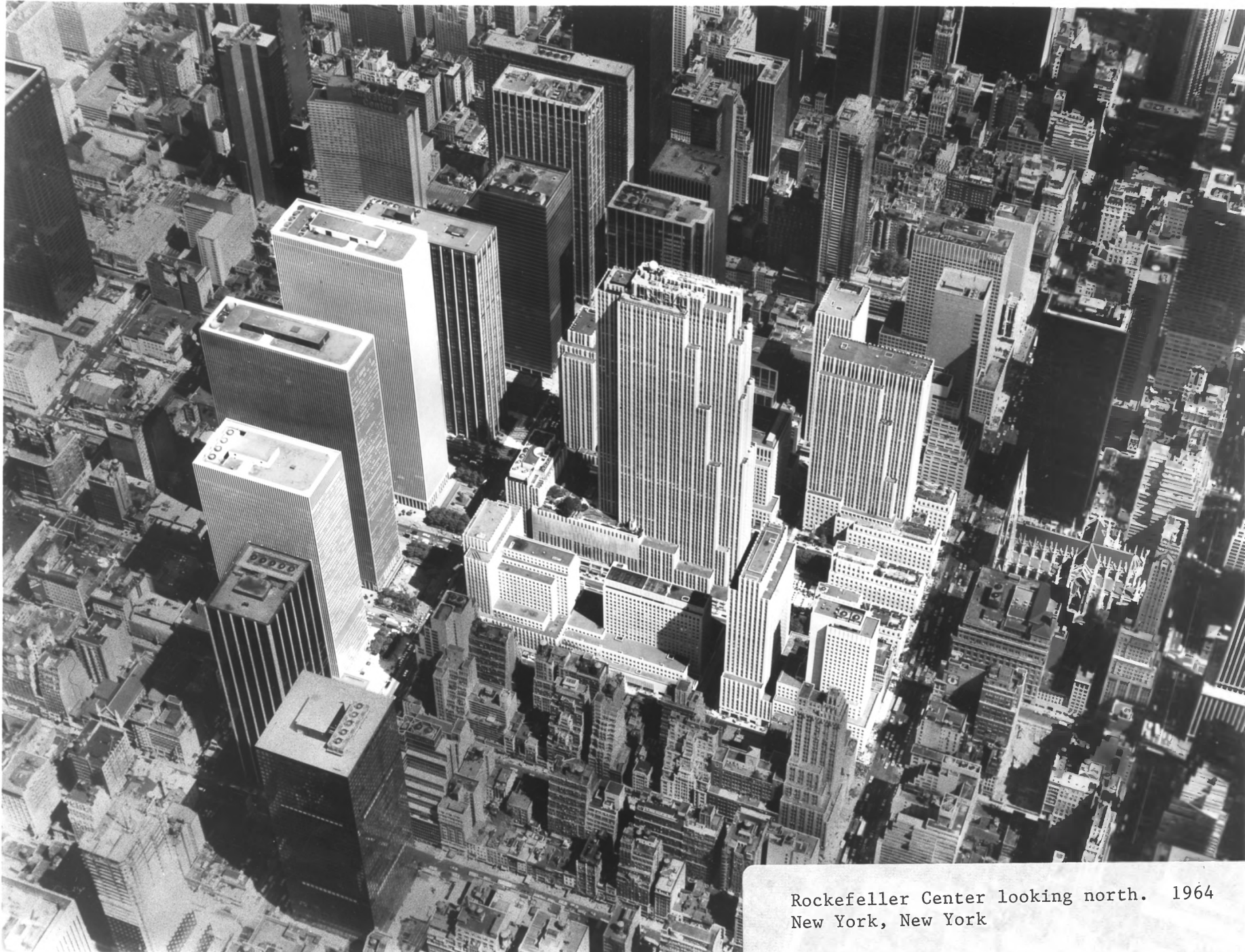
Rockefeller Center looking north. 1964 New York, New York