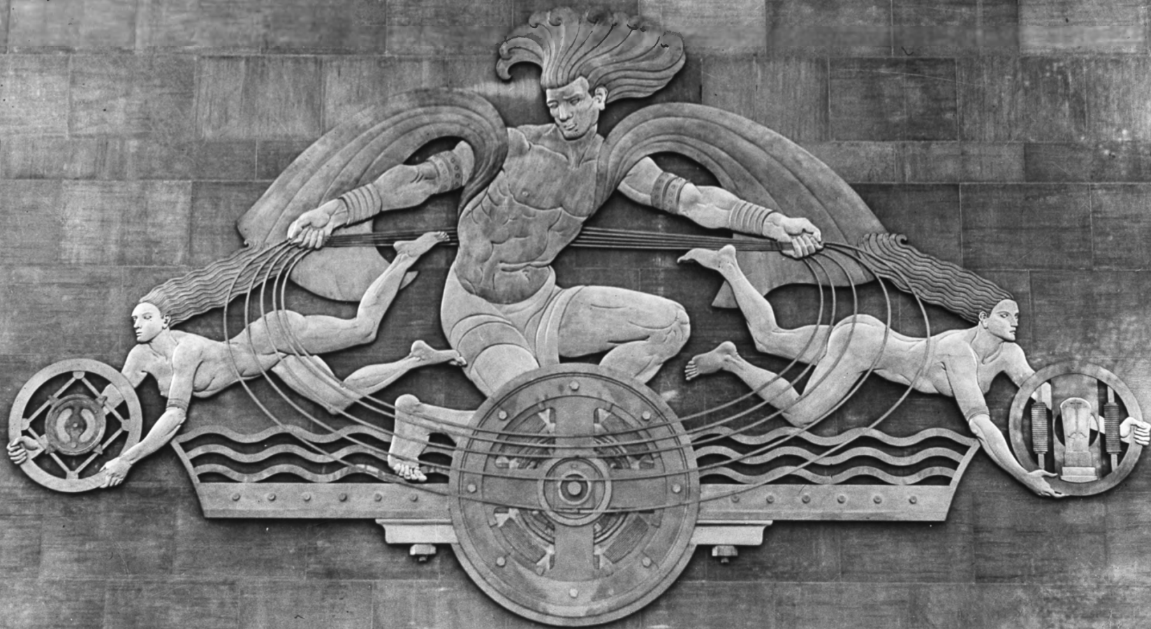
Rockefeller Center. "Spirit of Energy sending out Radio and Television." New York, New York