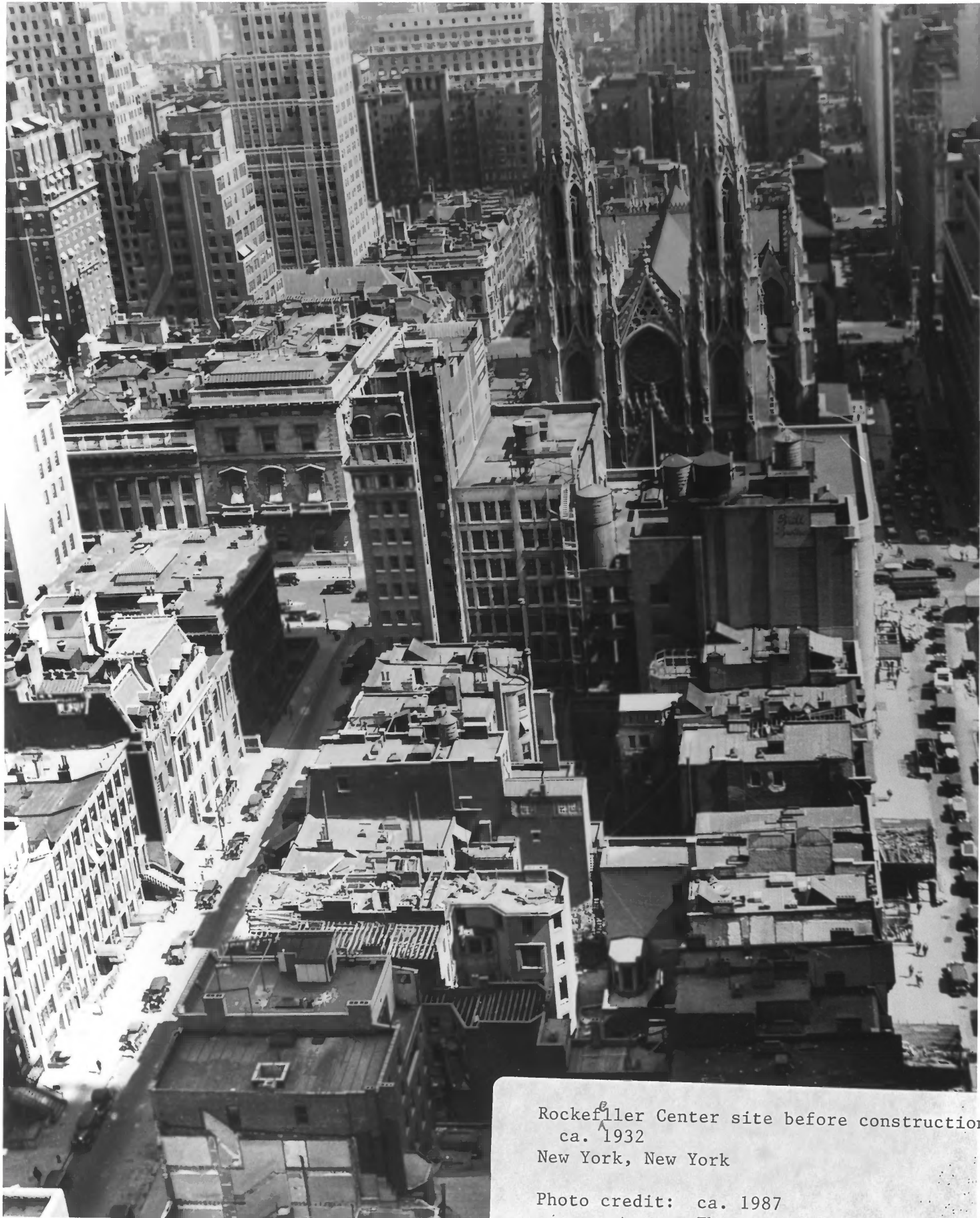
Rockefeller Center site before construction, ca. 1932 New York, New York