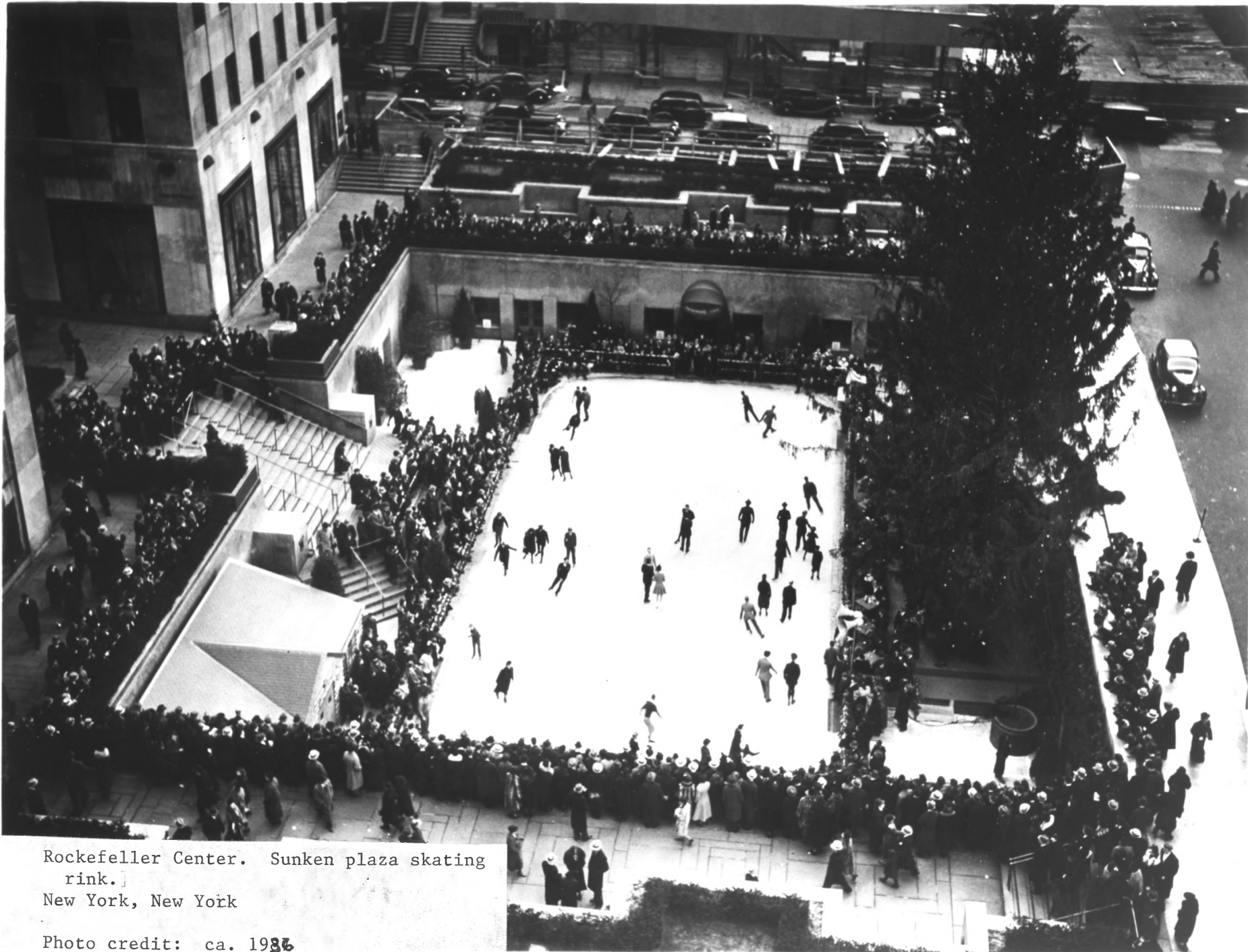
Rockefeller Center. Sunken plaza skating rink.] New York, New York