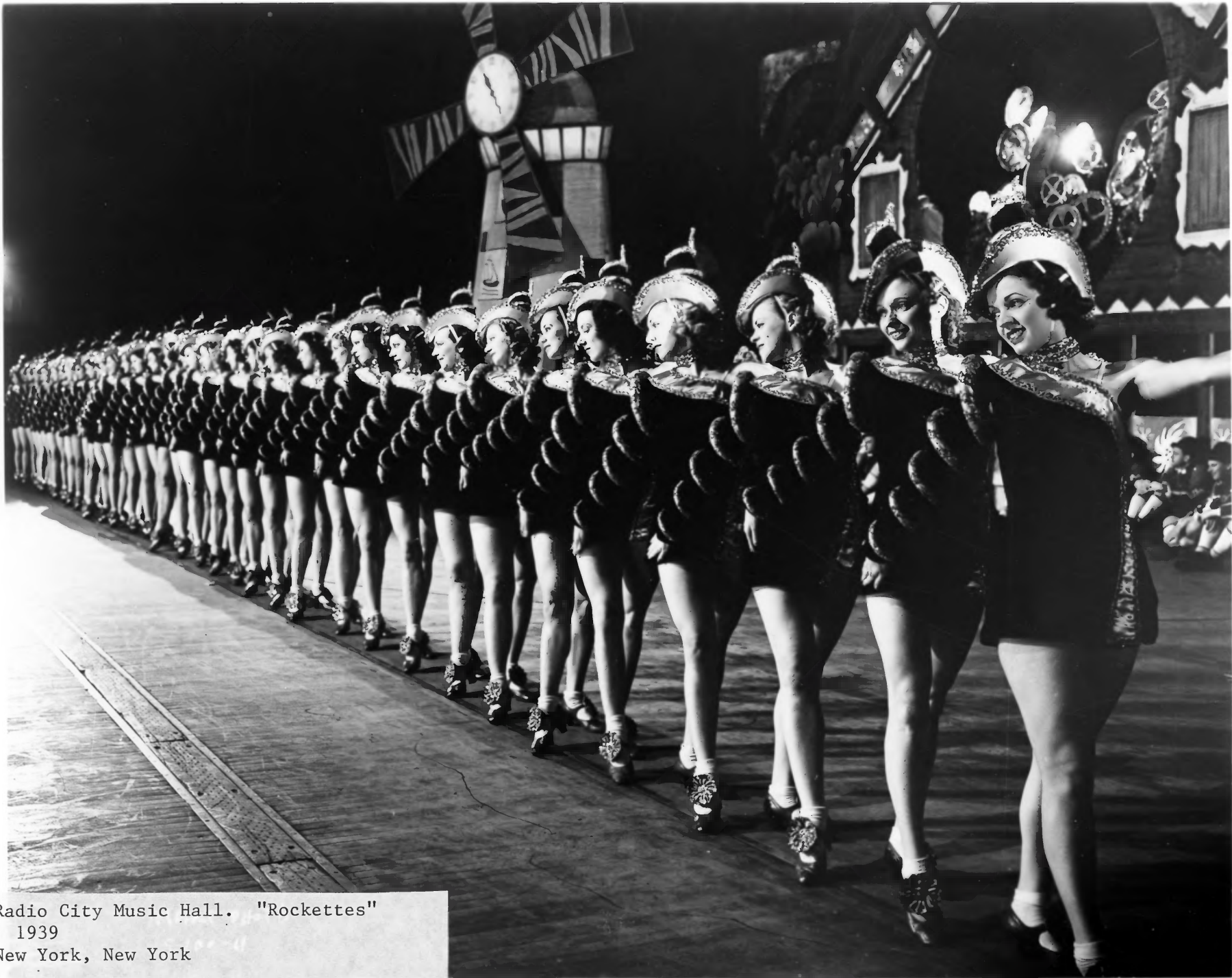
Radio City Music Hall. "Rockettes" 1939 New York, New York