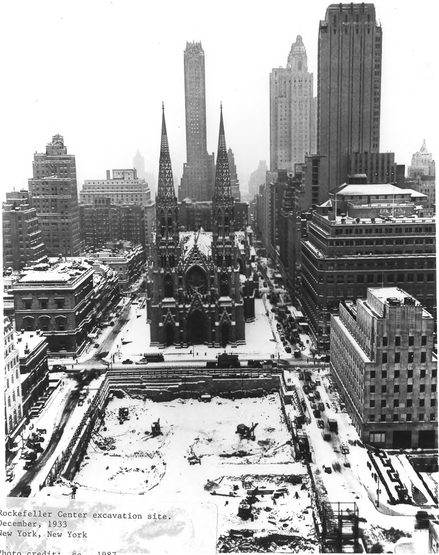
Rockefeller Center excavation site. December, 1933 New York, New York