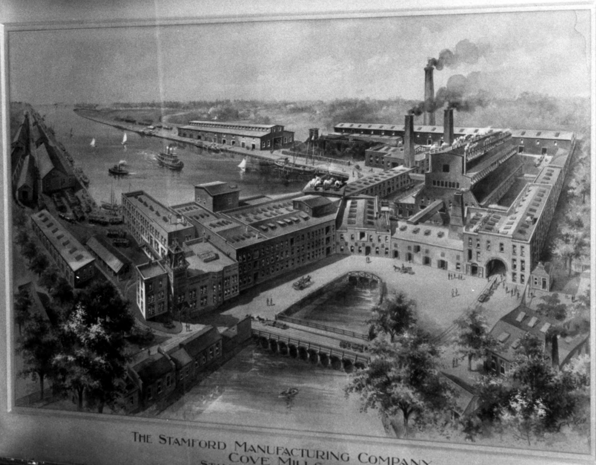
THE STAMFORD MANUFACTURING COMPANY COVE MILLS STAMFORD, CONNECTICUT