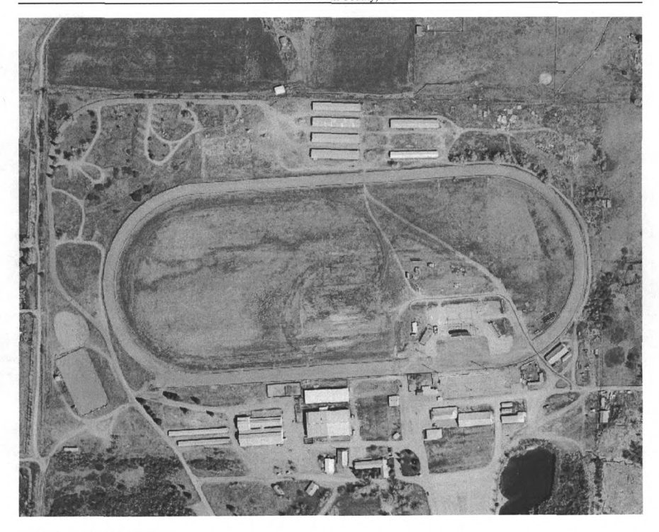
Aerial view of fairgrounds, 2004.