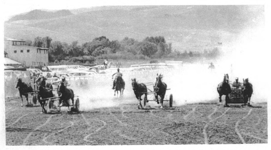
Chariot race, undated