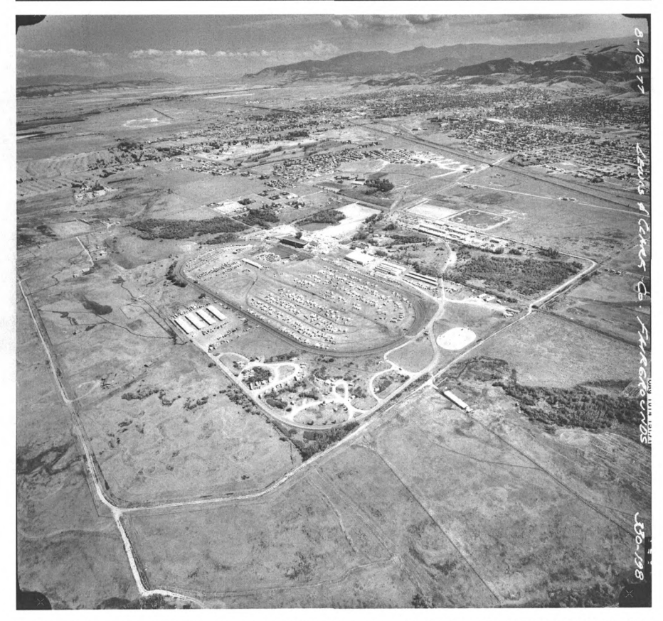
Aerial view to the southeast, 1977.