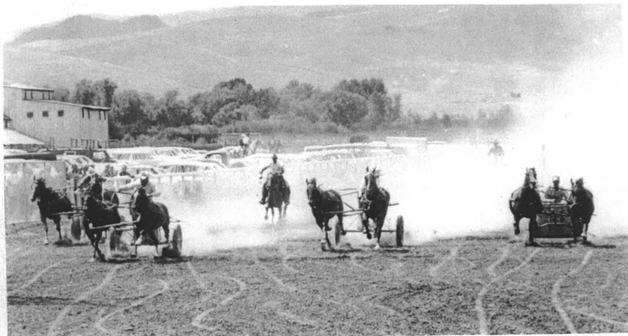
Chariot race, undated photo courtesy of the Montana Historical Society, "Helena – Last Chance Stampede Collection," Helena, MT.