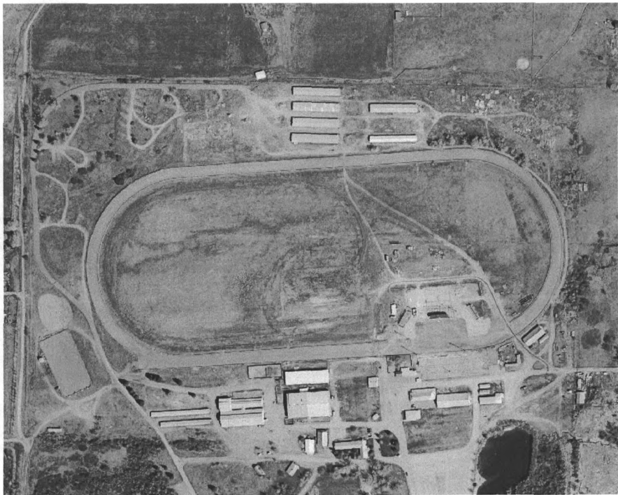
Aerial view of fairgrounds, 2004.