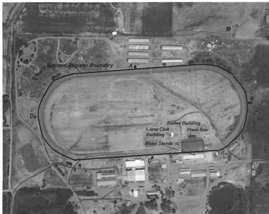
Aerial view showing National Register boundary and labeled resources, 2005.