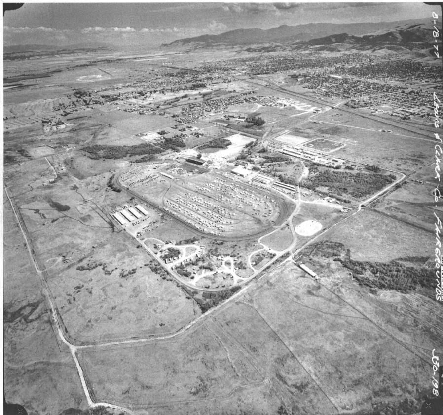
Aerial view to the southeast, 1977.