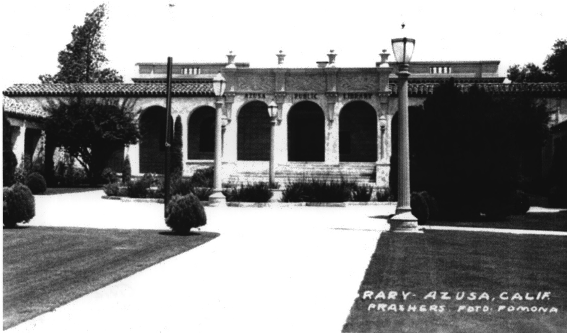
LIBRARY - AZUSA, CALIF.