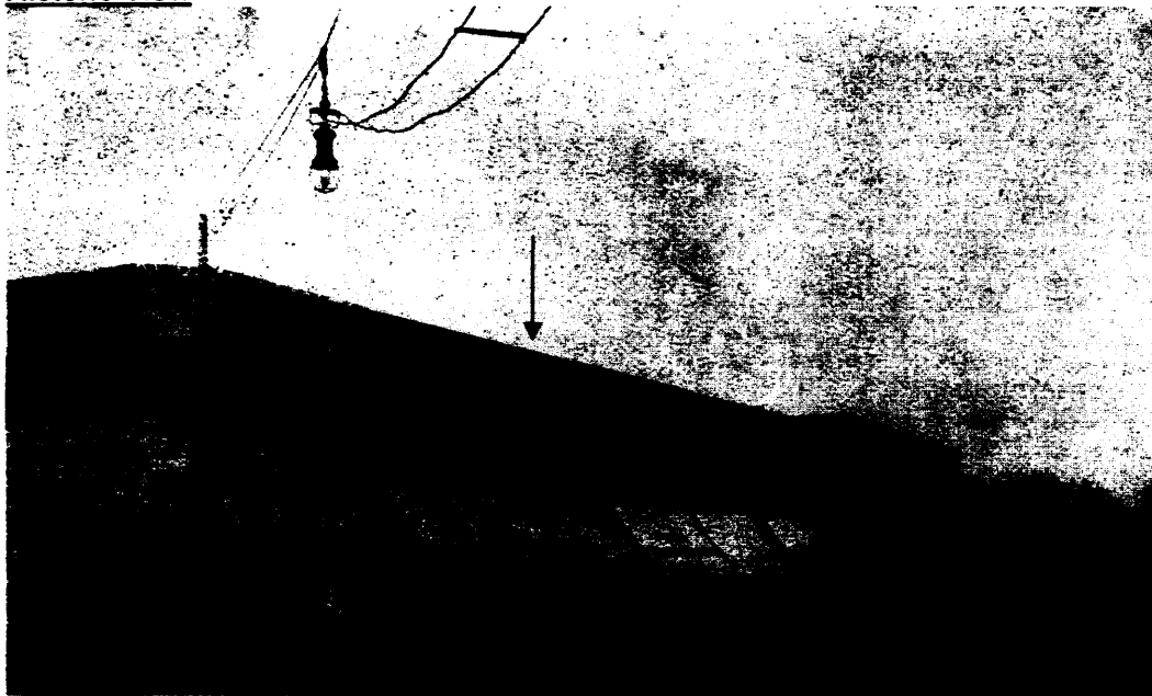
Baynes North Main Street, Lindsborg, Kas., West Side.

Postcard of West side of North Main, postmarked 1908; Source: Photo collection, Old Mill Museum, Lindsborg