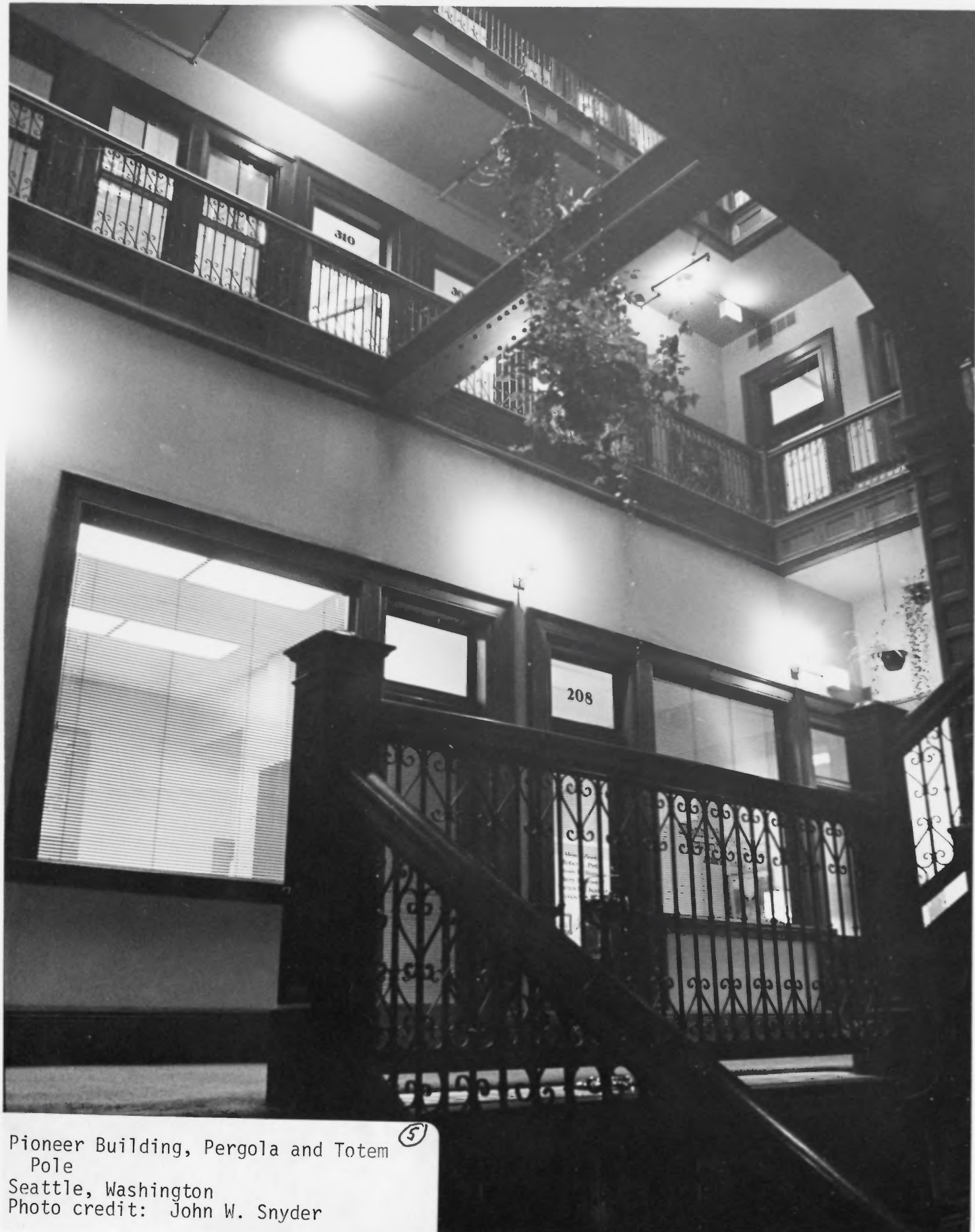
Pioneer Building, Pergola and Totem (5) Pole Seattle, Washington