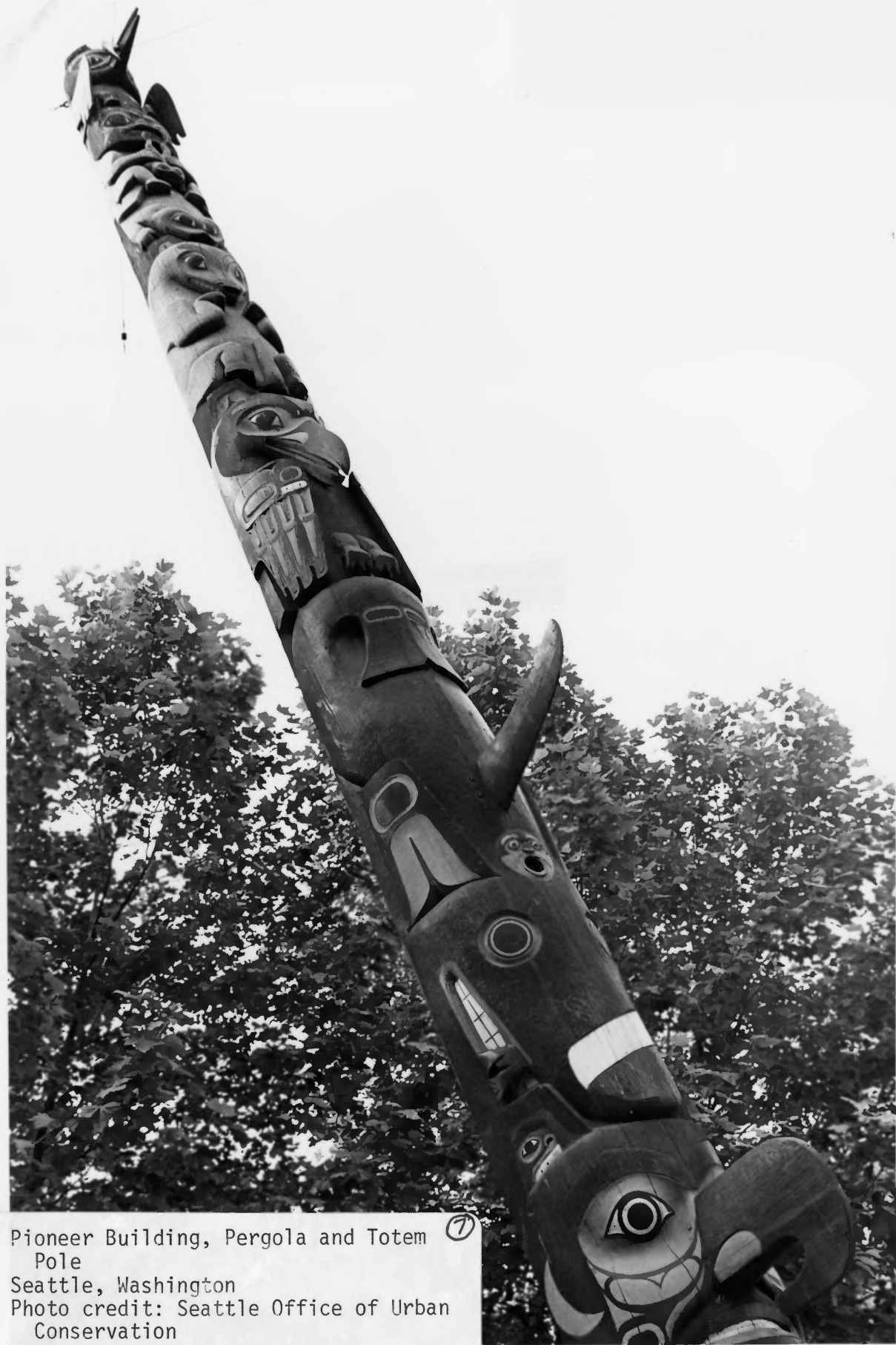
Pioneer Building, Pergola and Totem Pole ⑦ Seattle, Washington