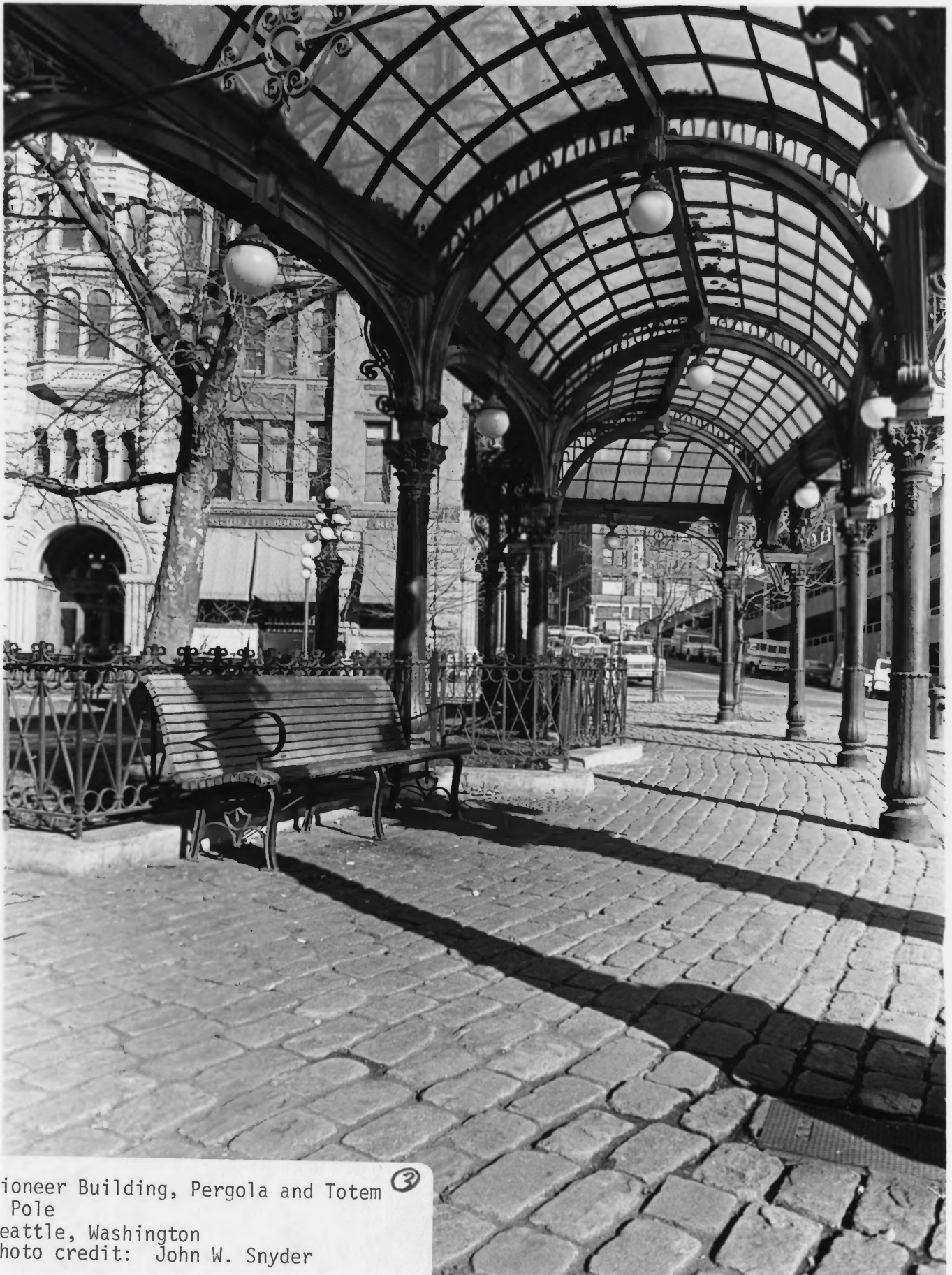
Pioneer Building, Pergola and Totem 3 Pole Seattle, Washington