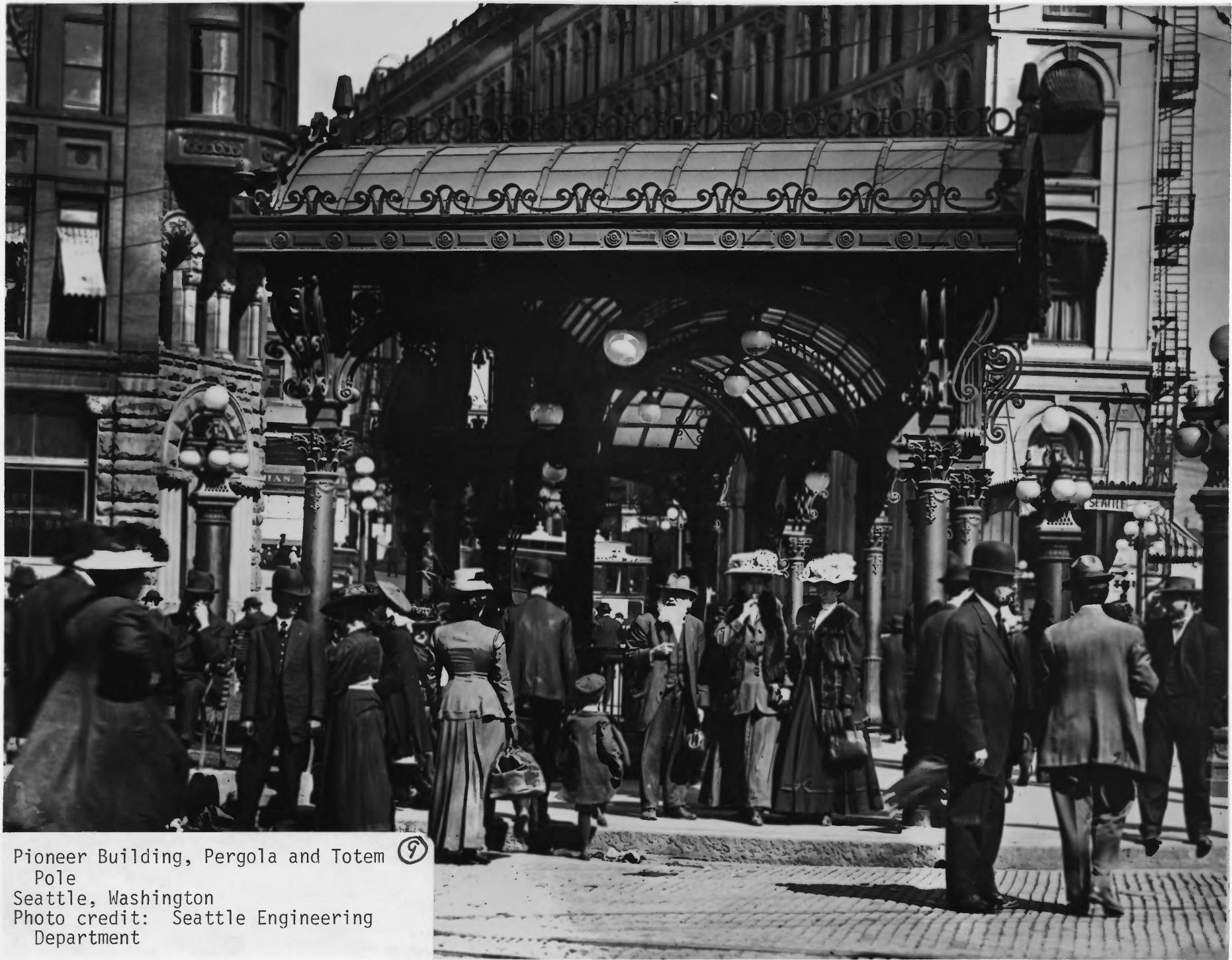
Pioneer Building, Pergola and Totem Pole ⑨ Seattle, Washington