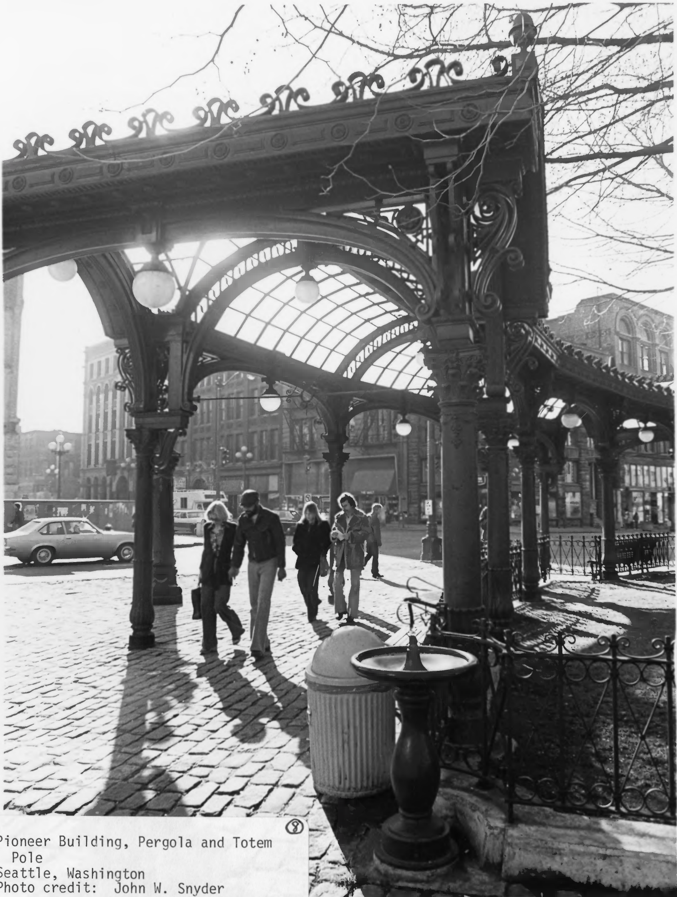
Pioneer Building, Pergola and Totem Pole Seattle, Washington