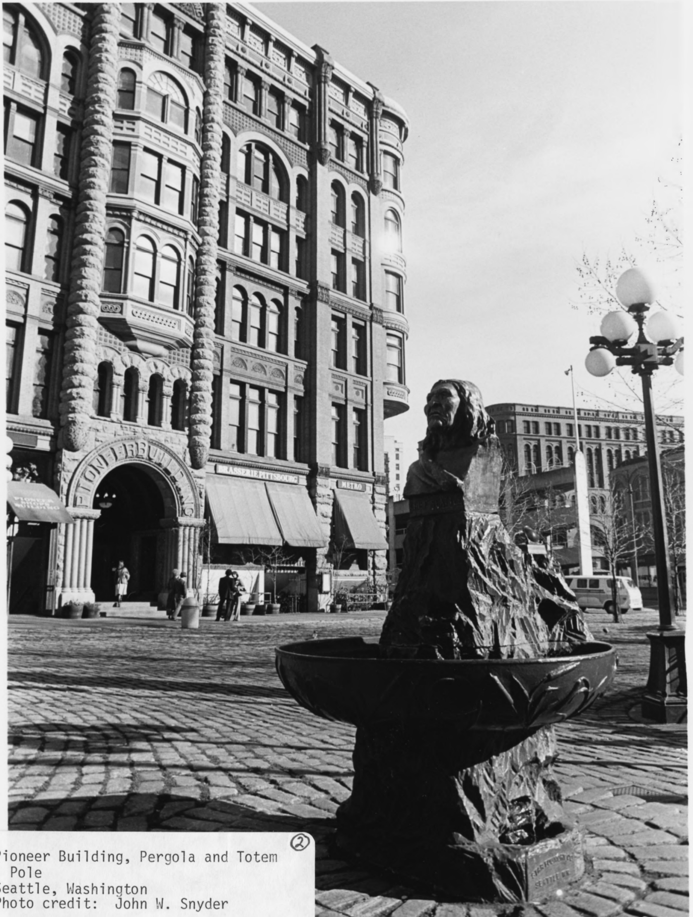
② Pioneer Building, Pergola and Totem Pole Seattle, Washington