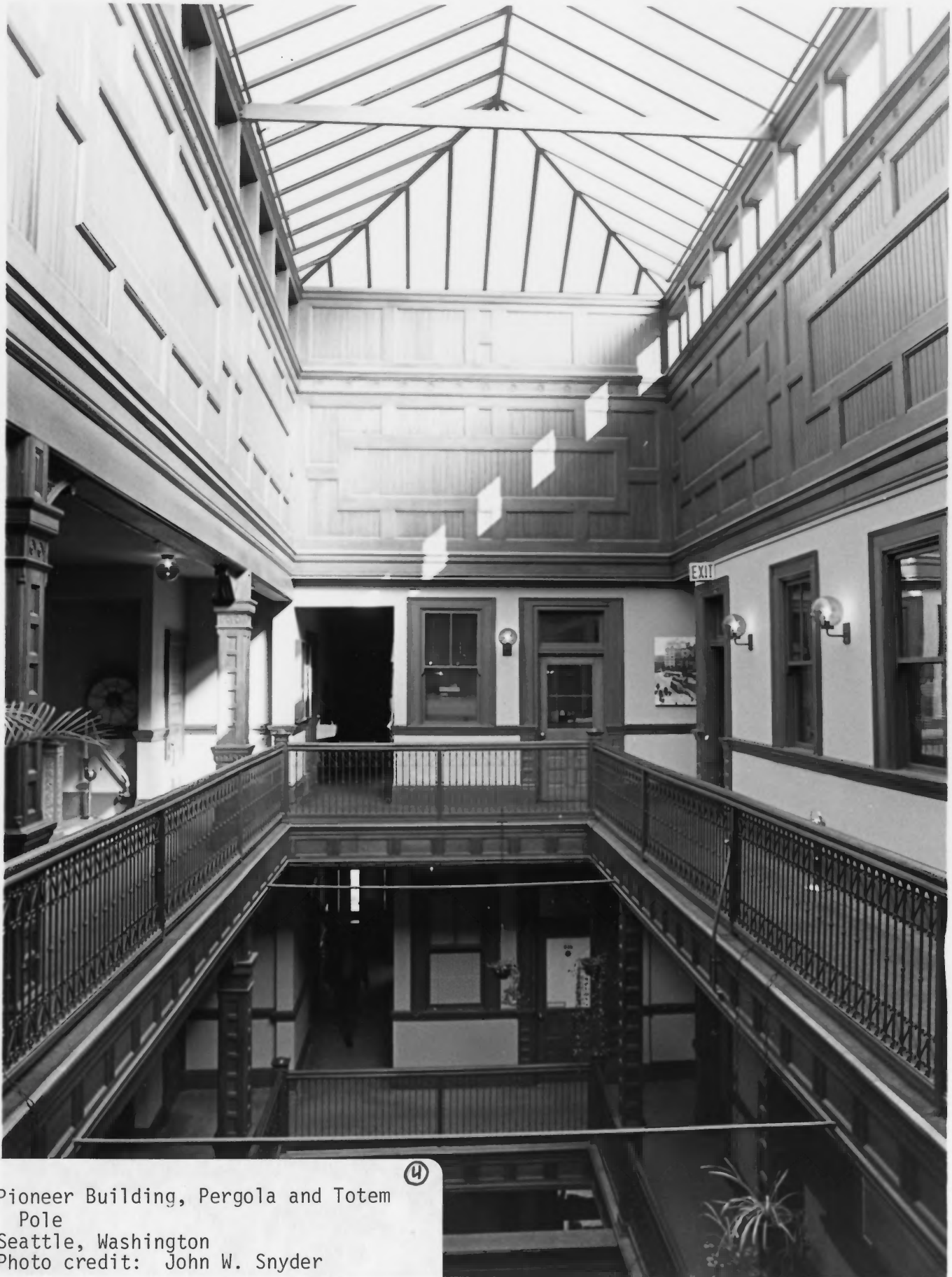
Pioneer Building, Pergola and Totem Pole Seattle, Washington