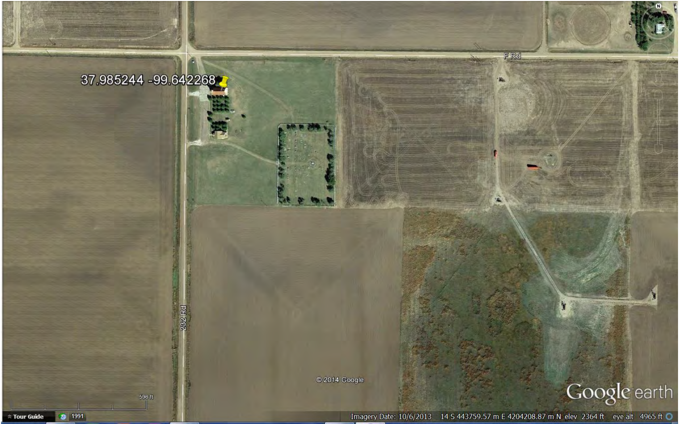
Figure 2: Close-In Aerial Image, Google Earth, 2014.

Hodgeman County, Kansas County and State