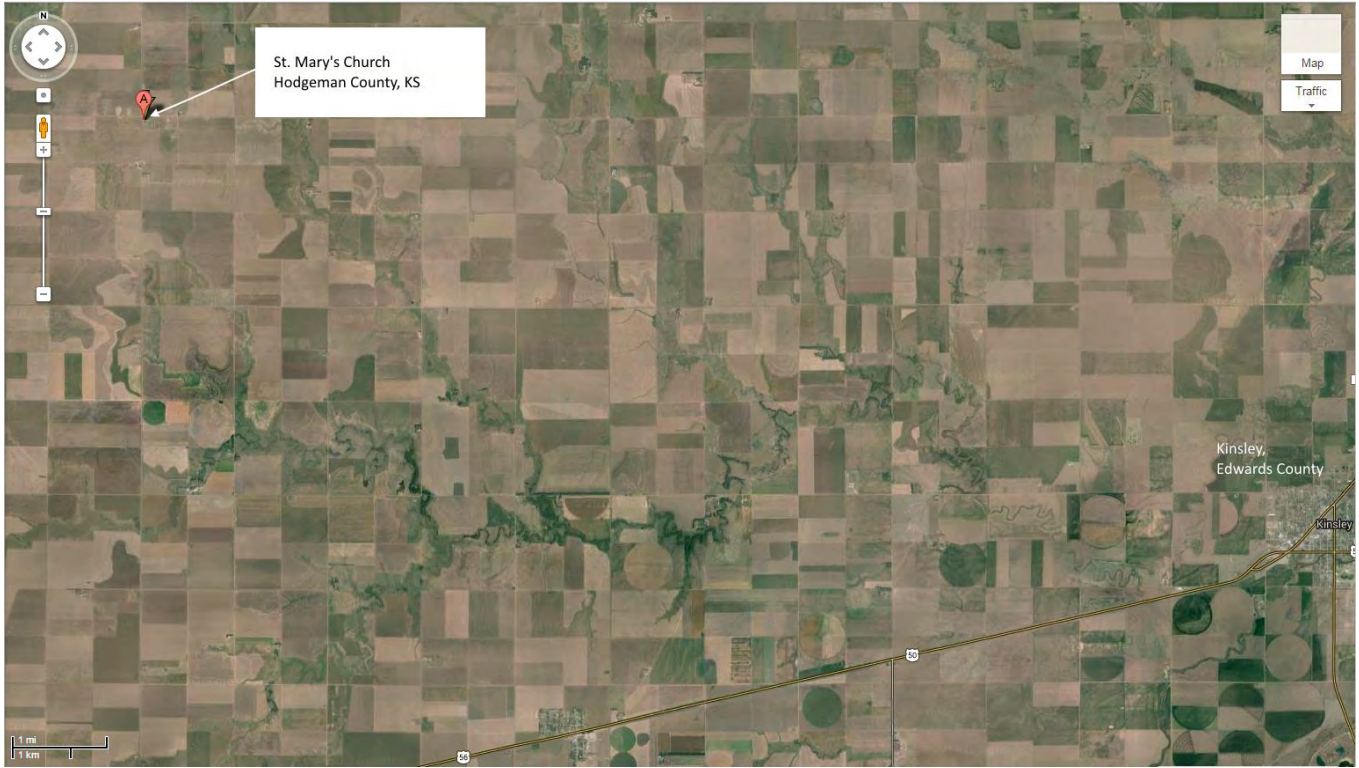
Figure 1: Contextual Aerial Image, Google Earth, 2014.

Include GIS maps, figures, scanned images below.