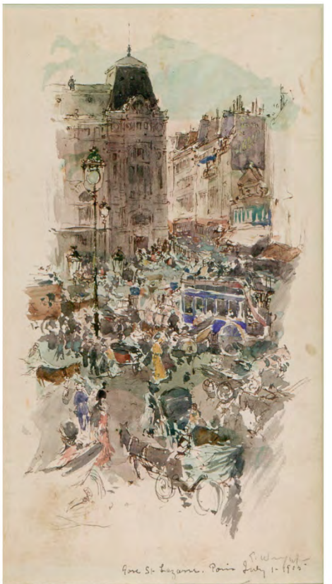
Figure 1. Sturges-Wright House. "Gare St. Lazare, Paris, July 1, 1905"