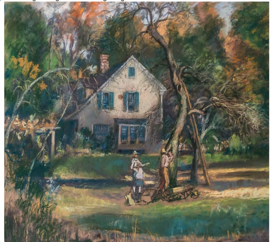
Figure 4. Sturges-Wright House. Painting of Sturges-Wright House c. 1920. George Hand Wright. Collection of Edward Gerber.