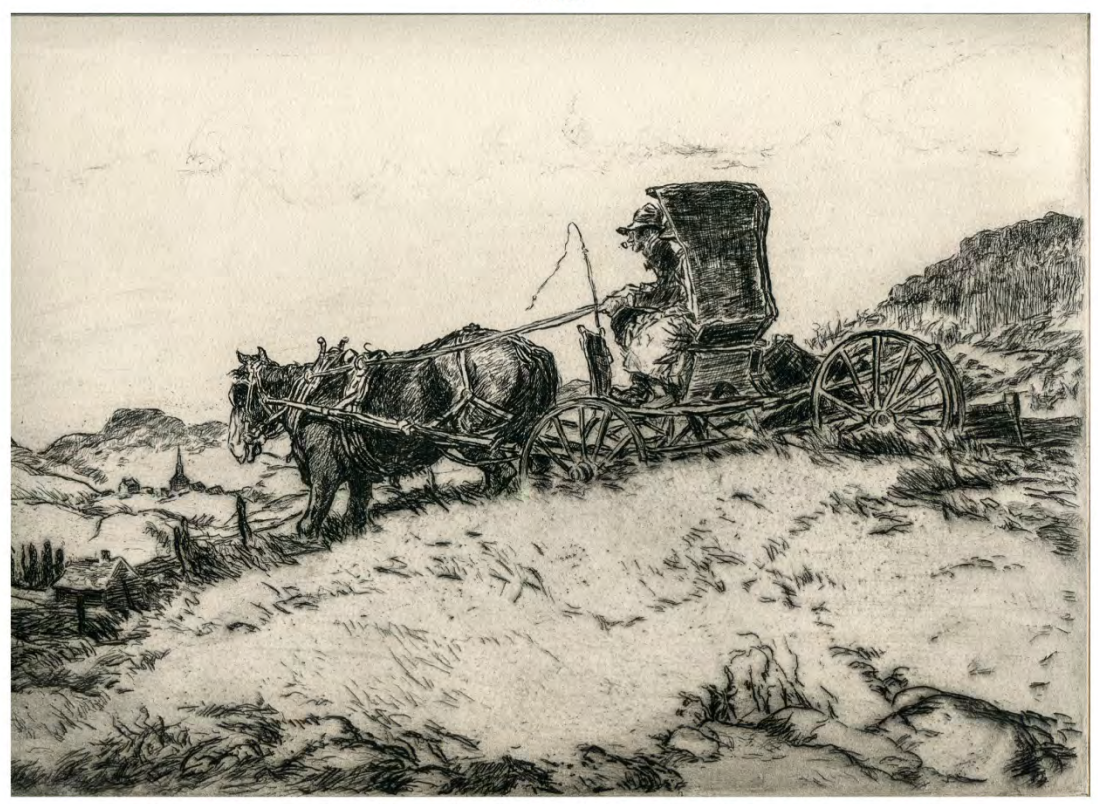
Figure 8. Sturges-Wright House. "Back To Earth." (detail) Collection of Edward Gerber.