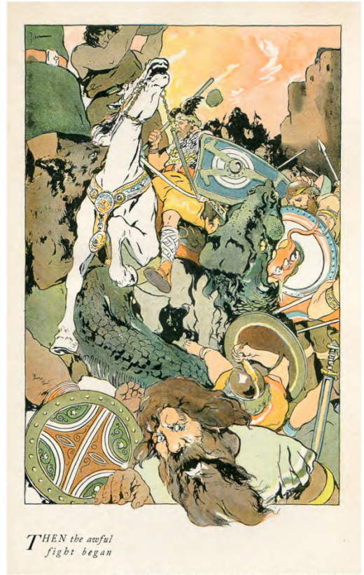
Figure 5. Sturges-Wright House. "The Awful Fight Begins." Collection of Edward Gerber.