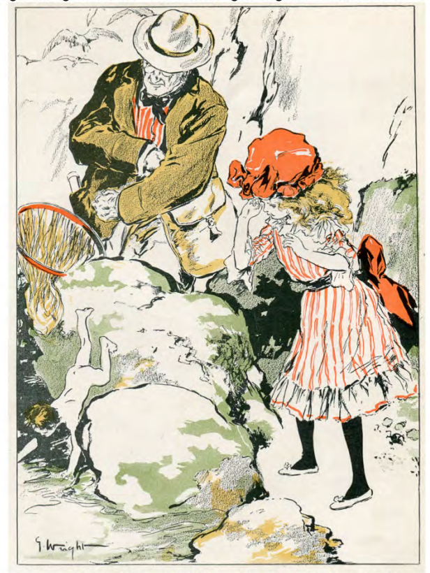
Figure 6. Sturges-Wright House. Water Babies." Collection of Edward Gerber.