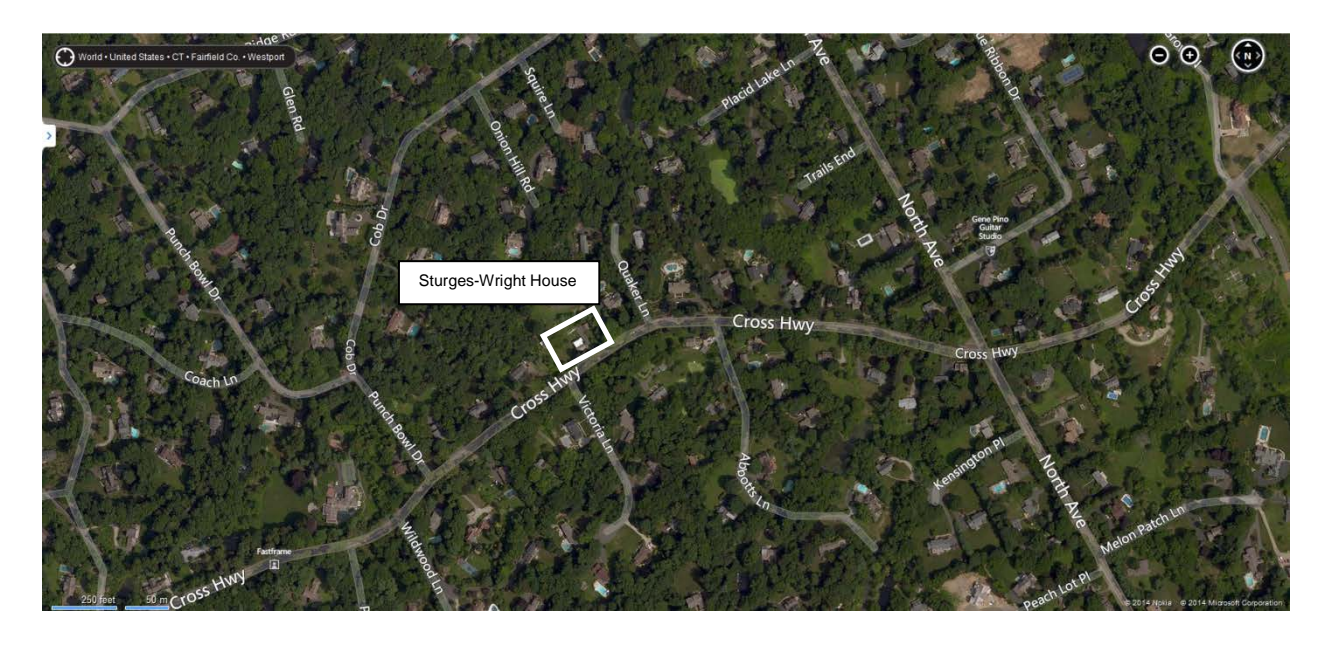
Map showing location of Sturges-Wright House

Estimated Burden Statement : Public reporting burden for this form is estimated to average 18 hours per response including time for reviewing instructions, gathering and maintaining data, and completing and reviewing the form. Direct comments regarding this burden estimate or any aspect of this form to the Office of Planning and Performance Management. U.S. Dept. of the Interior, 1849 C. Street, NW, Washington, DC.