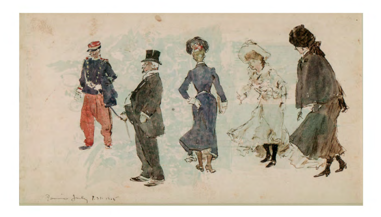
Figure 2. Sturges-Wright House. "Paris, July 1, 1905"