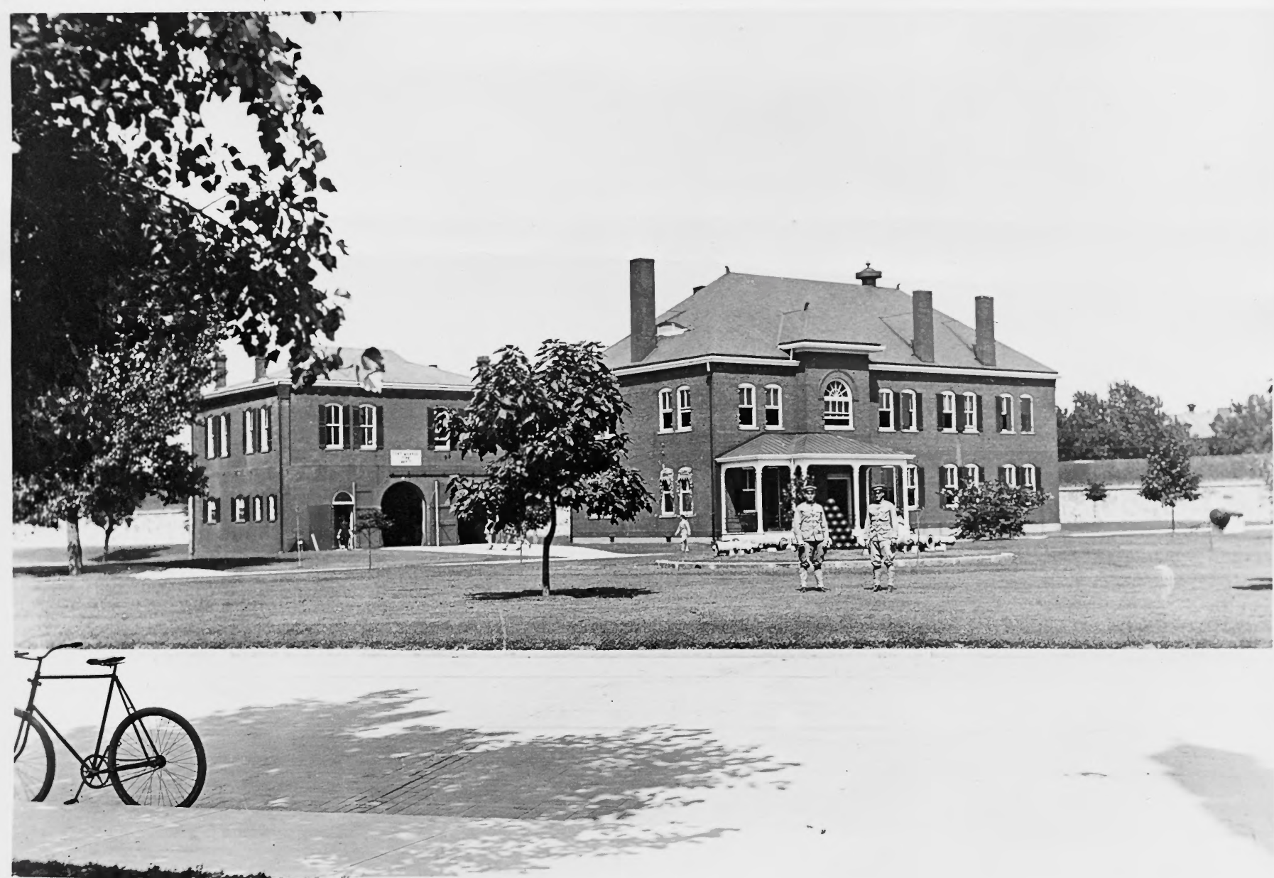
The Buildings are . Post Headquarters and Fire Department Building.