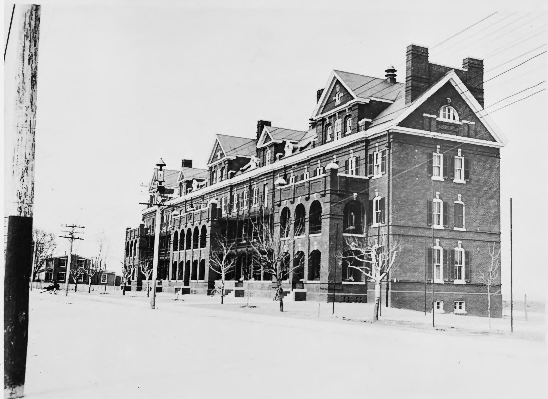
The new set of Bachelors' Quarters, and Main Street.