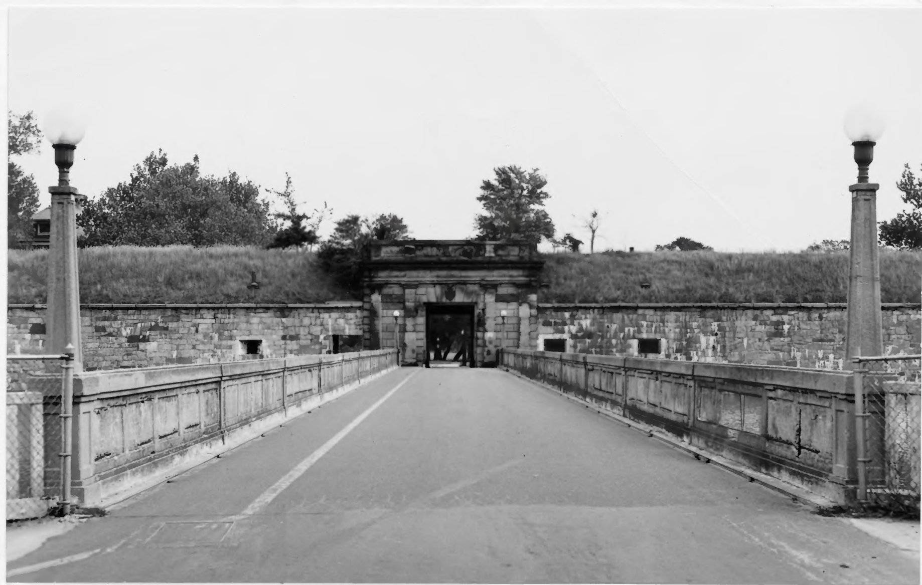
FORT MONROE, Virginia - Main gate to the old fort, looking east from the present Post Headquarters.