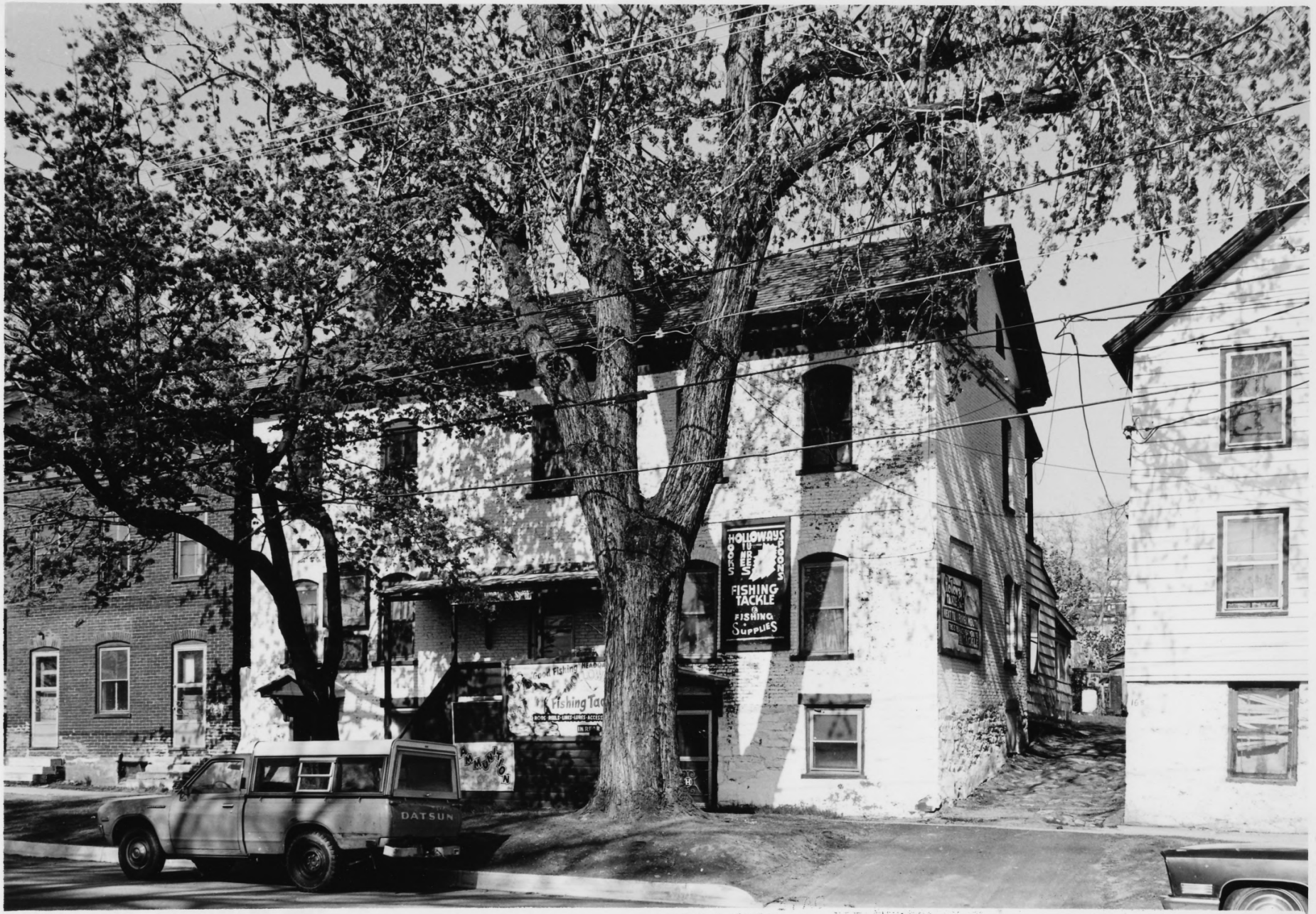
1974 HOLLOWAYS FISHING TACKLE & SUPPLIES DATSUN PICKUP TRUCK 1974