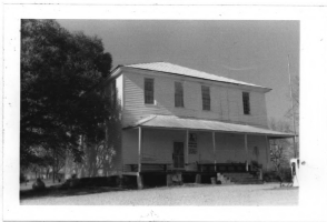
MARION COUNTY COURTHOUSE (Second)