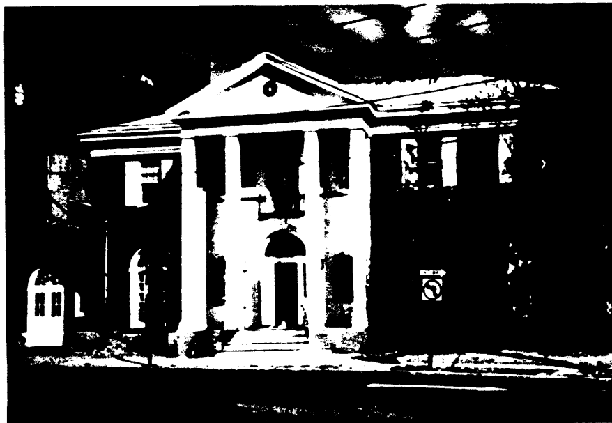
The circa 1926 Oritani Field Clubhouse which is omitted from National Register nomination. The Anderson Outkitchen is attached by a walkway to rear (north) additions of this building.