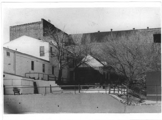
View looking west showing how Anderson Outkitchen is attached to clubhouse.