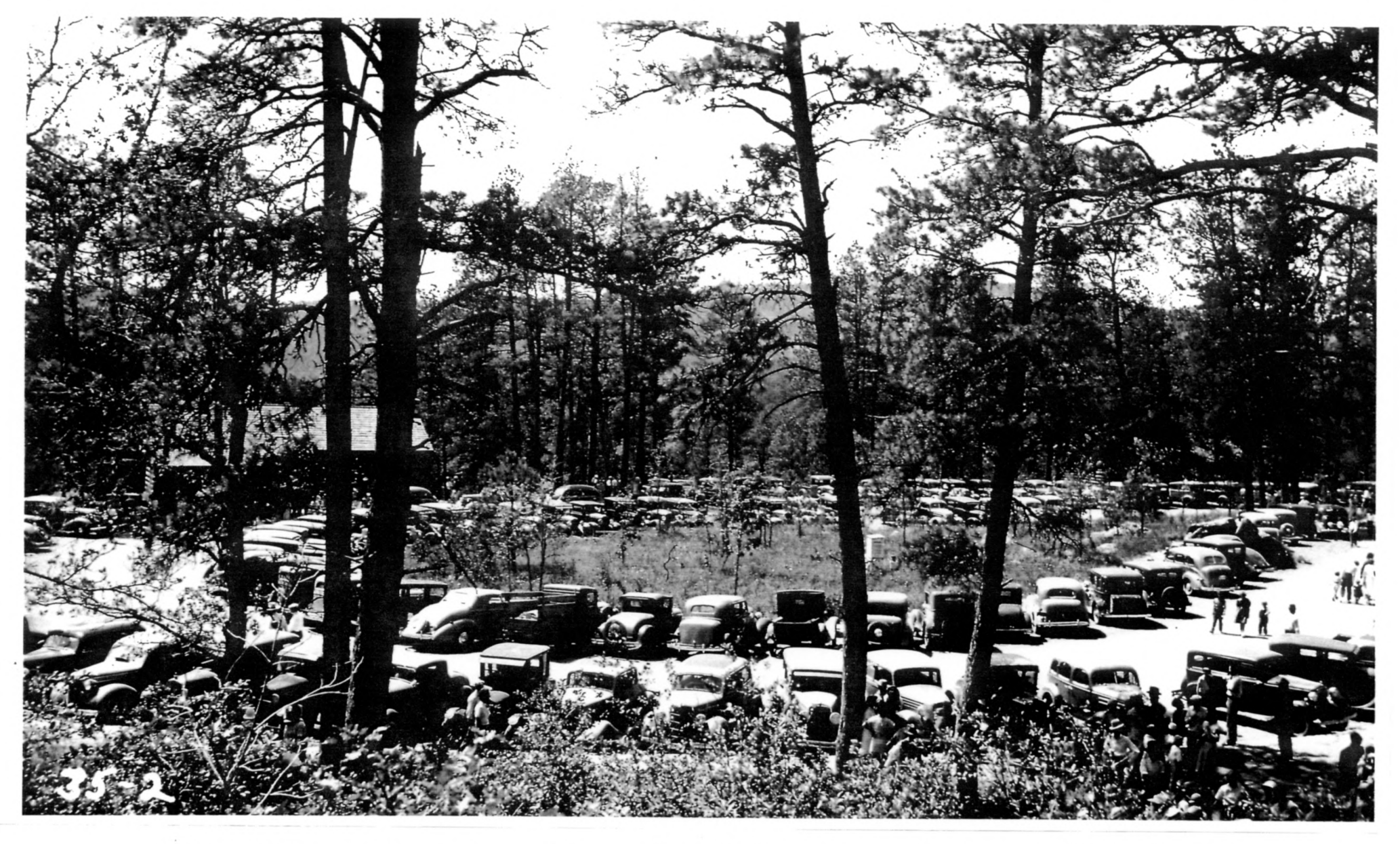
Old Headquarters Area - view of parking lot and center island, 1937.