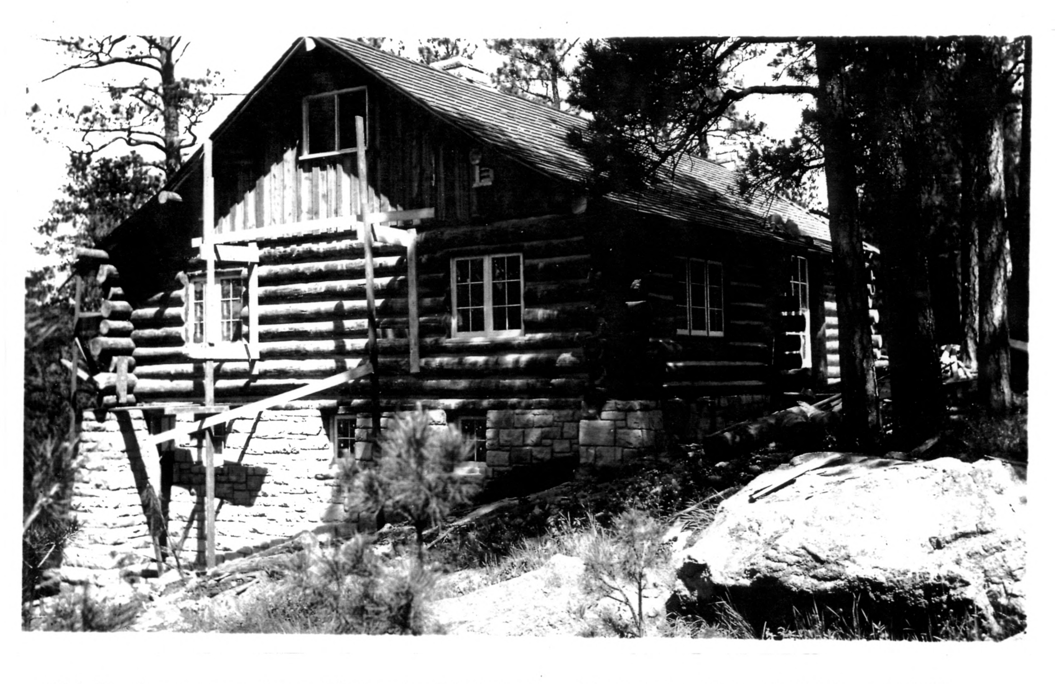
Old Headquarters Area Historic District - Administration Building (HS-3) Historic Photograph, dated 1935