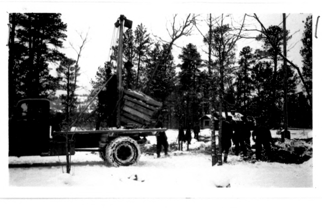
Tree transplanted to new site