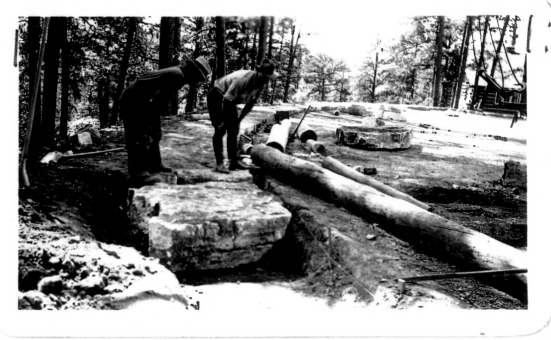
Laying Flagstone walk (Note size of individual stone)