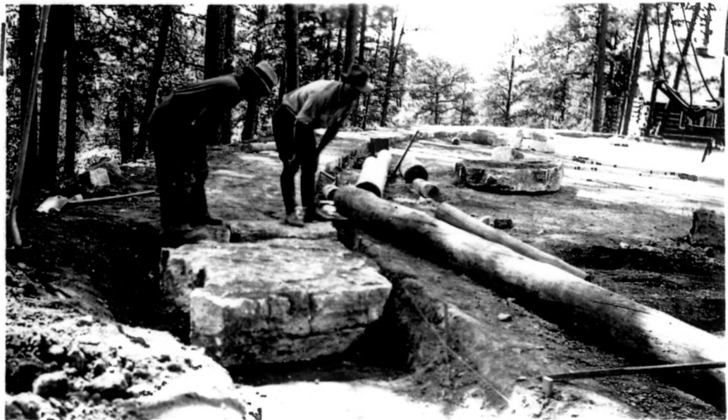
Laying Flagstone walk (Note size of individual stone)