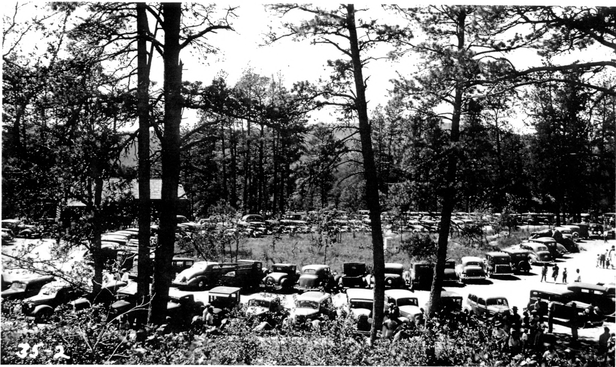
Old Headquarters Area - view of parking lot and center island, 1937.