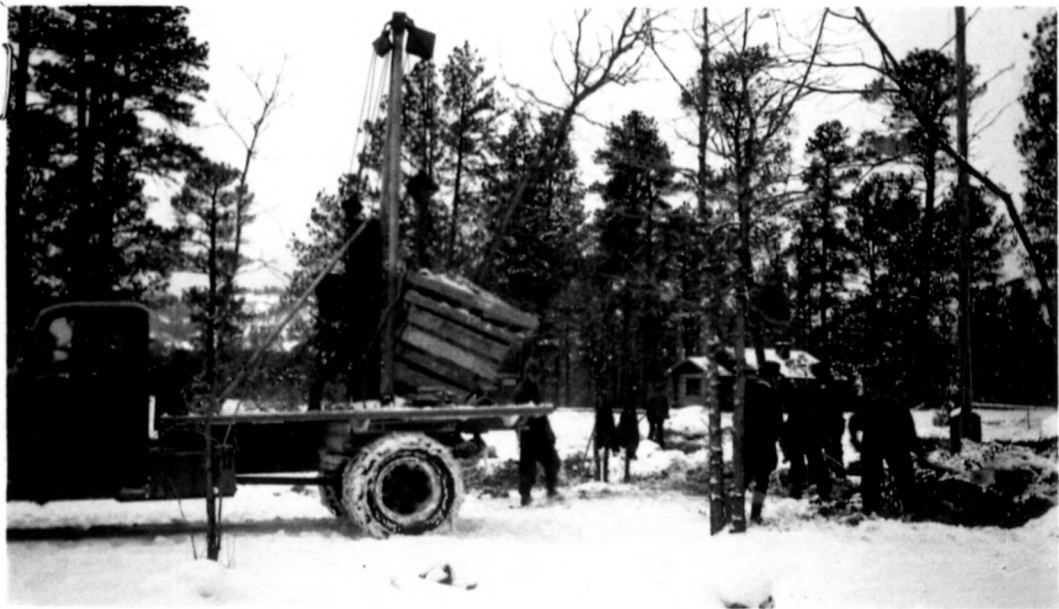
Tree transported to new site