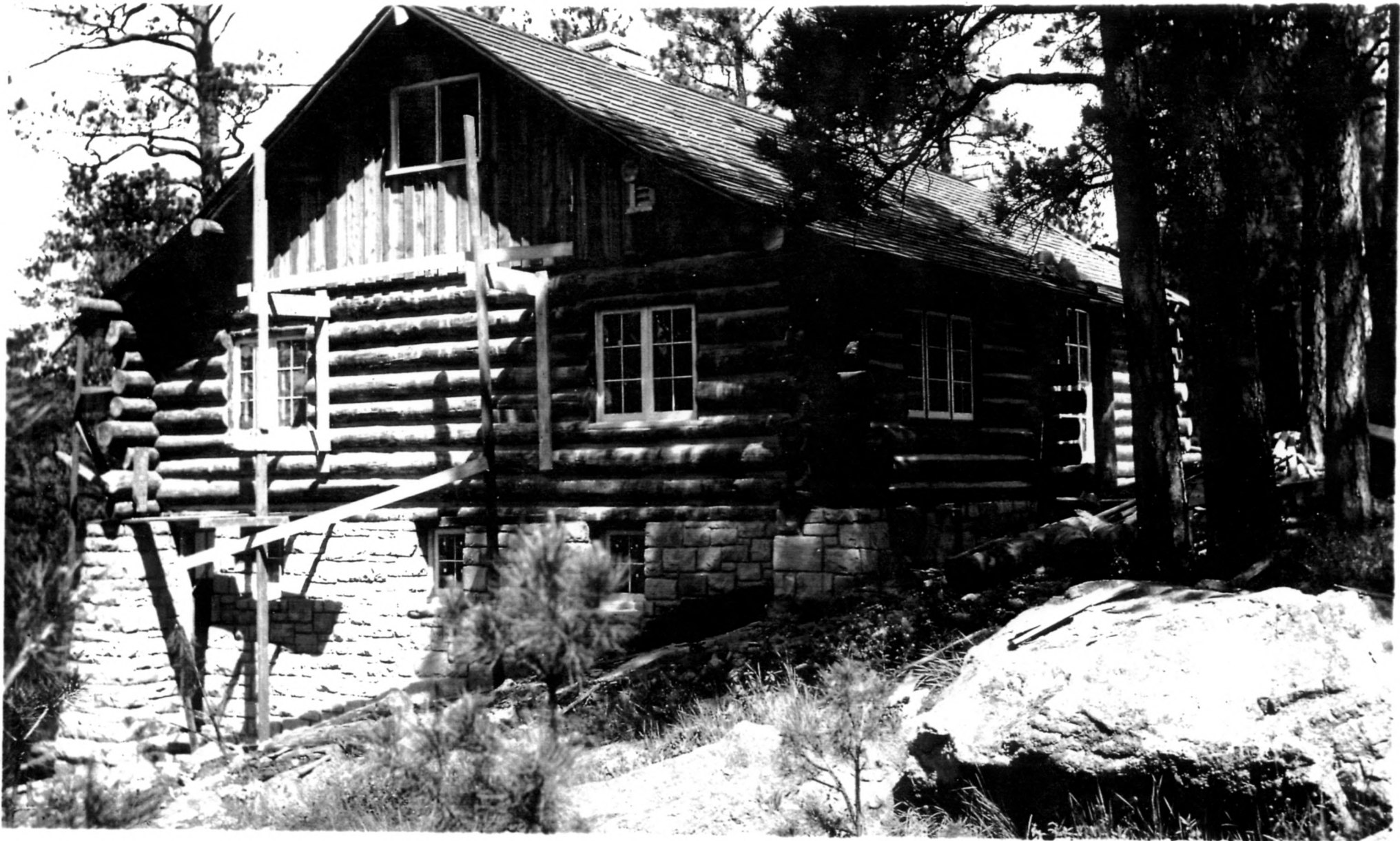
Old Headquarters Area Historic District - Administration Building (HS-3) Historic Photograph, dated 1935