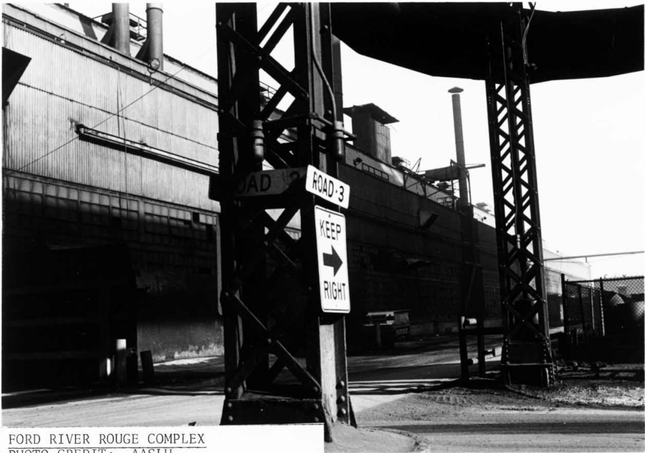
FORD RIVER ROUGE COMPLEX