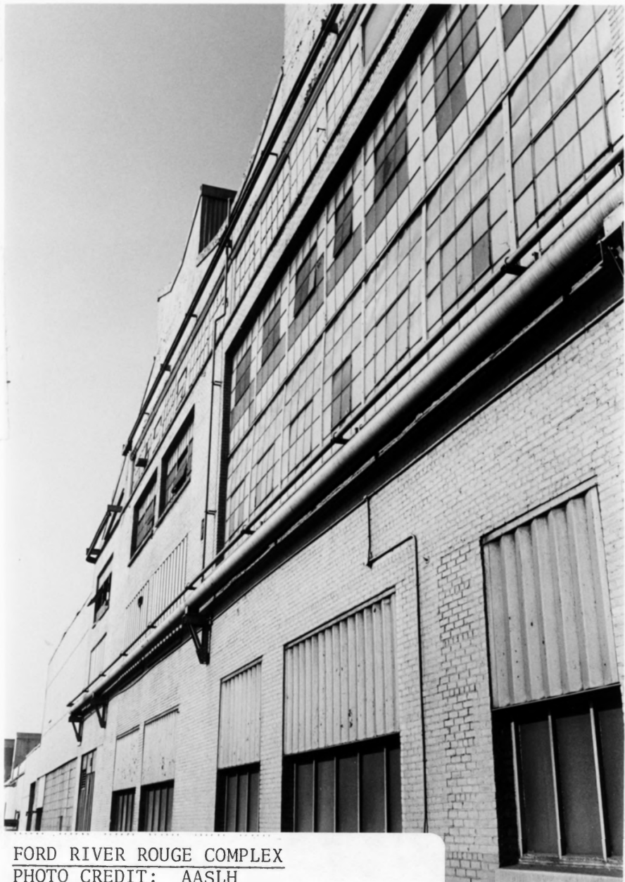
FORD RIVER ROUGE COMPLEX