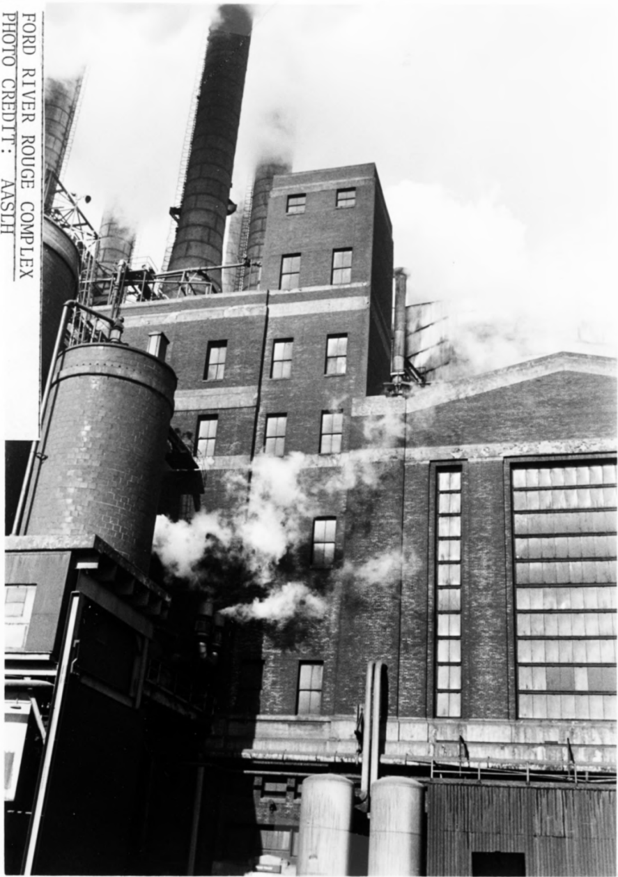
FORD RIVER ROUGE COMPLEX