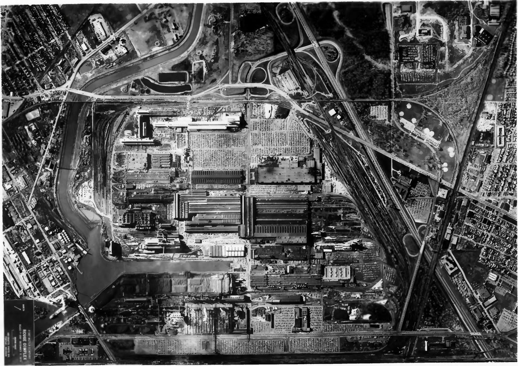
1950 FORD MOTOR COMPANY ROUGE COMPLEX DEARBORN, MICHIGAN AERIAL PHOTOGRAPH BY THE NATIONAL AERONAUTICS AND SPACE ADMINISTRATION GPO : 1950 O - 288-000