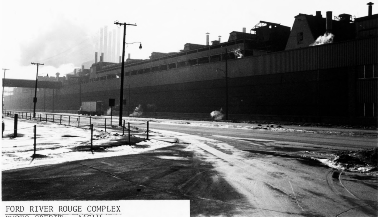
FORD RIVER ROUGE COMPLEX