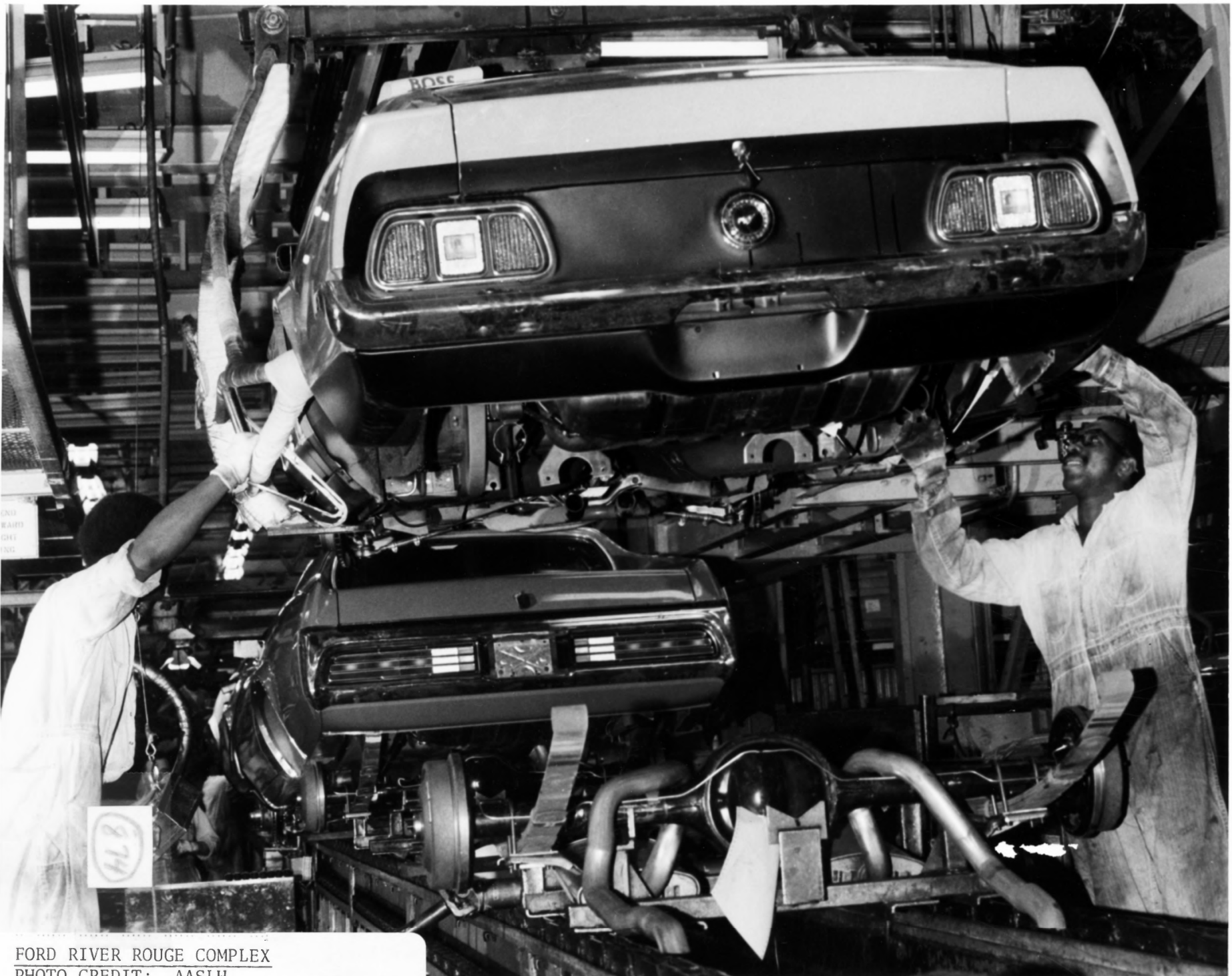
FORD RIVER ROUGE COMPLEX