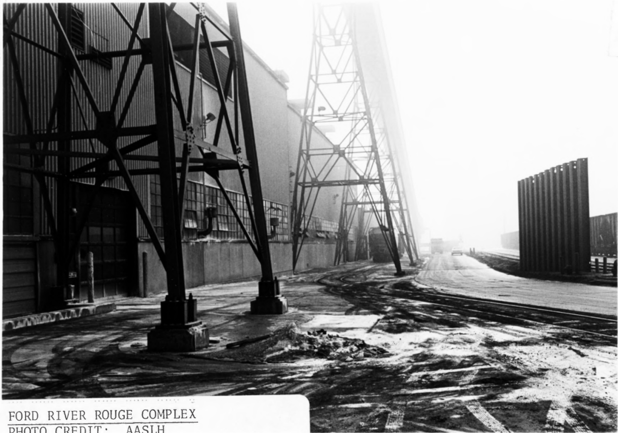
FORD RIVER ROUGE COMPLEX