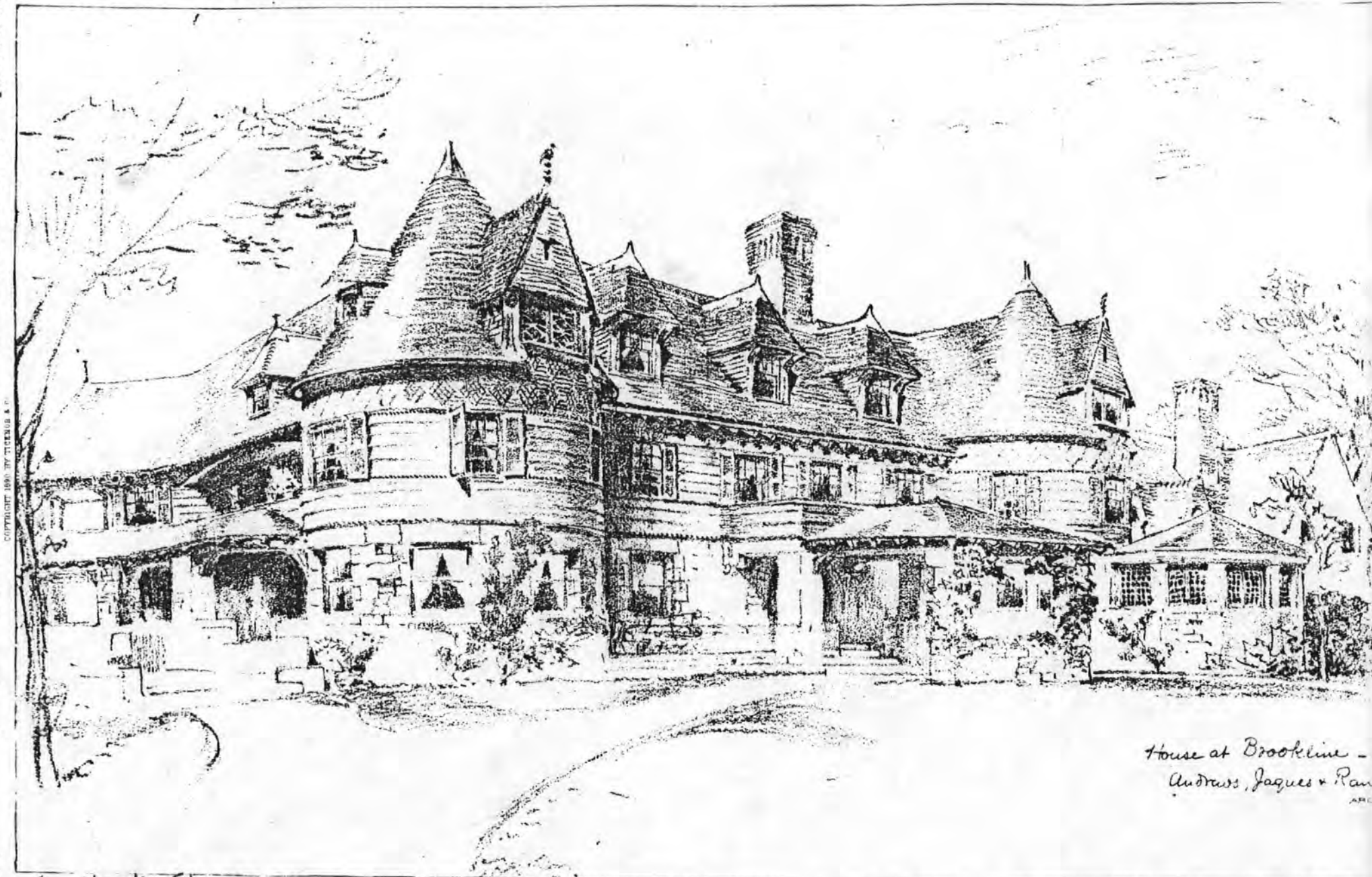
House at Brookline - Andrews, Jacques & Ran ARCH