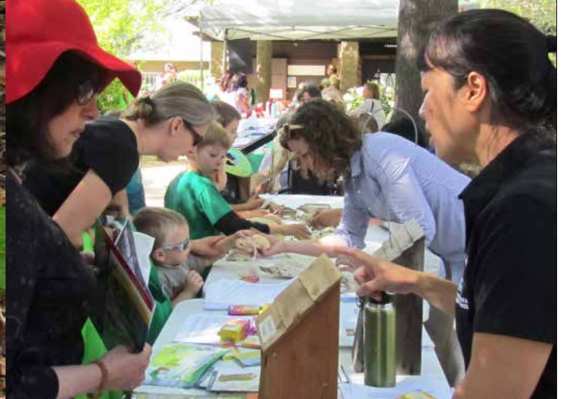
The new Nature Spotter smart phone app is engaging Riverside County residents in citizen science.