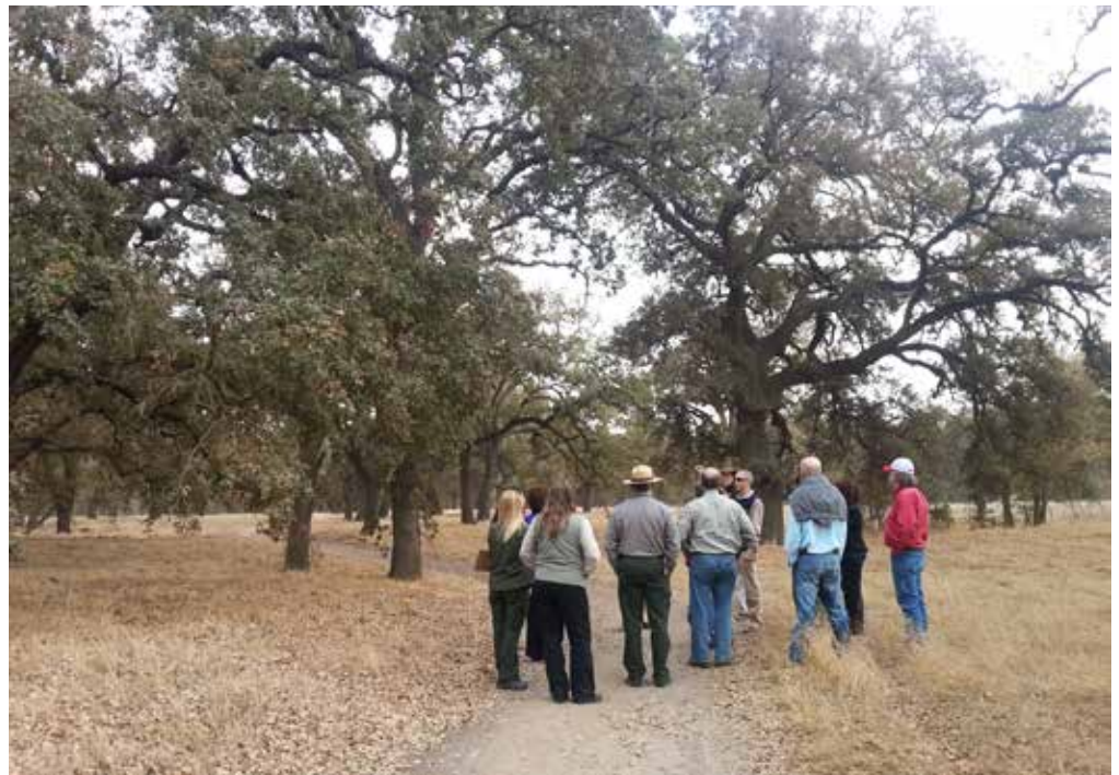
An interagency field tour stops in Ripon's Oak Grove to discuss existing and potential public access opportunities along the Lower Stanislaus River.

of San Benito County and adjacent lands. The NPS will assist the group in developing a toolbox of resources that address various concerns identified by landowners. Some of the resources may include communication tools, technical assistance, and funding programs.