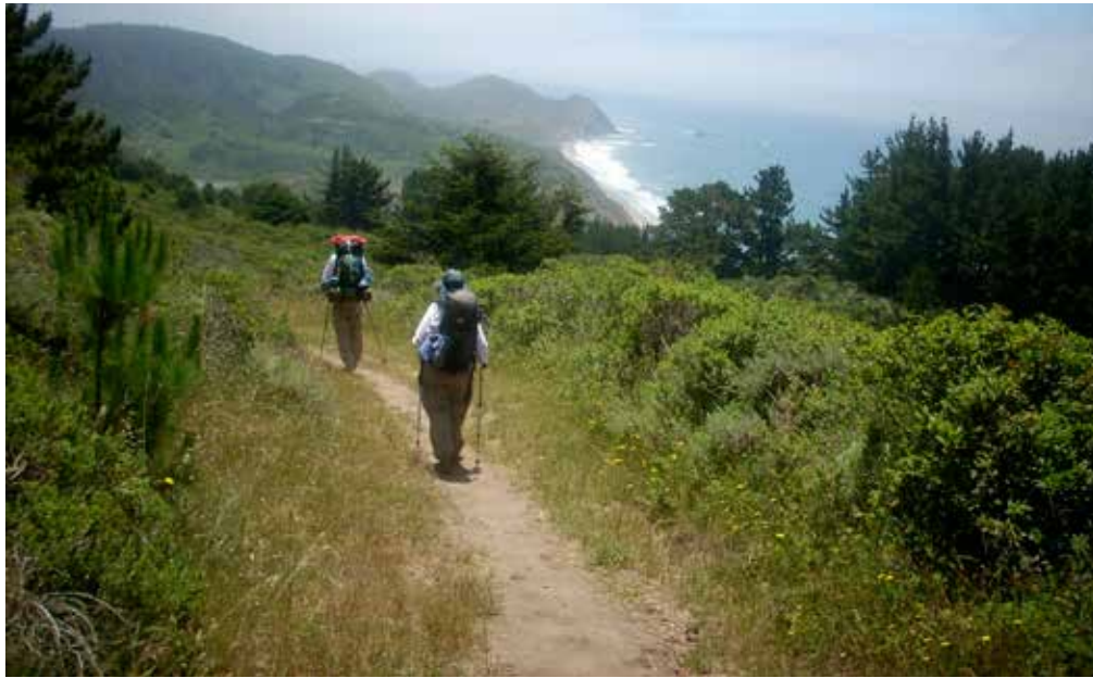
Hikers on the California Coastal Trail, which will eventually extend along the coast of the entire state.