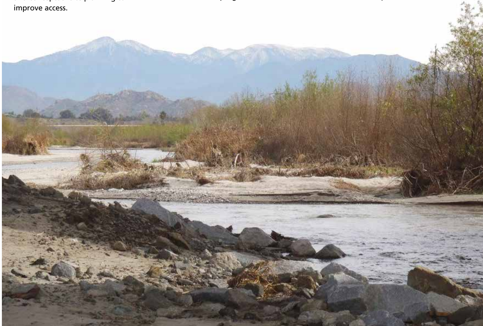
Partners are working to explore opportunities for water-based recreation access along the Santa Ana River.

The NPS is working with the Inland Empire Water Keeper and partners to analyze opportunities along 20 miles of the Santa Ana River within Riverside that can be considered viable for access to the river. The Santa Ana River is an important and unique natural resource in the Inland Empire, with the potential to provide much needed outdoor passive recreation for the community.