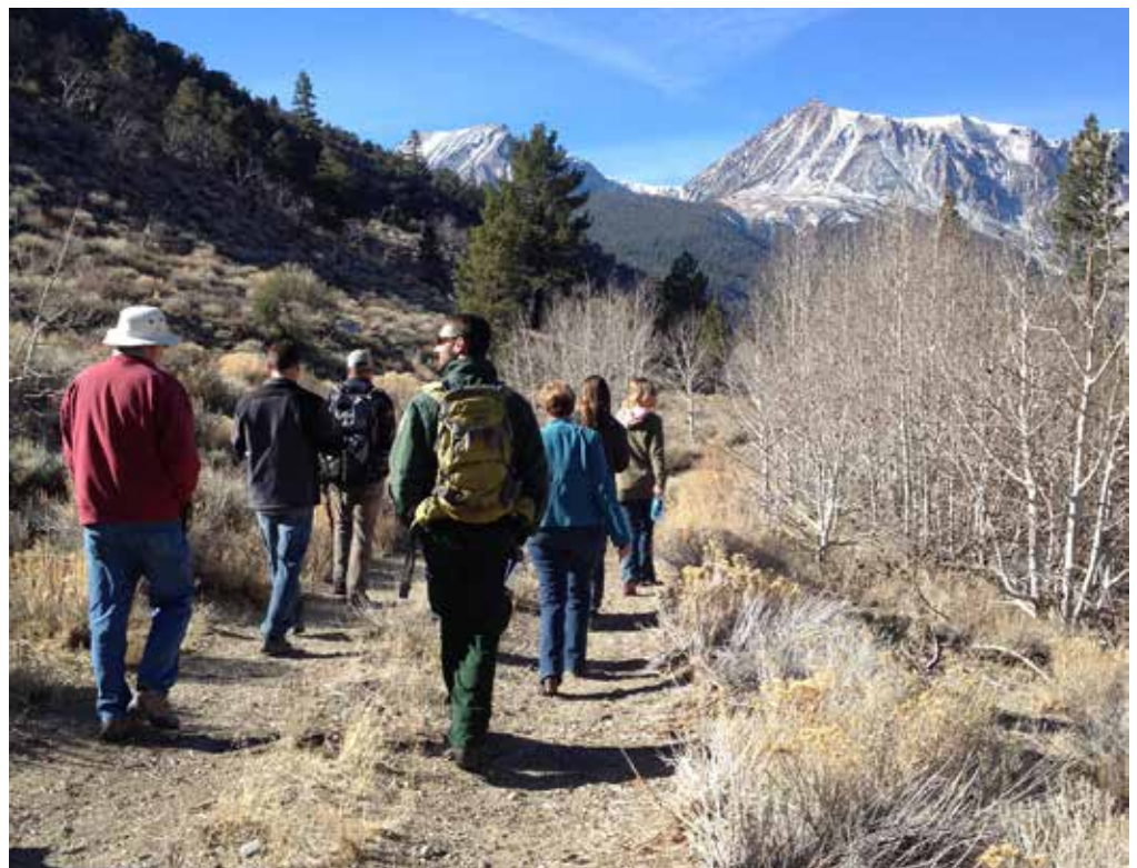
Mono-Yosemite Gateway Trail partners explore potential trail connections in Lee Vining.

This collaboration, led by the City of Los Angeles and made possible by a grant from the US Department of Housing and Urban Development, will support multi-agency, cross-disciplinary planning for a comprehensive, complementary system of community revitalization improvements along a portion of the Los Angeles River's ecologically-vibrant, 10-mile Glendale Narrows stretch. Building on efforts from the Urban Waters Federal Partnership and the America's Great Outdoors Initiative, both of which focused on the Los Angeles River, the NPS will support development of recommendations for enhanced river access, including water-based recreation.