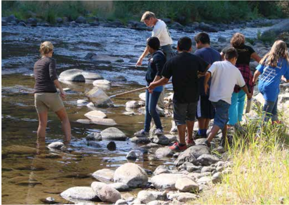
Outdoor educators and students along Butte Creek take a closer look at aquatic invertebrates.

programs that will connect youth to the outdoors. These efforts will yield improved local stewardship of natural resources and more environmentally aware and active youth. The NPS will facilitate strategic planning for this growing outdoor education partnership to promote its success and sustainability in the years ahead.