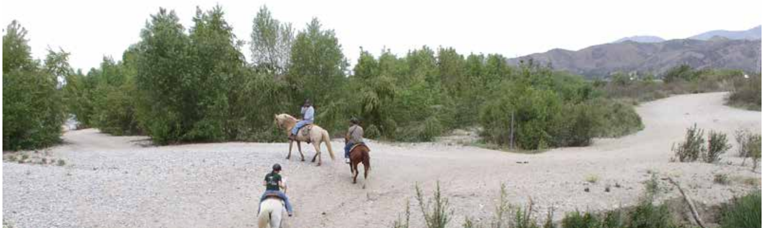
The trails around the Sunland/Tujunga area of Los Angeles are popular with a variety of trail users. The NPS will work with a variety of partners to address trail restoration, connectivity, and protection.

A diverse group of education partners and providers in Butte County are coming together to coordinate and deliver outdoor education services and